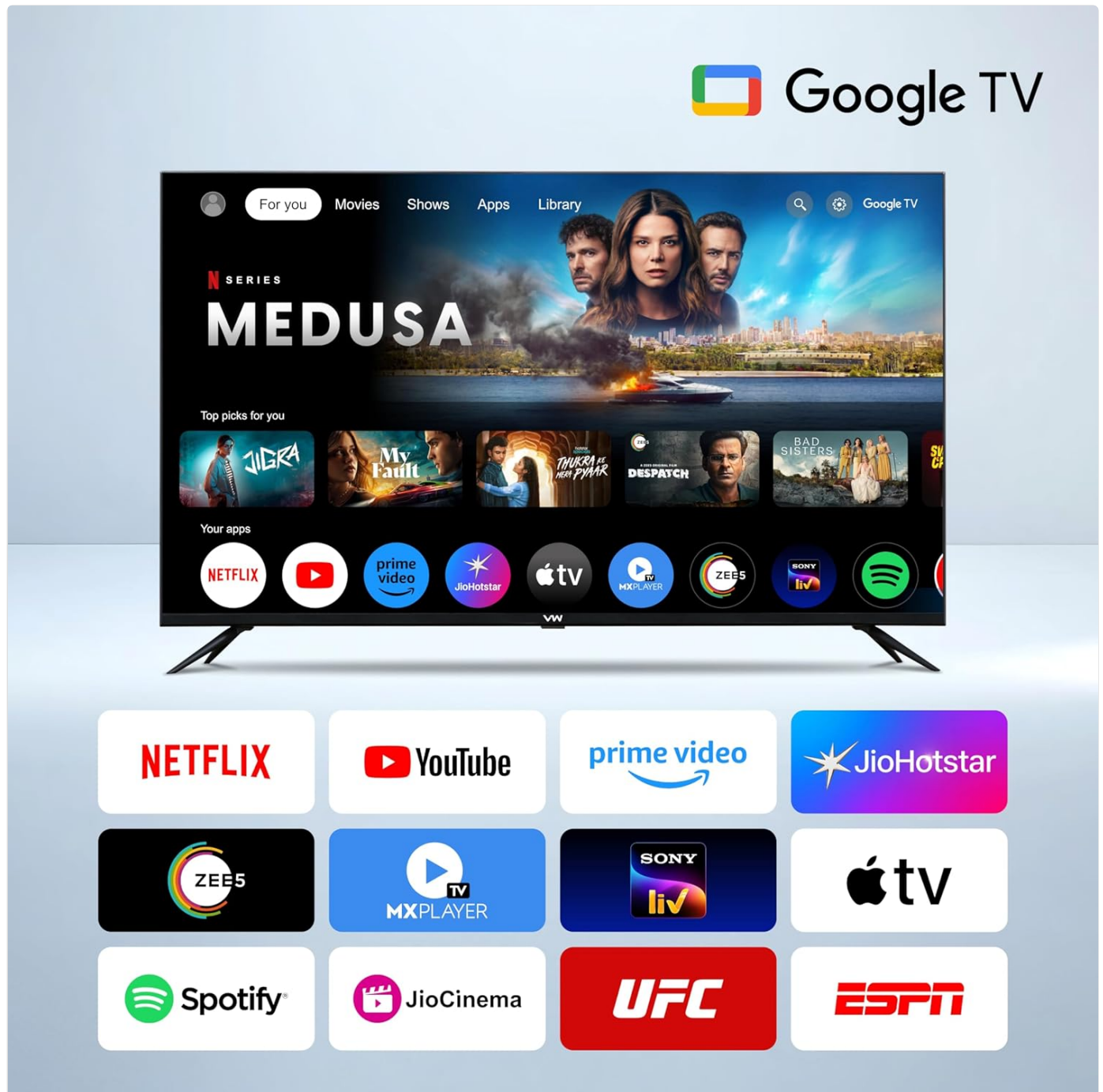
Image: Screenshot of the Google TV home screen, displaying content recommendations and various streaming application icons such as Netflix, YouTube, Prime Video, JioCinema, and Spotify.

Your VW TV runs on Google TV, offering a personalized and intuitive smart TV experience.