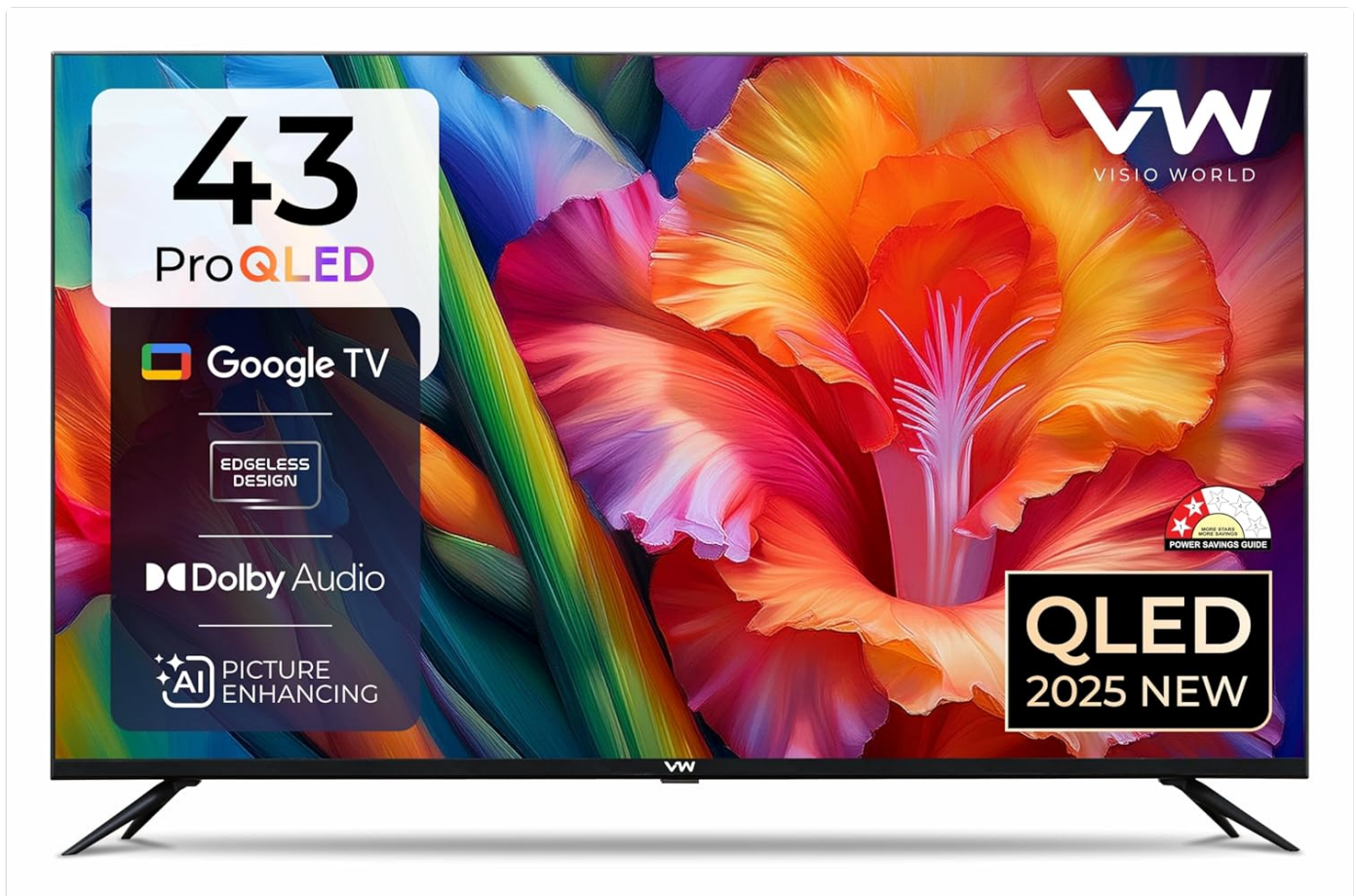
Image: Front view of the VW 43-inch Pro Series 4K Ultra HD Smart QLED Google TV, highlighting its QLED display and Google TV features.