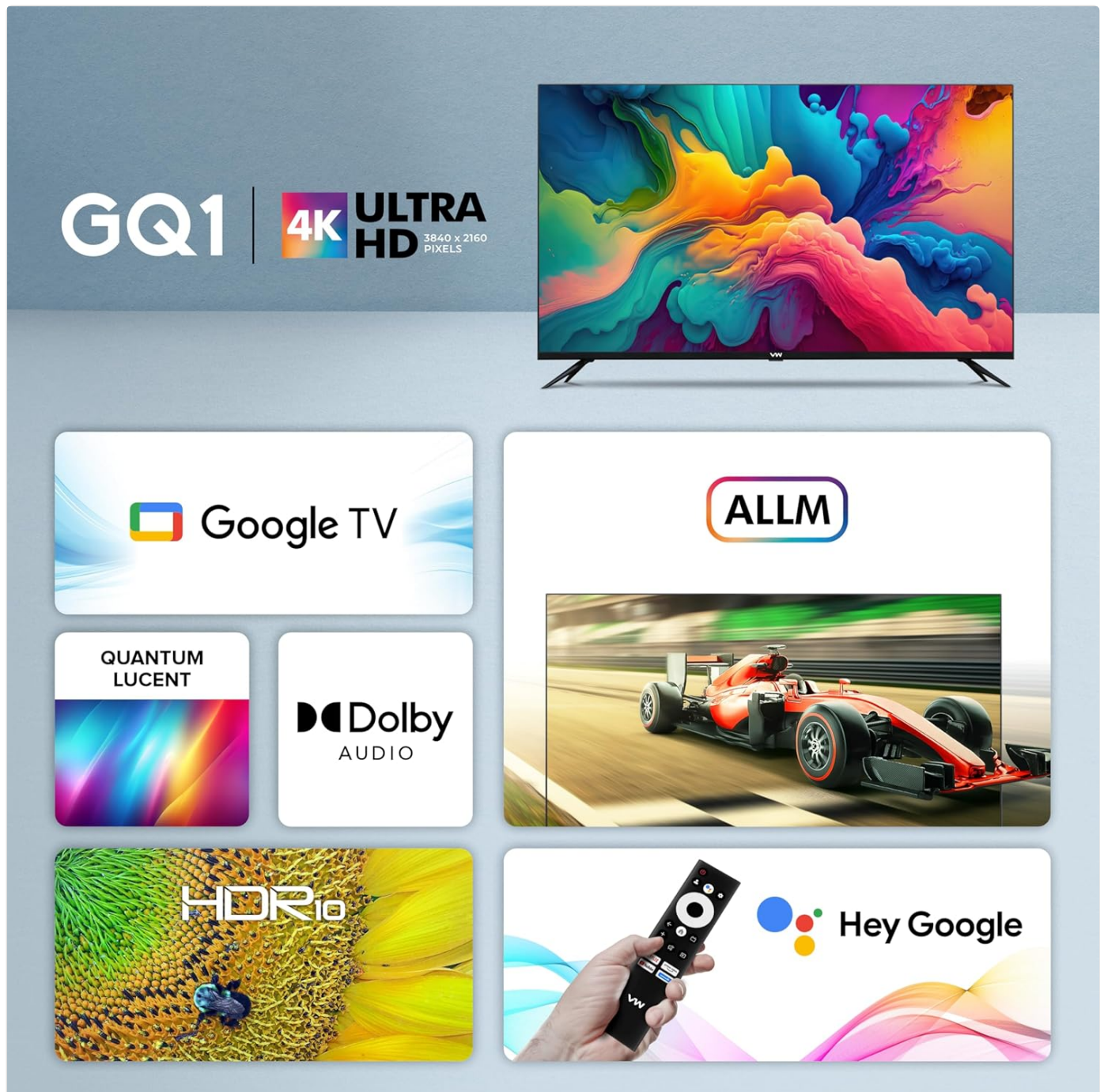
Image: Graphic illustrating key features of the VW GQ1 TV, including 4K Ultra HD resolution, Google TV, ALLM, Quantum Lucent display, Dolby Audio, HDR10, and Google Assistant integration.