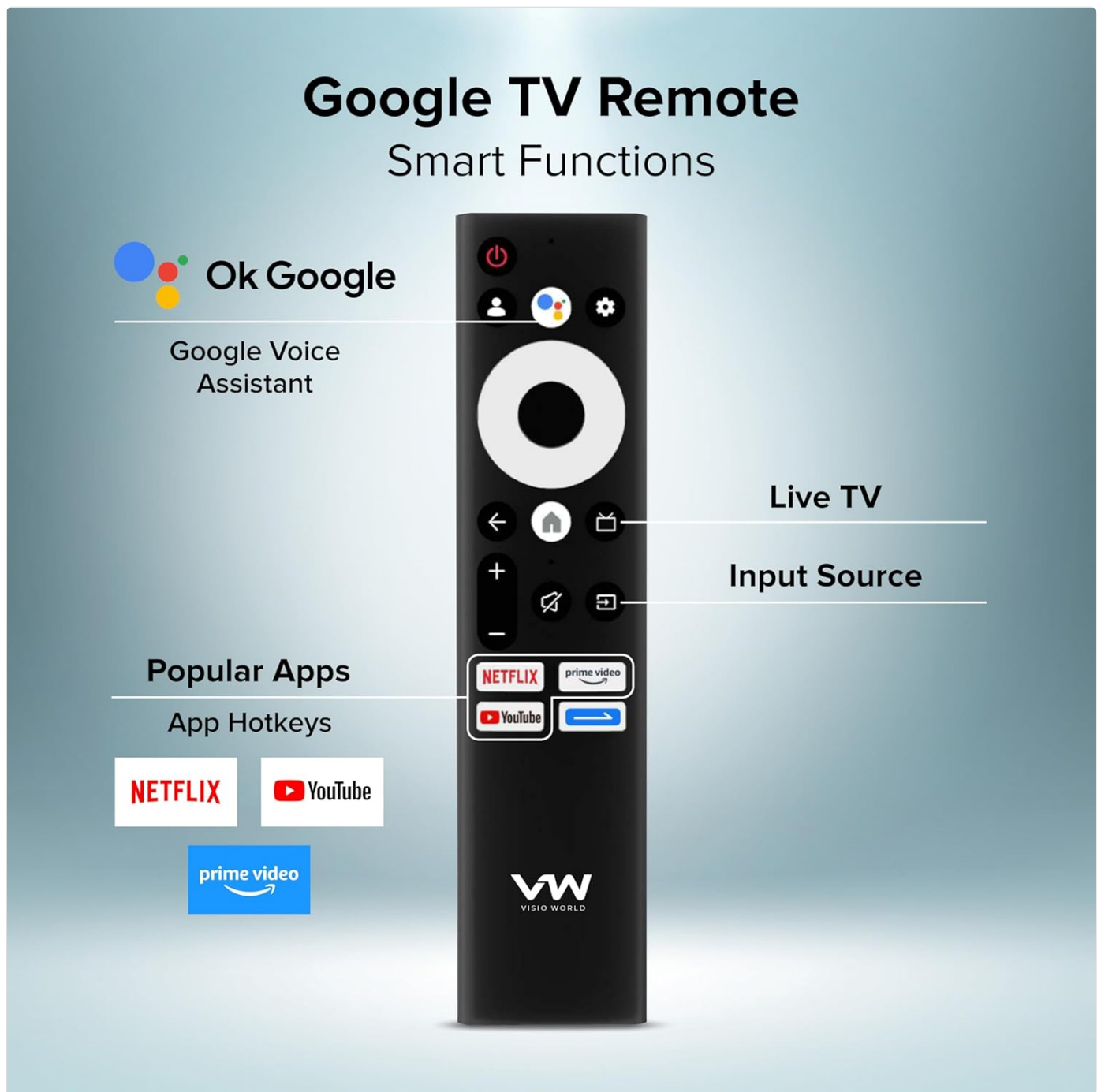
Image: Illustration of the Google TV remote control, highlighting buttons for Google Voice Assistant, Live TV, Input Source, and dedicated hotkeys for Netflix, YouTube, and Prime Video.

The included remote control provides full functionality for your Google TV. It supports both IR and Bluetooth technology, and features voice assistant capabilities.