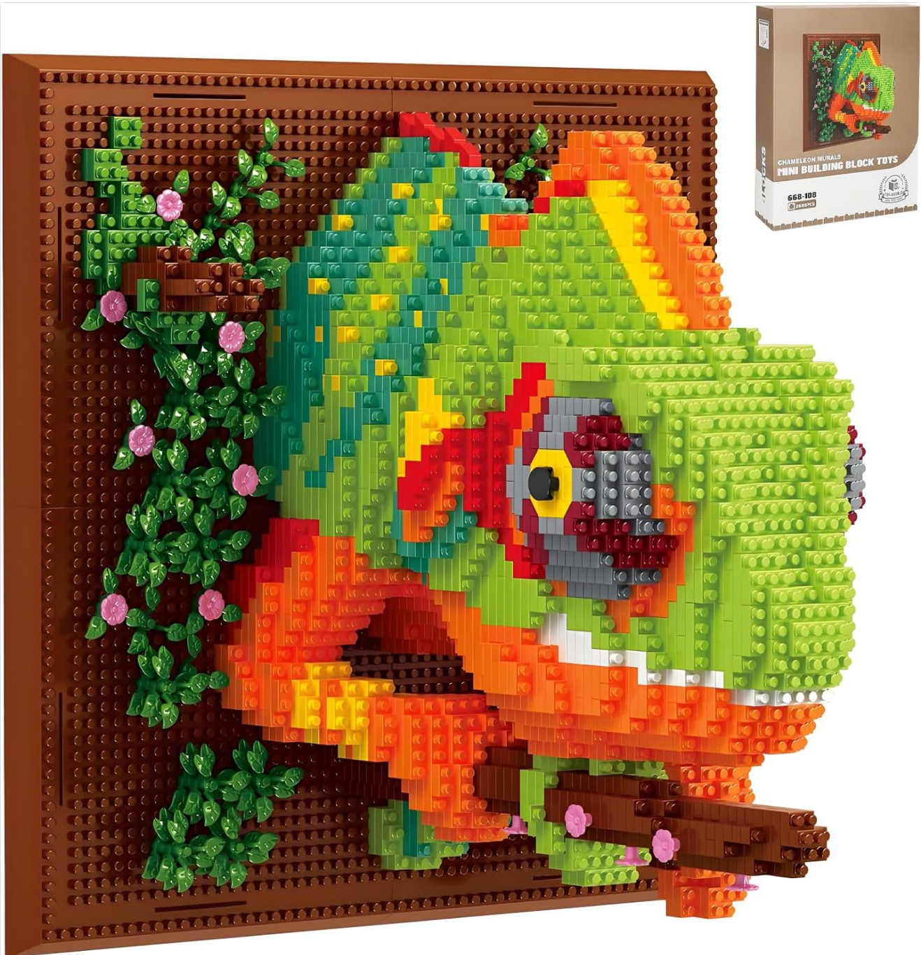
Image: The complete Wall Art Chameleon Building Blocks Set, showing the assembled chameleon mural and its retail packaging.