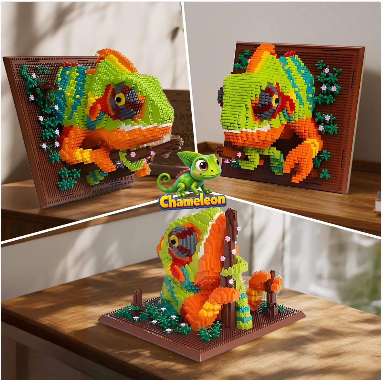
Image: A collage showing the chameleon mural displayed in various settings, including wall-mounted and freestanding on a surface.