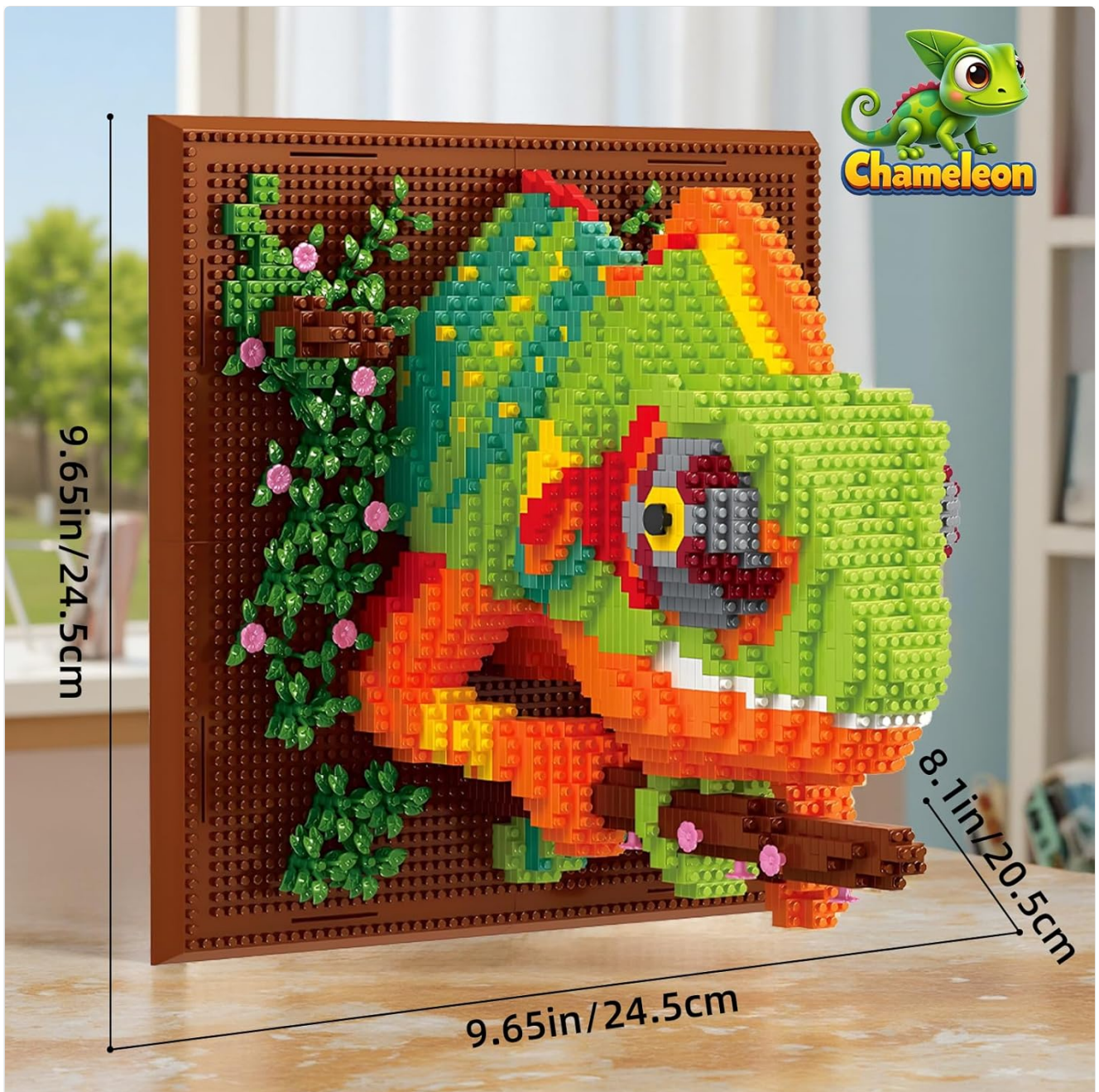
Image: Visual representation of the assembled chameleon mural's dimensions, approximately 9.65 inches (24.5 cm) in length and width, and 8.1 inches (20.5 cm) in depth.