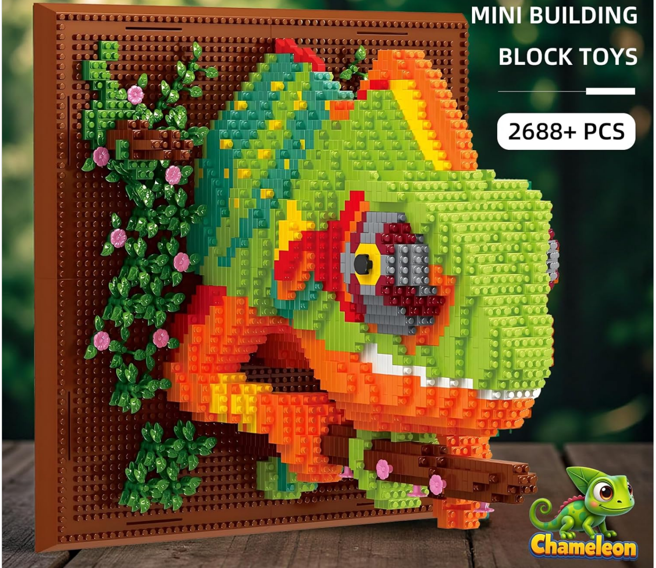
Image: The assembled chameleon mural, highlighting its intricate details and the '2688+ PCS' count.