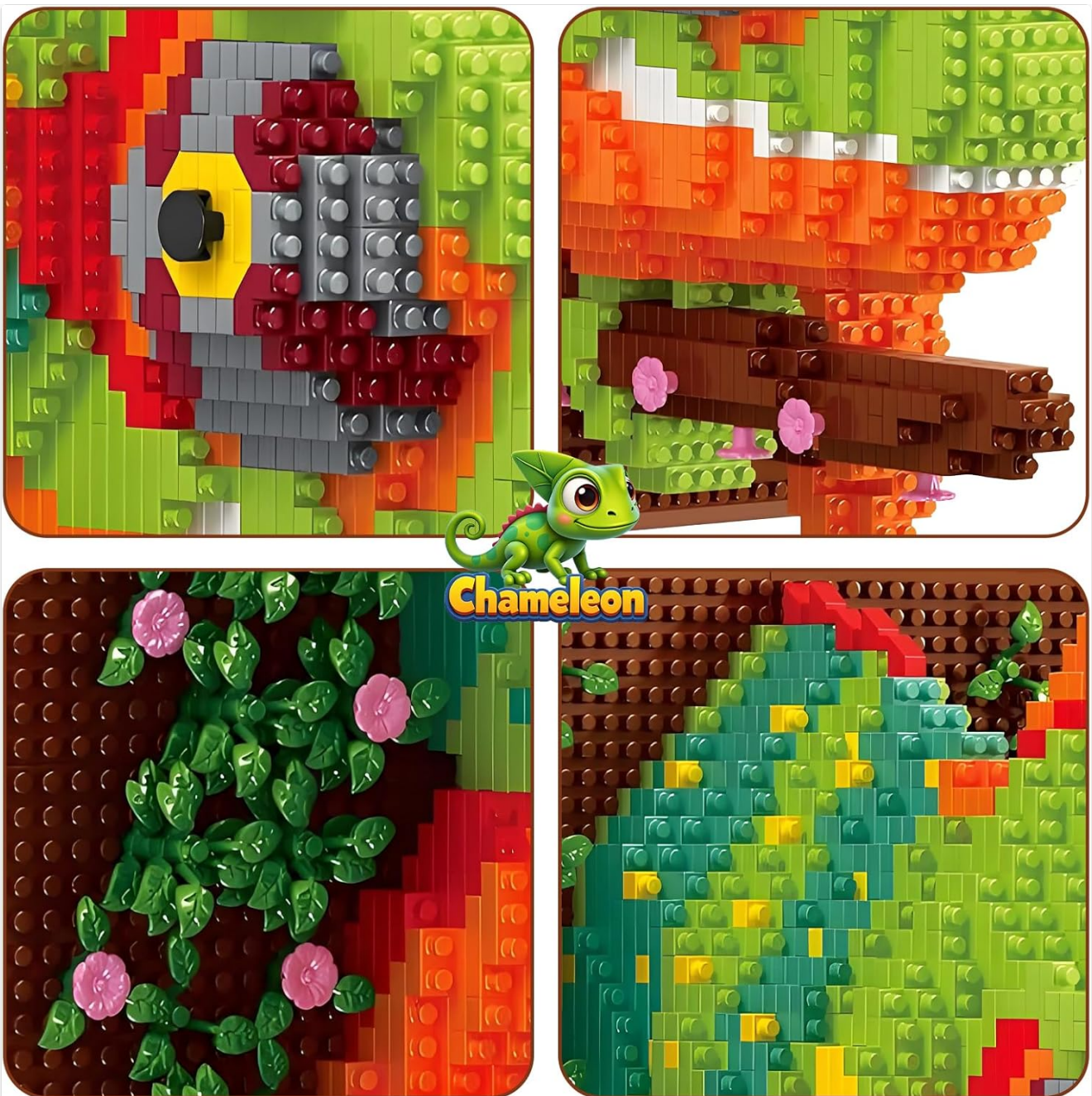
Image: Detailed close-up views of the chameleon's eye, the branch it's perched on, and the surrounding foliage, showcasing the intricate block work.