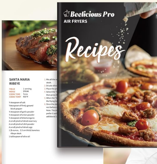
Image 5.3: The air fryer comes with a recipe book containing over 40 chef-made recipes for culinary inspiration.

Free Cookbook Included+ More Recipes Updated Online