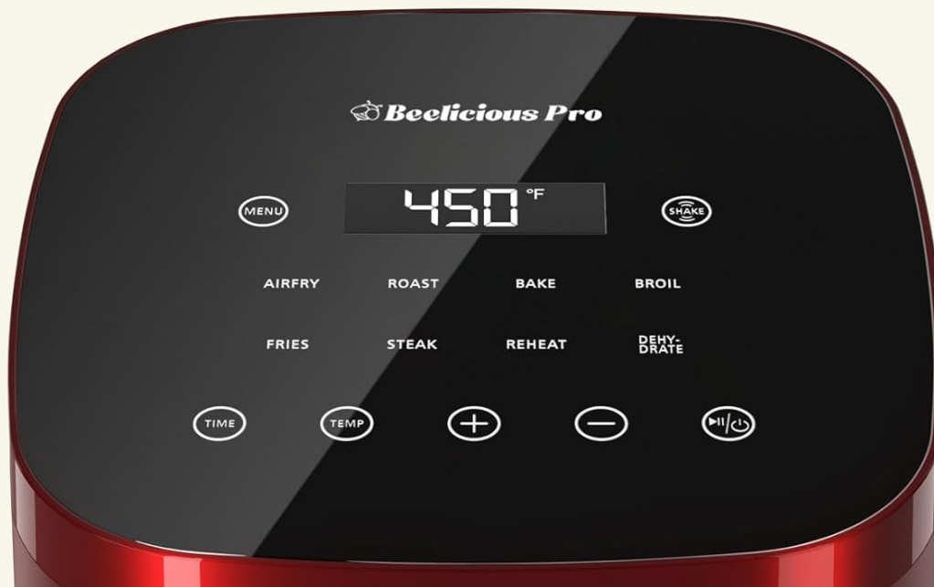
Image 3.1: The digital control panel displaying the 8 versatile cooking functions.