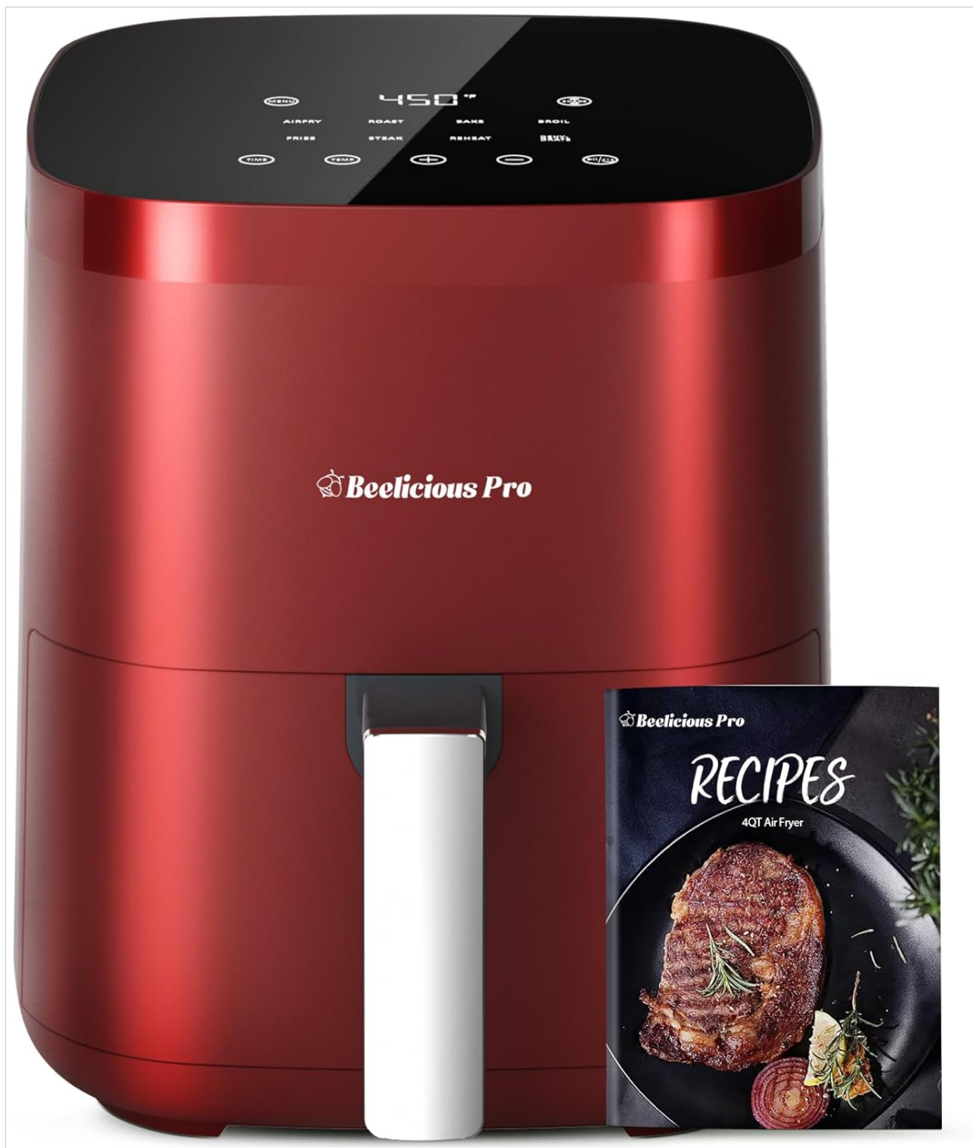
Image 1.1: The Beelicious 8-in-1 Smart Compact 4-Quart Air Fryer in red, accompanied by a recipe book.