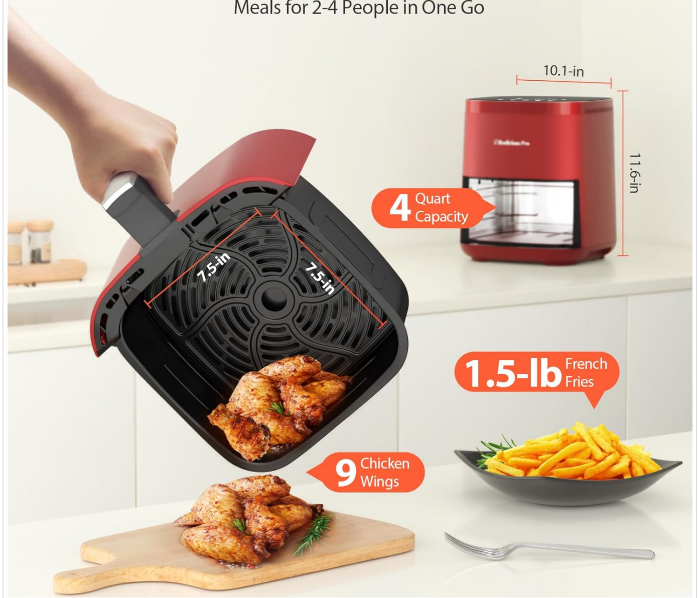
Image 3.3: Visual representation of the air fryer's compact dimensions and its 4-quart capacity, suitable for 1.5 pounds of fries or 9 chicken wings.