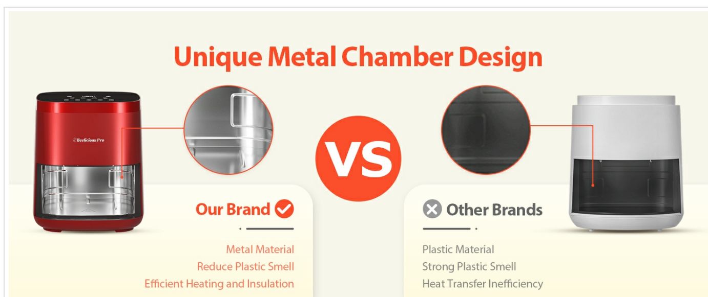
Image 3.5: The unique metal chamber design helps reduce plastic odors and improves heating efficiency compared to plastic chambers.