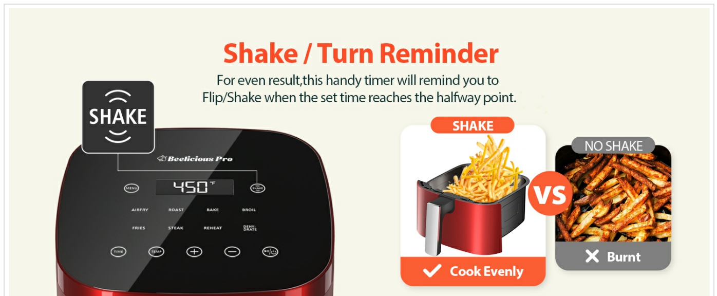
Image 5.1: The Shake/Turn Reminder ensures food is cooked evenly for optimal results.