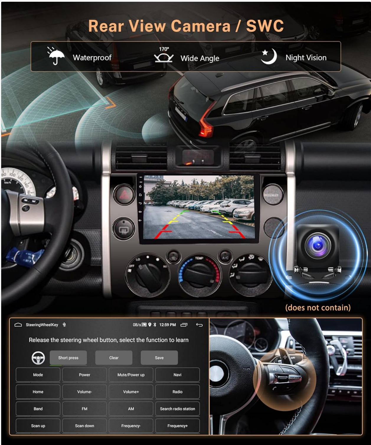
Image: The car radio screen showing the rear view camera feed with parking guidelines, and a separate interface for configuring steering wheel controls.