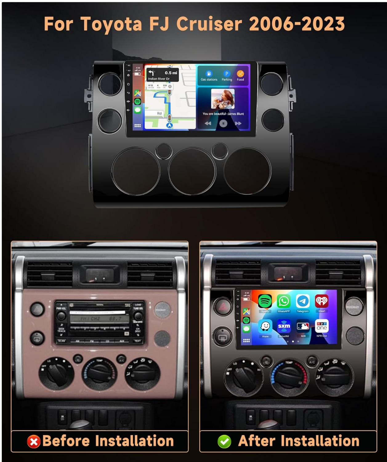
Image: Visual comparison showing the original car radio setup in a Toyota FJ Cruiser and the upgraded dashboard with the Rimoody 9-inch touchscreen unit installed.