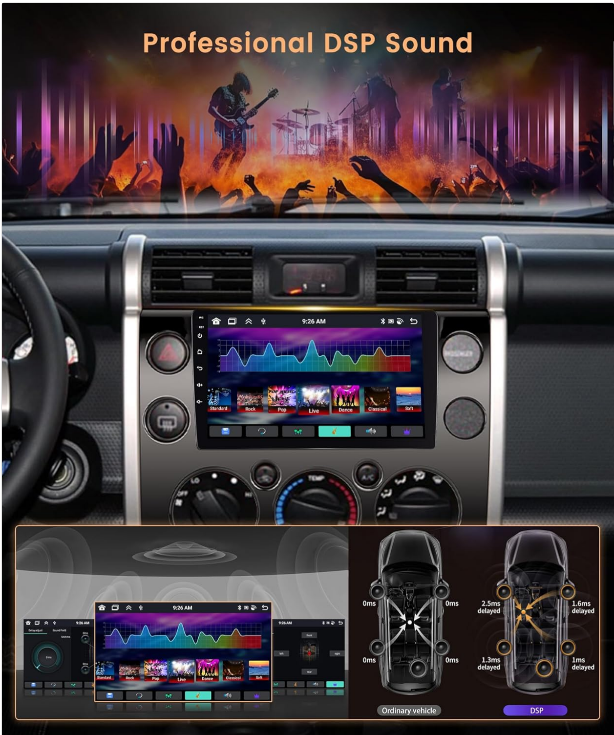
Image: The car radio screen displaying the Professional DSP Sound interface, including a graphic equalizer and options for sound field and delay adjustments.