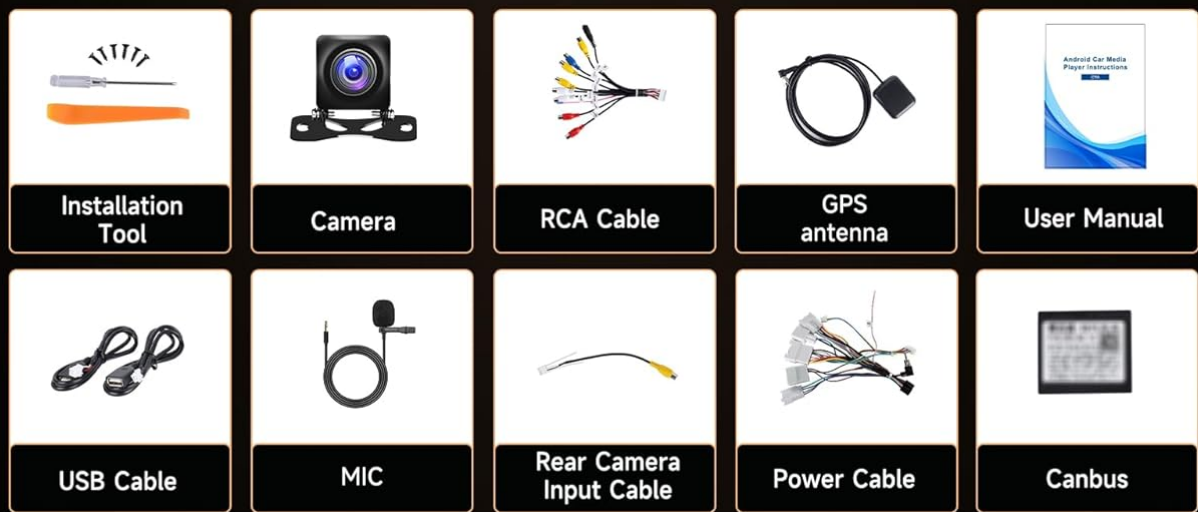
Image: Contents of the Rimoody car radio package, including the head unit, various cables, GPS antenna, microphone, backup camera, installation tools, and user manual.