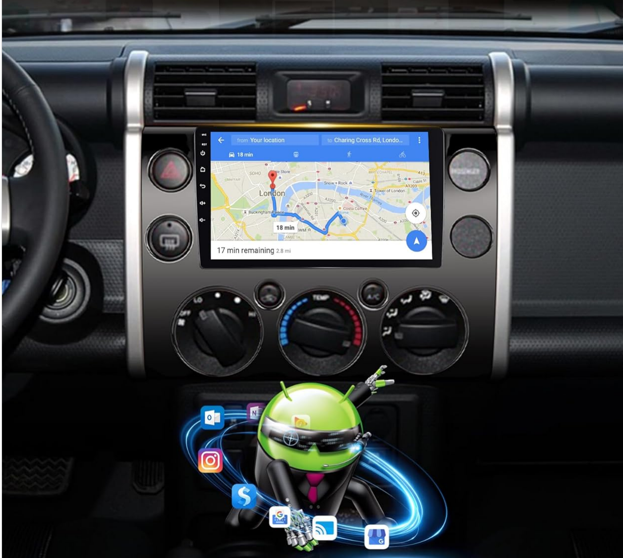
Image: The car radio screen displaying GPS navigation, highlighting the unit's 8-Core processor, 6GB RAM, and 128GB ROM.