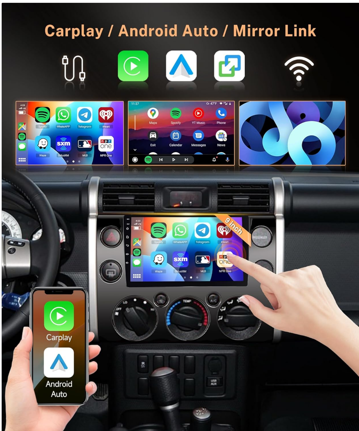
Image: The car radio screen illustrating the options for Wireless CarPlay, Wireless Android Auto, and Mirror Link, with a smartphone demonstrating the connection.