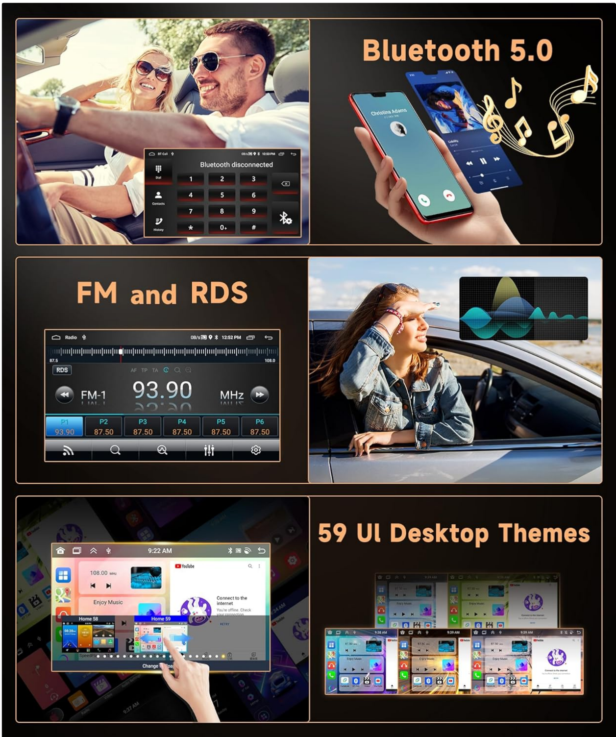
Image: Multiple displays illustrating Bluetooth connectivity for phone calls and music playback, the FM radio interface, and examples of the 59 available UI desktop themes.