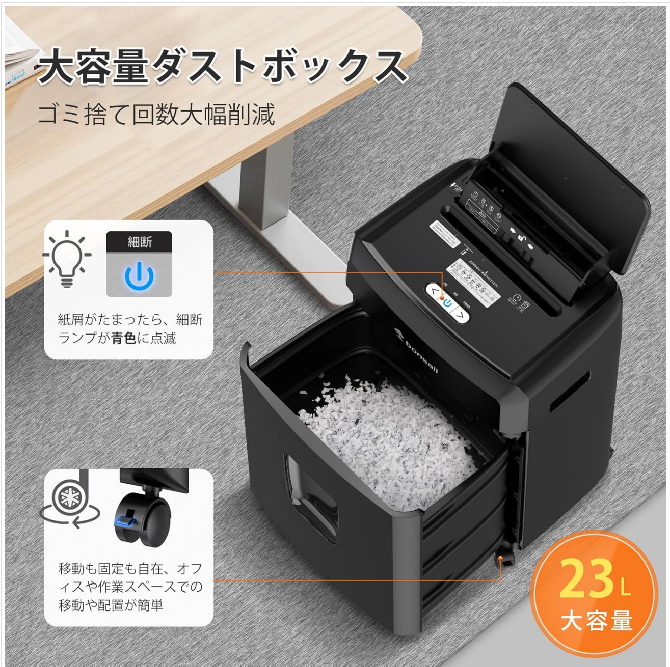
Figure 5.1: The transparent window allows for easy monitoring of the shredded paper level, indicating when the 23L bin needs to be emptied.