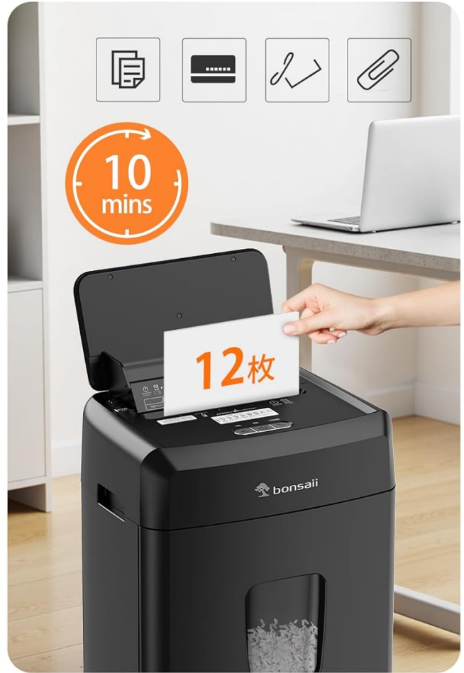
Figure 4.3: The shredder supports both automatic feeding of up to 150 sheets and manual feeding of up to 12 sheets, including credit cards.