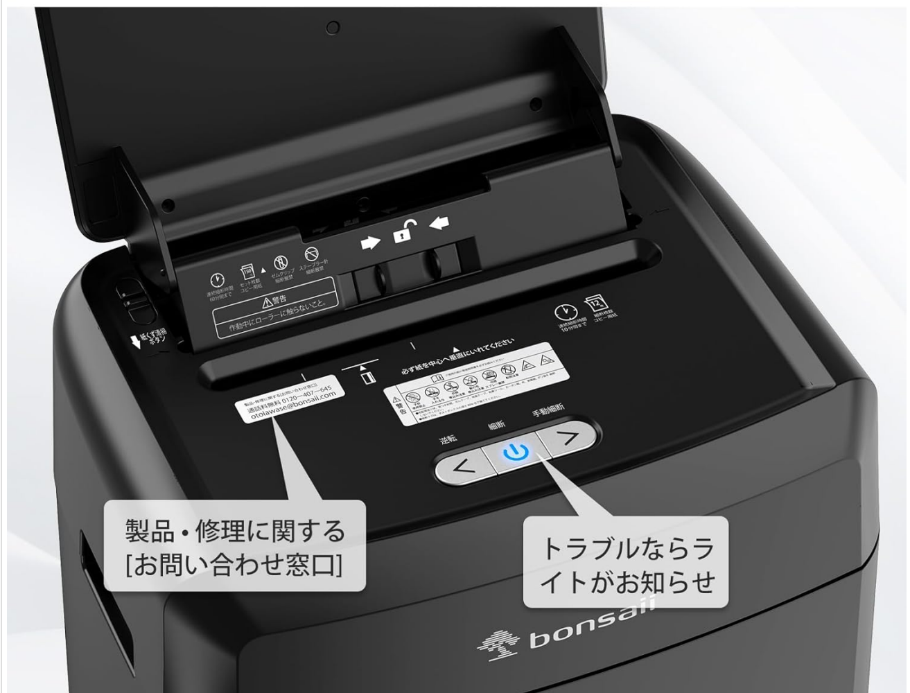
Figure 4.1: The intuitive control panel with power button and indicators for shredder status.