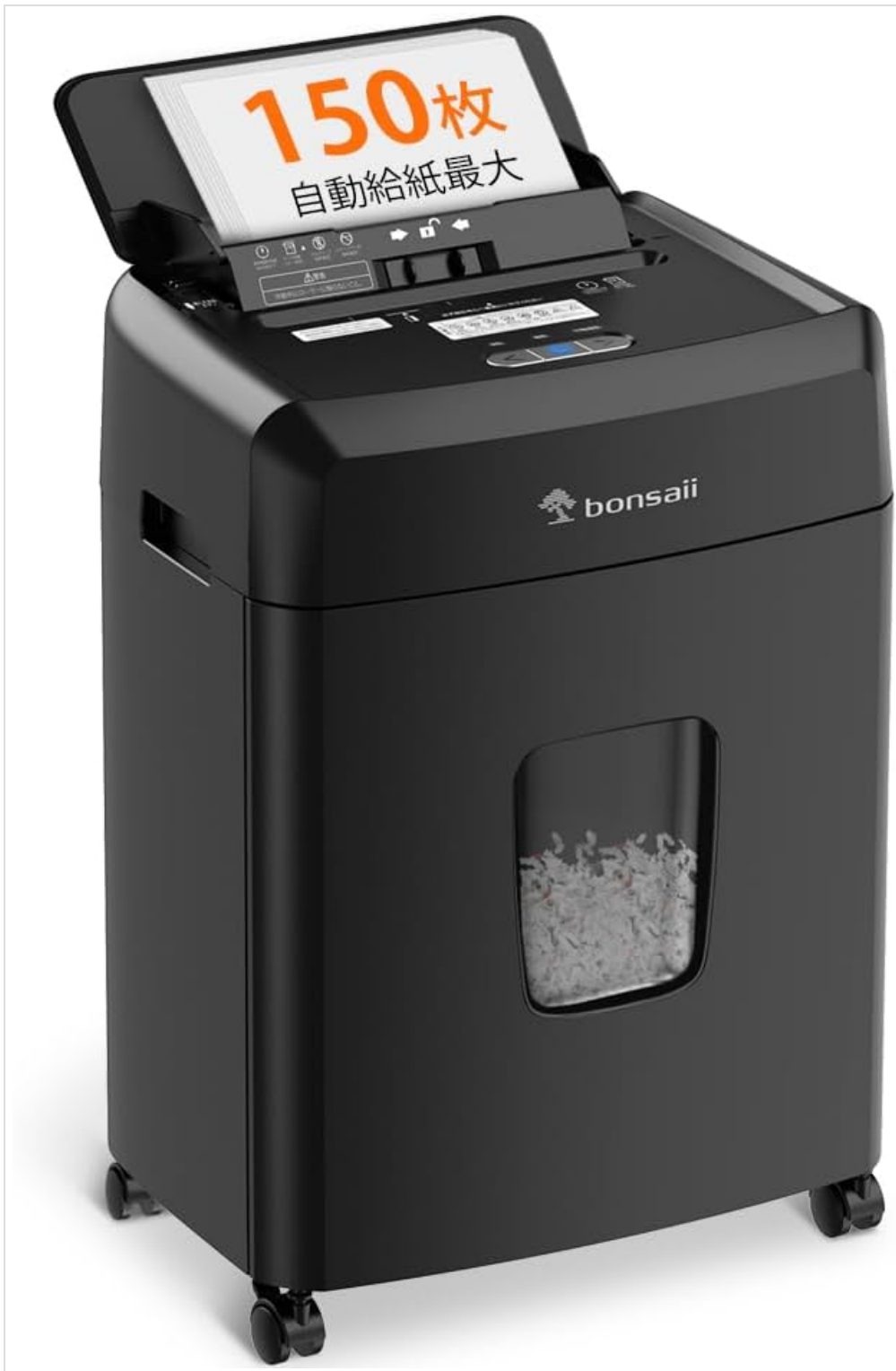
Figure 2.1: Front view of the bonsai C290-A Auto-Feed Micro-Cut Shredder, showing the auto-feed tray and waste bin window.