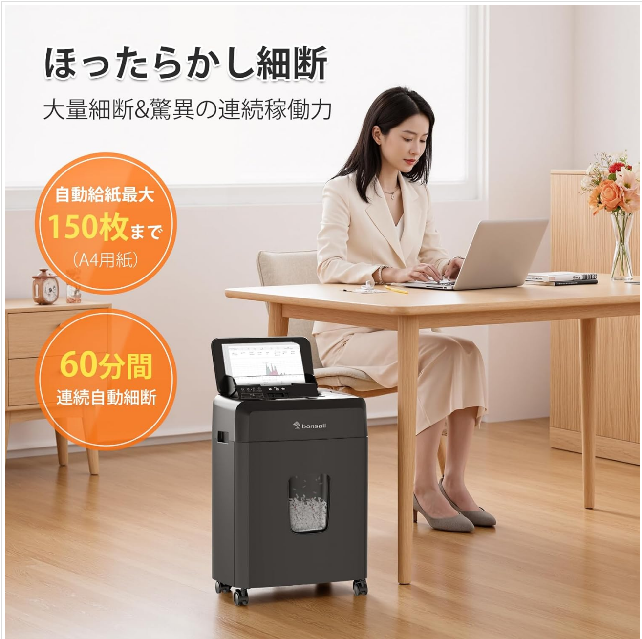
Figure 4.2: The auto-feed feature allows for hands-free shredding of large document stacks, enabling continuous operation for up to 60 minutes.