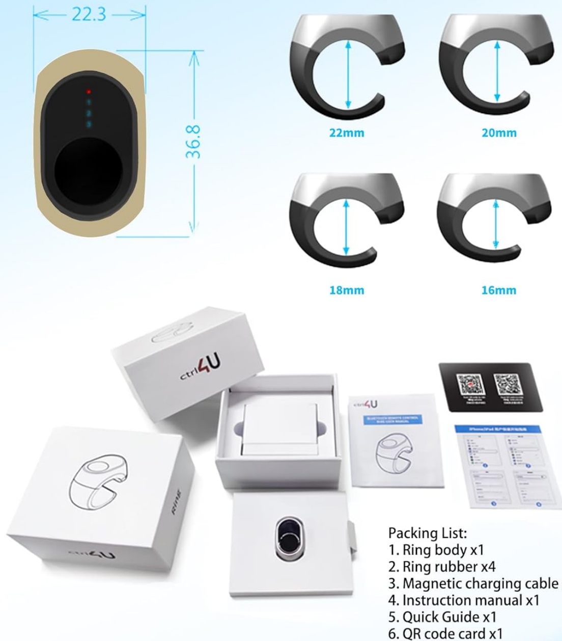
Figure 1: The main ring body and the four included silicone ring sizes for customizable fit.