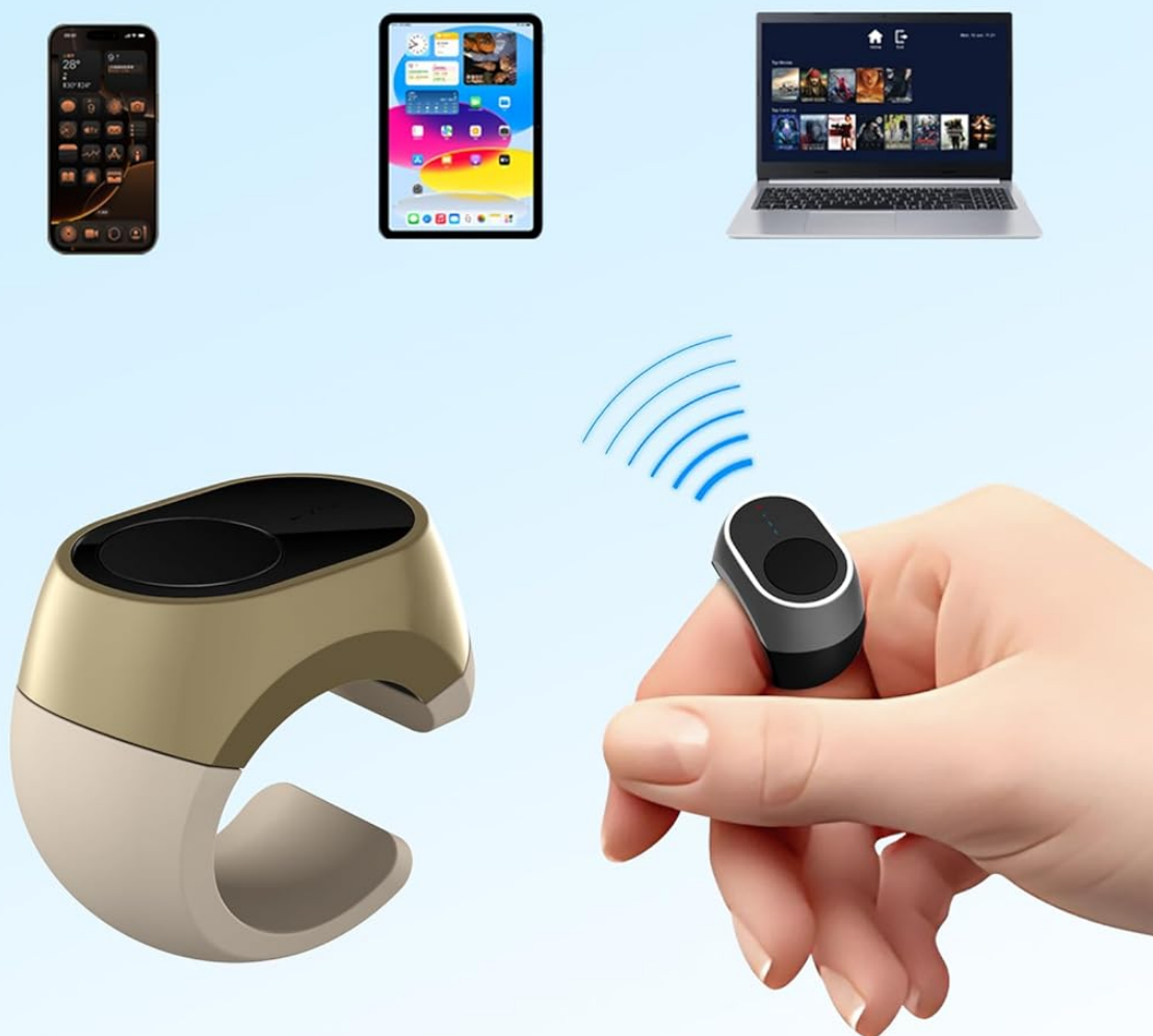
Figure 5: The ring's capability to connect to multiple devices simultaneously.

Connects to mobile phone, pad, laptop, BT mouse/VR/AR/TV