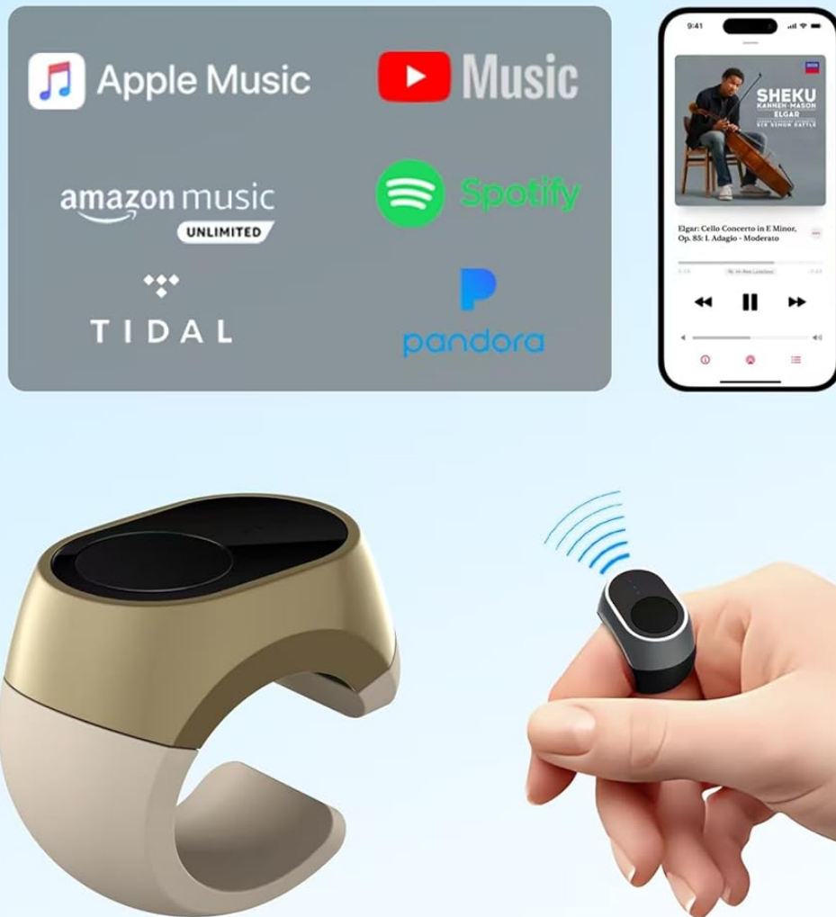
Figure 2: Attaching the silicone ring to the main device for comfortable wear.

Support various popular music playback APPs, video APPs, Kindle Apps