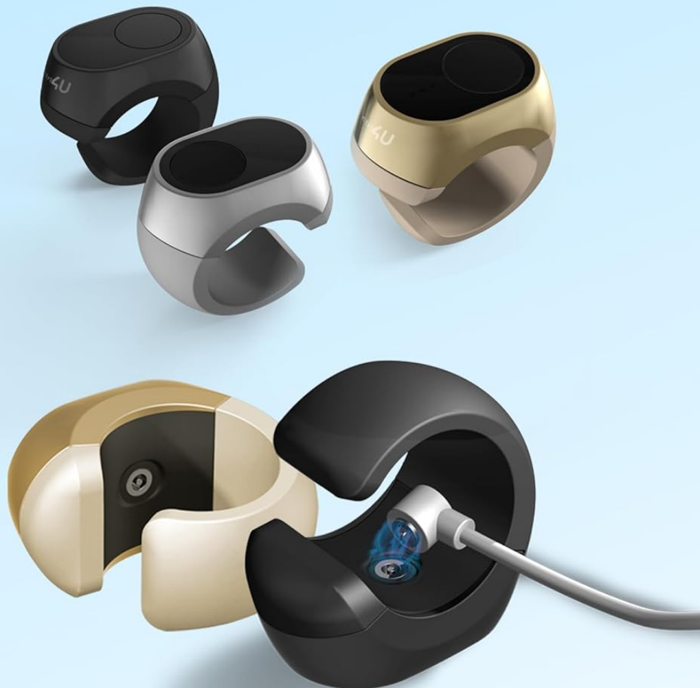
Figure 3: Magnetic charging setup for the control ring.

Continuous standby time when fully charged >1 month