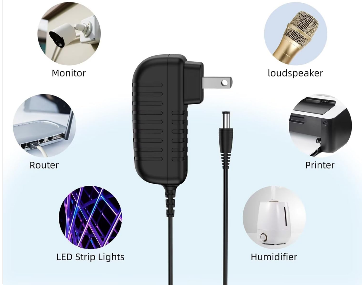
Image 5: The AC adapter demonstrating its wide application and compatibility with various electronic products.

Compatible with a variety of electronic products