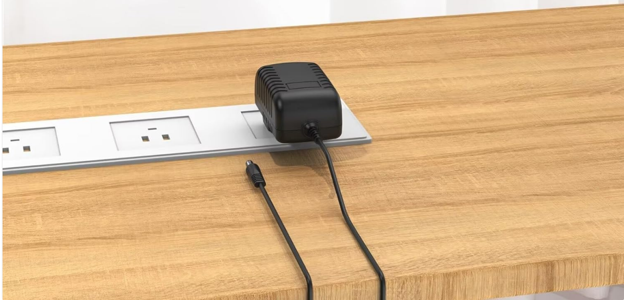
Image 1: The MDCGPower AC Adapter Charger, showing its compact design and barrel connector.