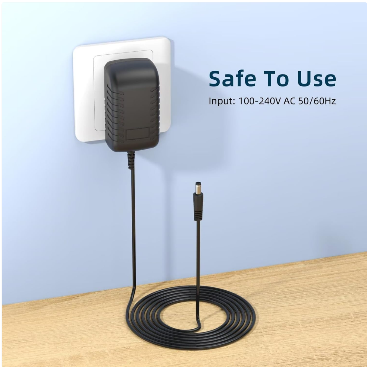
Image 3: The AC adapter plugged into a wall outlet, demonstrating its input voltage compatibility.