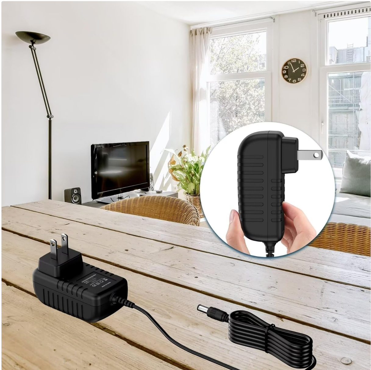
Image 4: The AC adapter in a typical room environment, highlighting its discreet and functional presence.