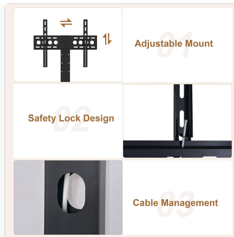
Image Description: An illustration detailing the adjustable TV mount, its safety lock design, and integrated cable management features for a tidy setup.