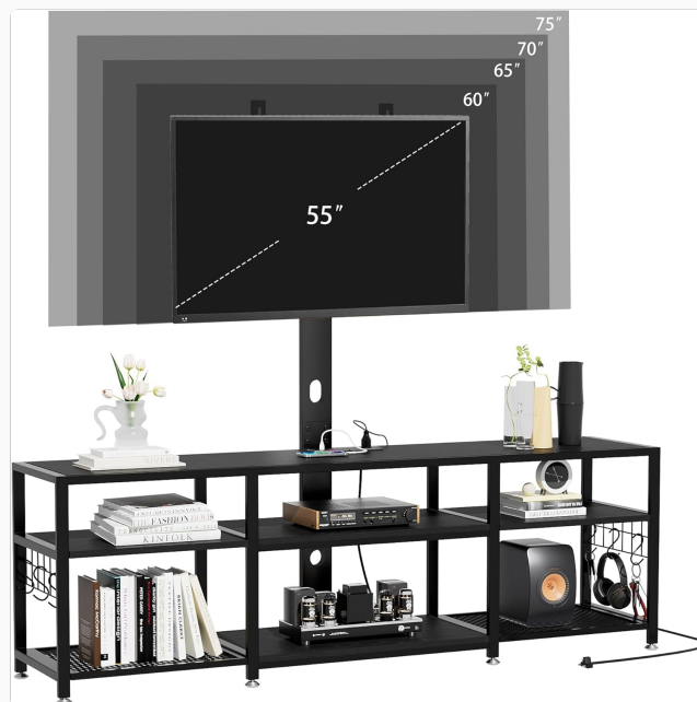
Image Description: The VECELO TV stand with a television mounted, illustrating its compatibility with various TV sizes from 55 to 75 inches. The stand also features multiple shelves for media devices.