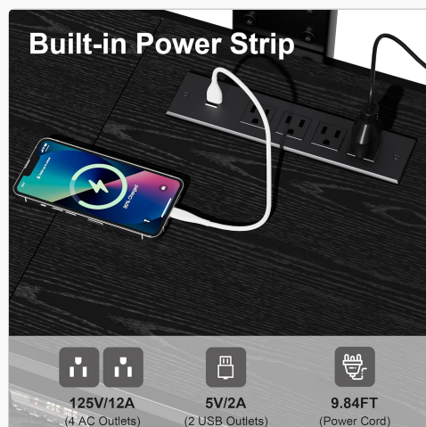
Image Description: A detailed view of the built-in power strip, showing 4 AC outlets and 2 USB outlets, along with its 9.84 ft power cord. This feature provides convenient charging for devices.