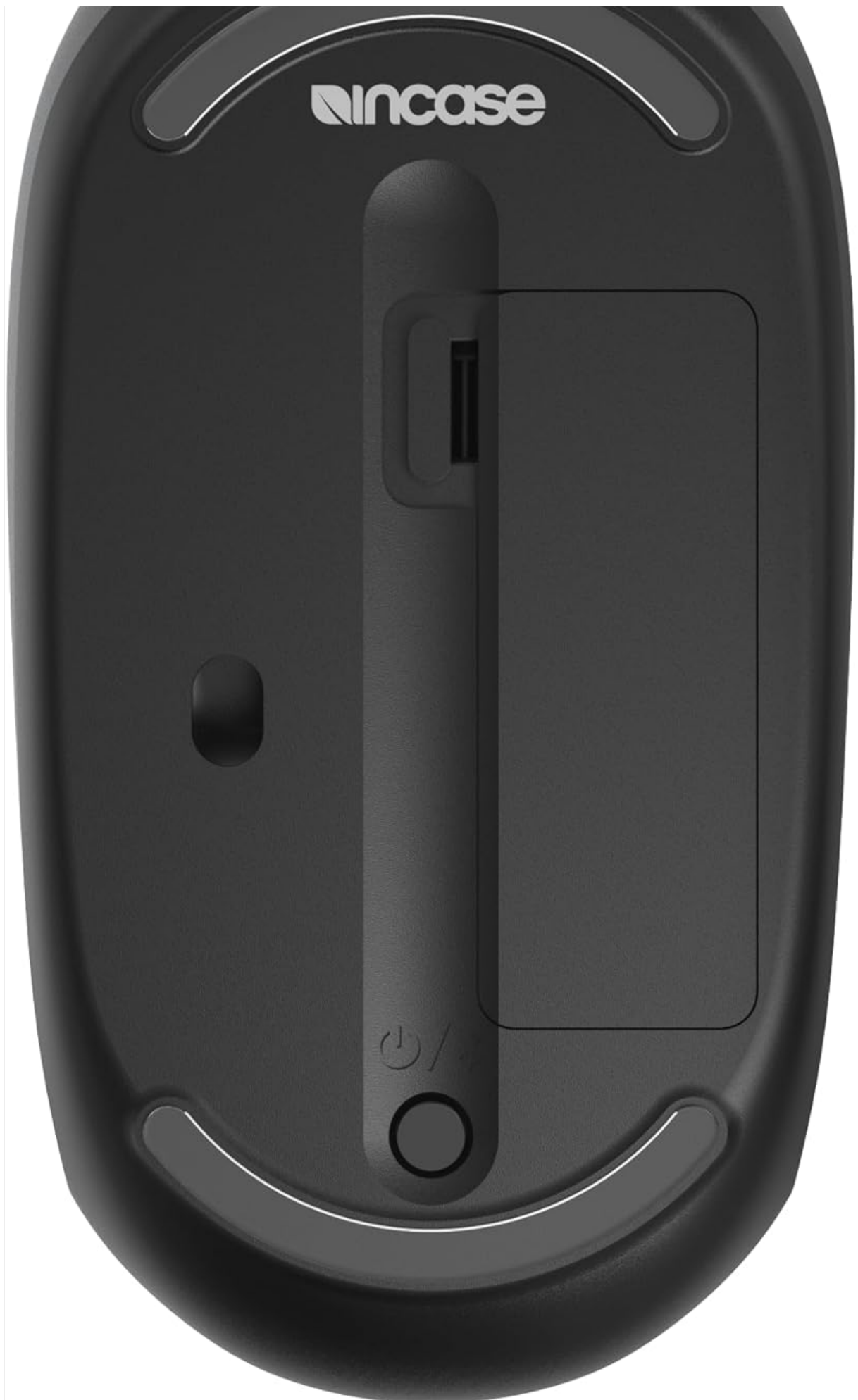
The underside of the mouse, revealing the battery compartment and the power/pairing button. The protective pull tab for the pre-installed AA battery is also visible.