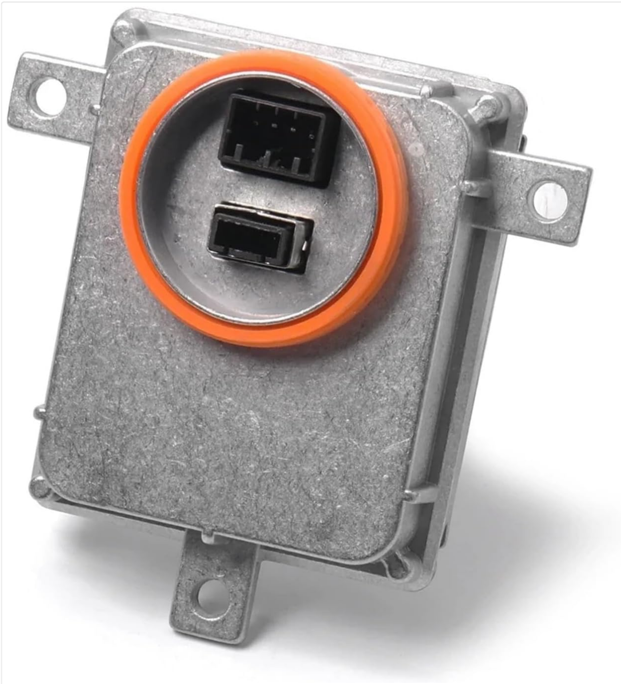
Figure 1.1: Top view of the WBFYEE Xenon HID Ballast, showing the main housing and electrical connection ports.