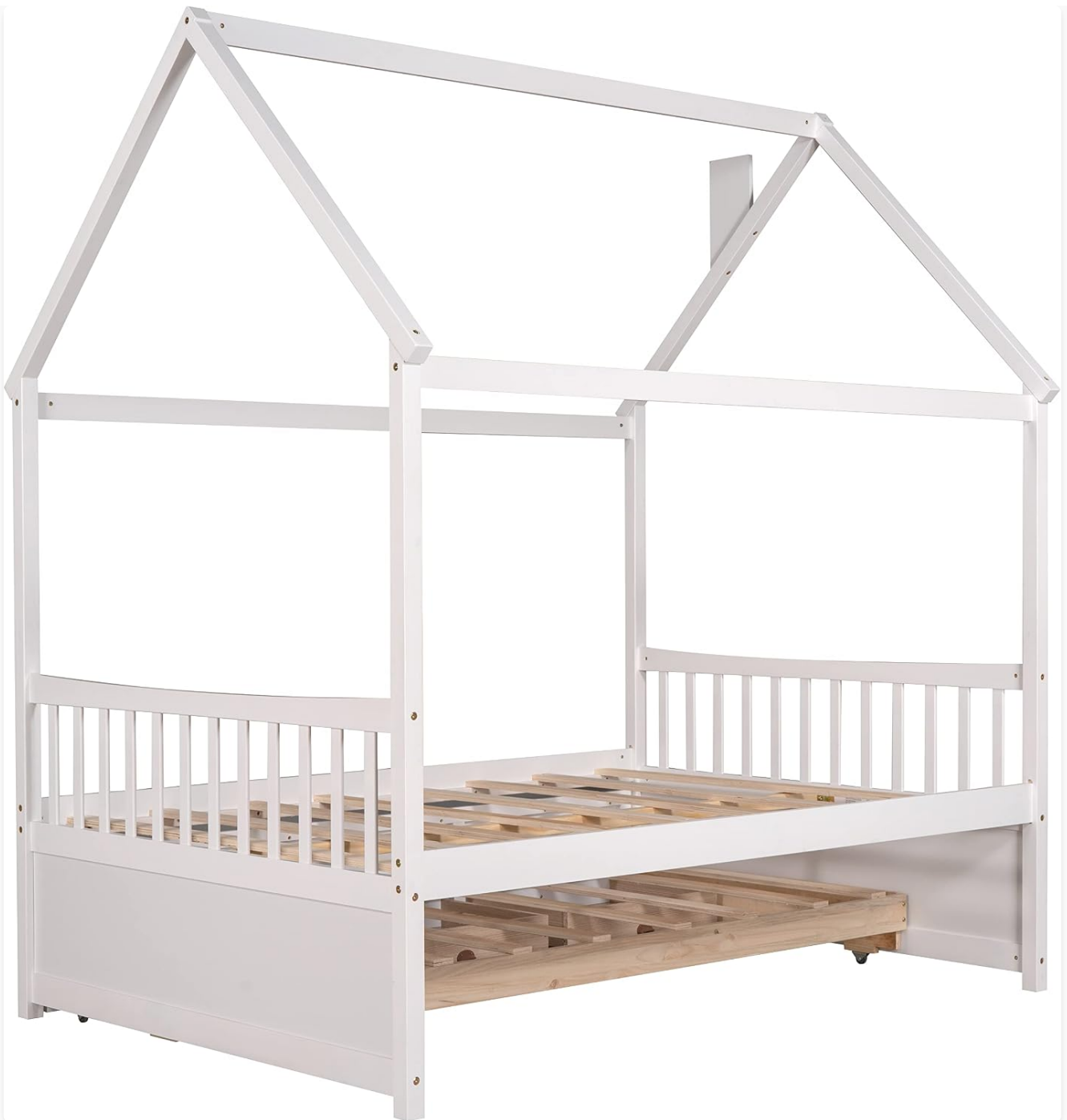
Image 4.2: Side view illustrating the trundle bed's position beneath the main frame.