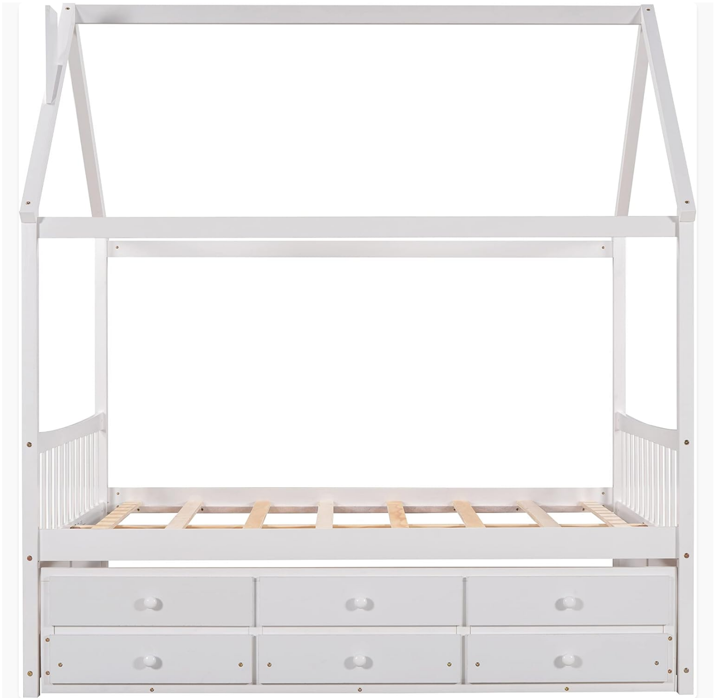
Image 4.1: View of the bed frame structure with slats and trundle mechanism.