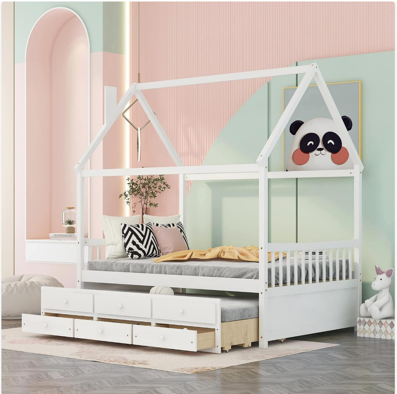
Image 1.1: Fully assembled Full House Bed with Twin Size Trundle and Drawers.