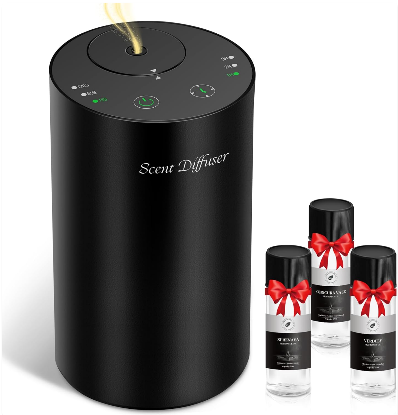
Image: The EvCZen Waterless Essential Oil Diffuser in black, shown with three accompanying essential oil bottles, highlighting its sleek design and included accessories.