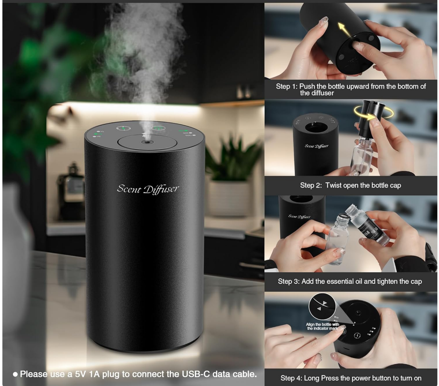
Image: A step-by-step visual guide demonstrating how to set up the diffuser, including removing the bottle, twisting the cap, adding oil, and powering on the device.