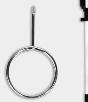
Atomizer core and seal