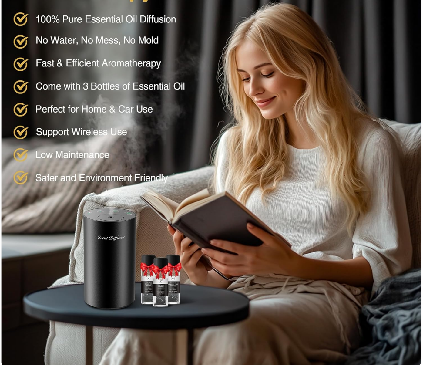
Image: A woman relaxing and reading a book with the EvCZen diffuser on a side table, illustrating the product's benefits for creating a pure, powerful, and hassle-free aromatherapy experience.