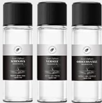
20ML Essential oil*3