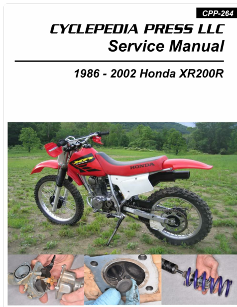
Figure 1: Front cover of the service manual, displaying the title and motorcycle model years covered.