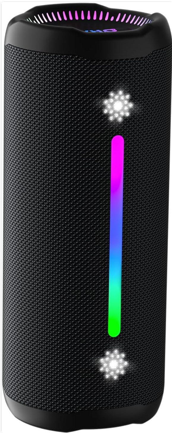
The OHAYO X10 MAX Bluetooth Speaker, showcasing its sleek design and integrated colorful lighting.