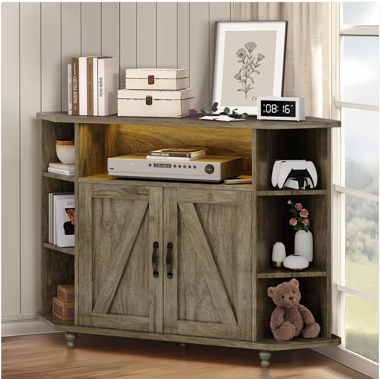
Figure 4.1: Overall view of the entertainment center, showcasing its corner design and storage capabilities.

Familiarize yourself with the key features and components of your new entertainment center.