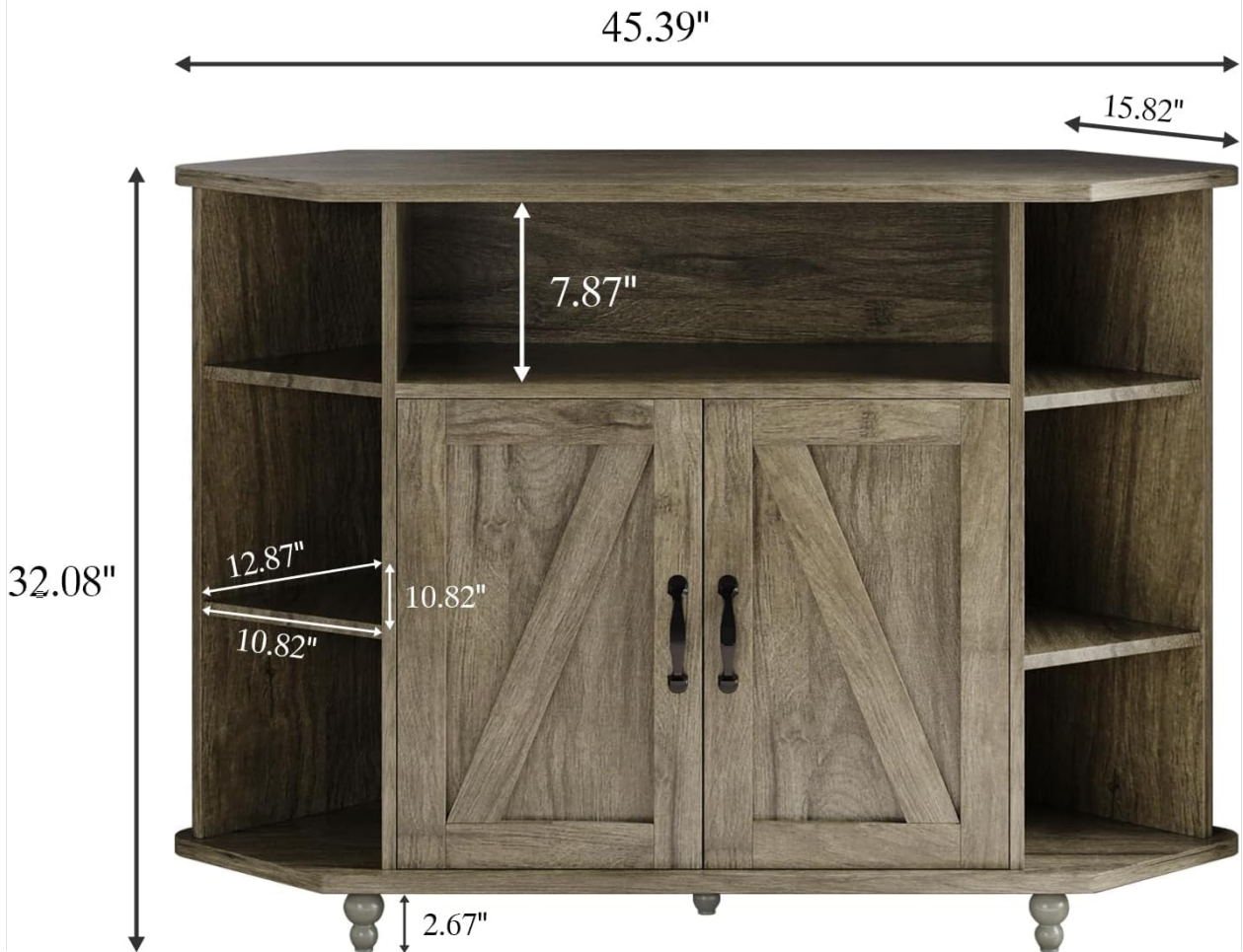
Figure 4.2: Detailed product dimensions, indicating the overall size and internal shelf measurements.