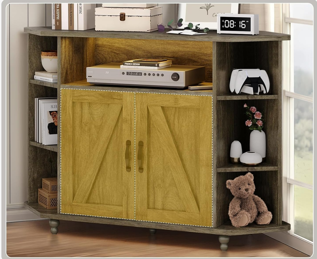
Figure 4.5: The distinctive farmhouse barn doors, which slide to conceal or reveal the central storage compartment.