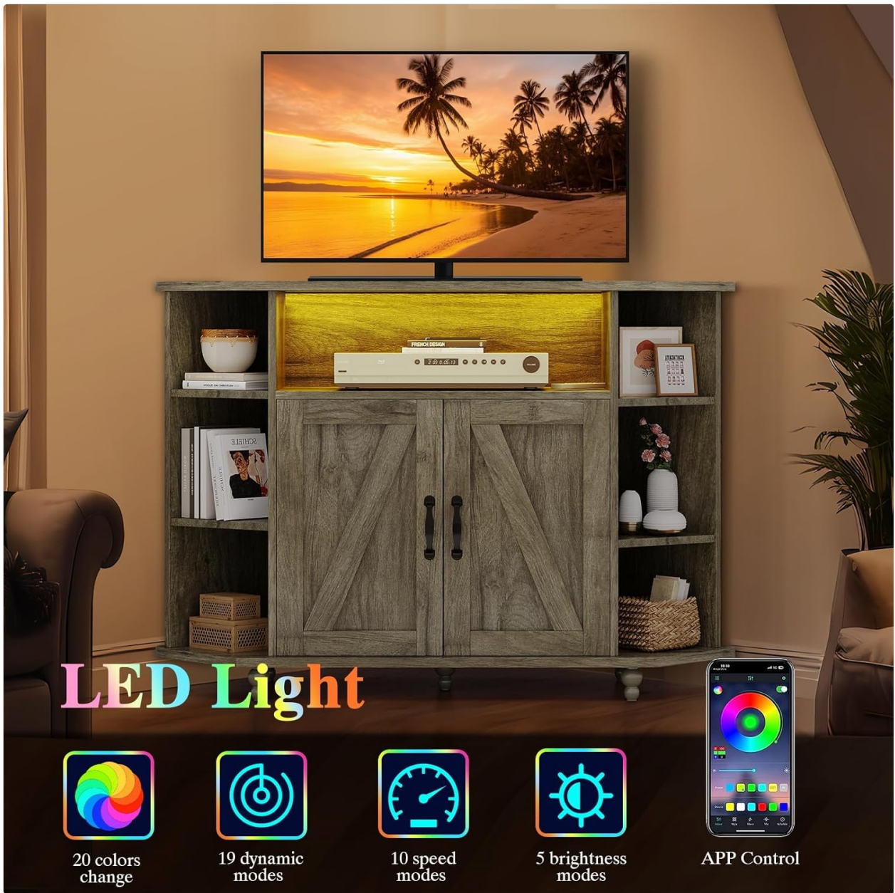
Figure 4.3: The integrated LED lighting system, offering customizable colors, modes, speed, and brightness, controllable via remote or smartphone app.