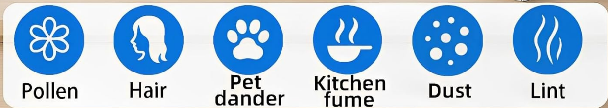
Figure 5: HEPA filter effectiveness against various particles.