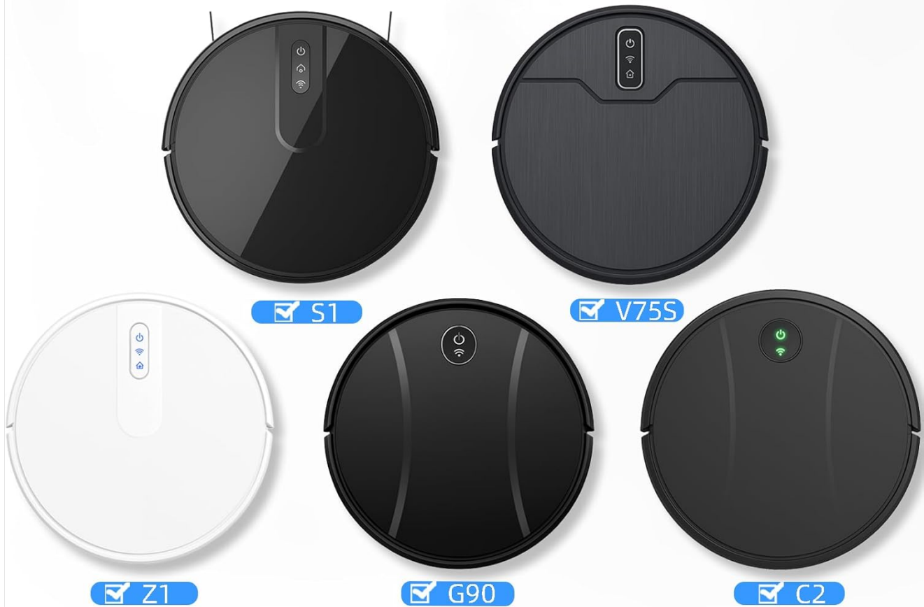
Figure 1: Visual representation of compatible robot vacuum models.