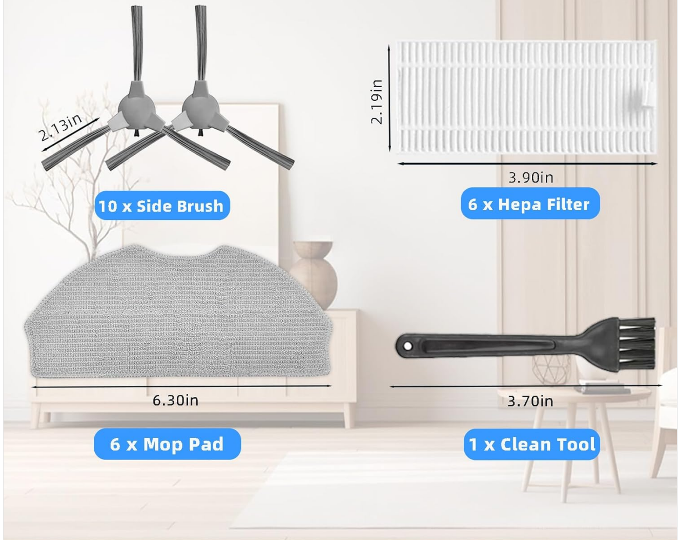
Figure 3: Detailed view of package contents with approximate dimensions.