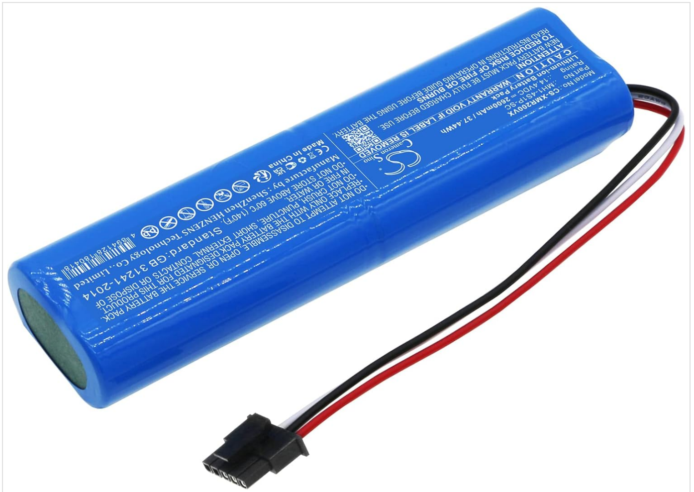
Image: The TrustCell MH1-4S1P-SC replacement battery, showing its blue casing and connector cable.