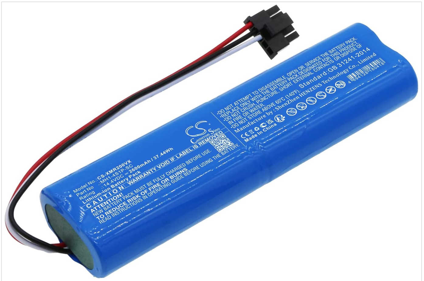
Image: The TrustCell MH1-4S1P-SC replacement battery, displaying its product label with model and part numbers.