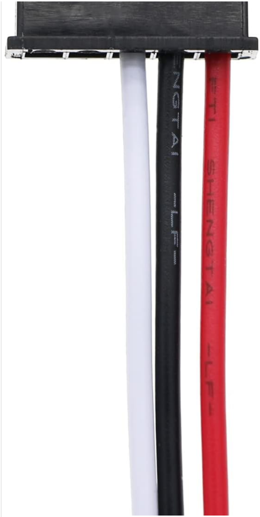
Image: A close-up view of the battery's connector, showing the pin configuration.