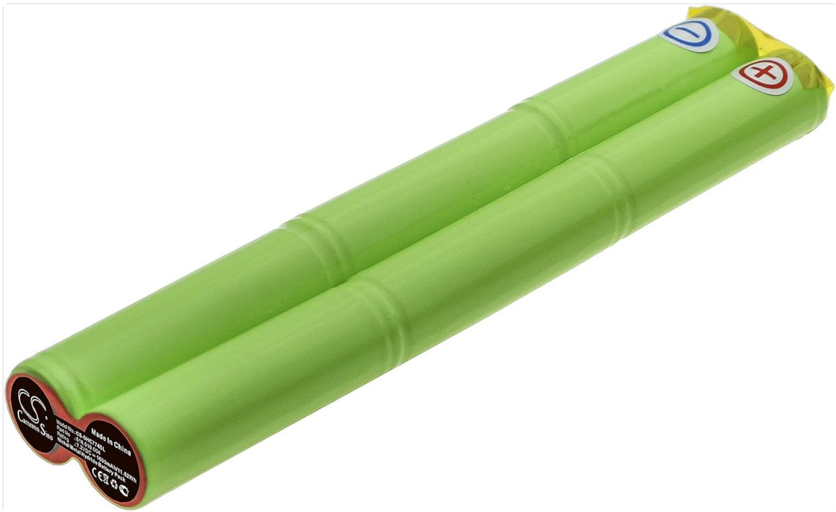
Image showing the TrustCell replacement battery with clear markings for positive (+) and negative (-) terminals on the ends.