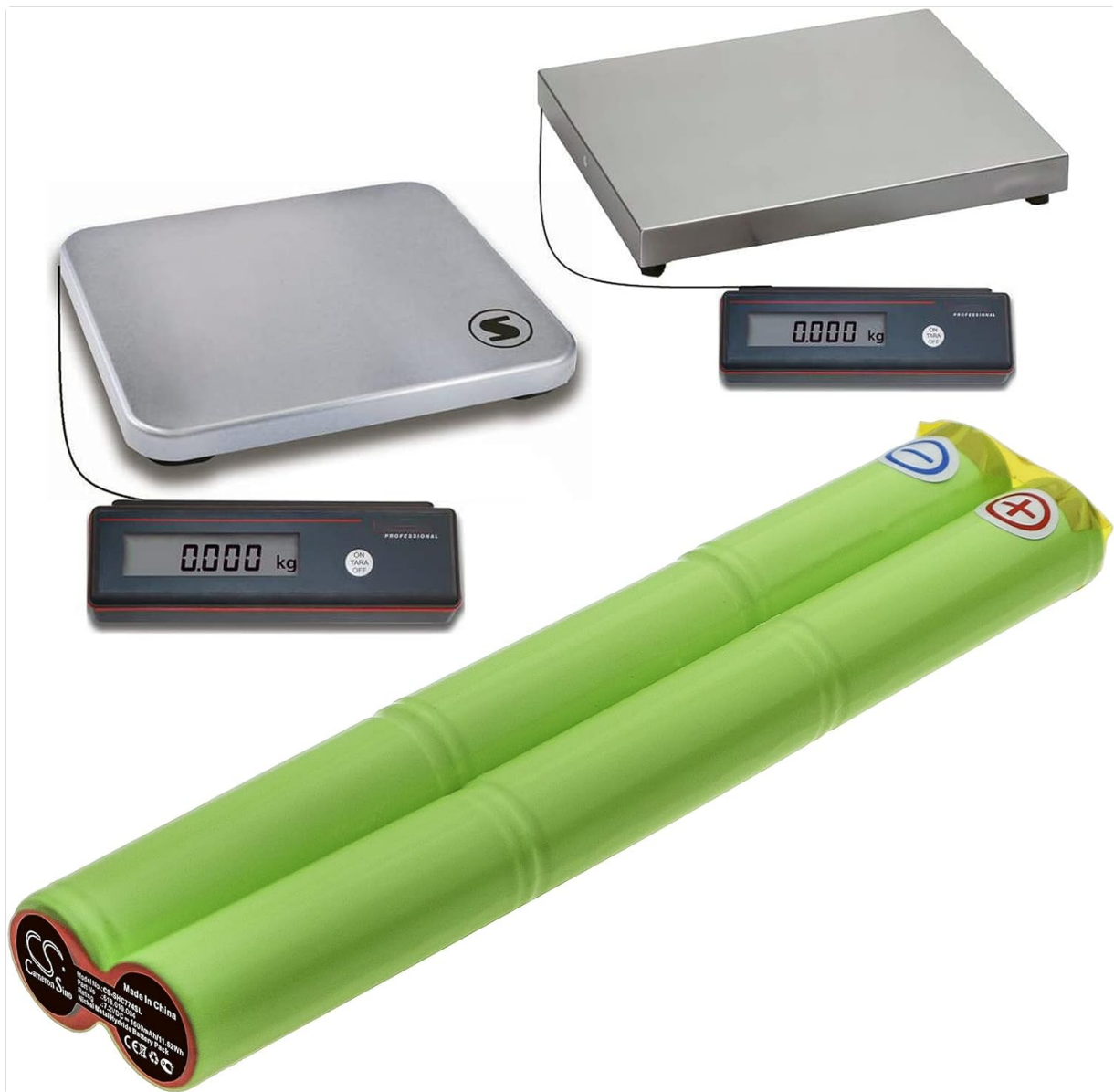
Image depicting the TrustCell replacement battery alongside two different Soehnle scales, illustrating its intended use.