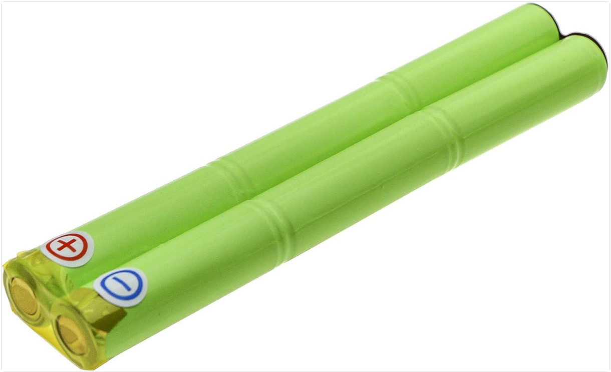
Image showing the TrustCell 618.010.004 Ni-MH replacement battery, a green cylindrical battery pack with positive and negative terminals visible.