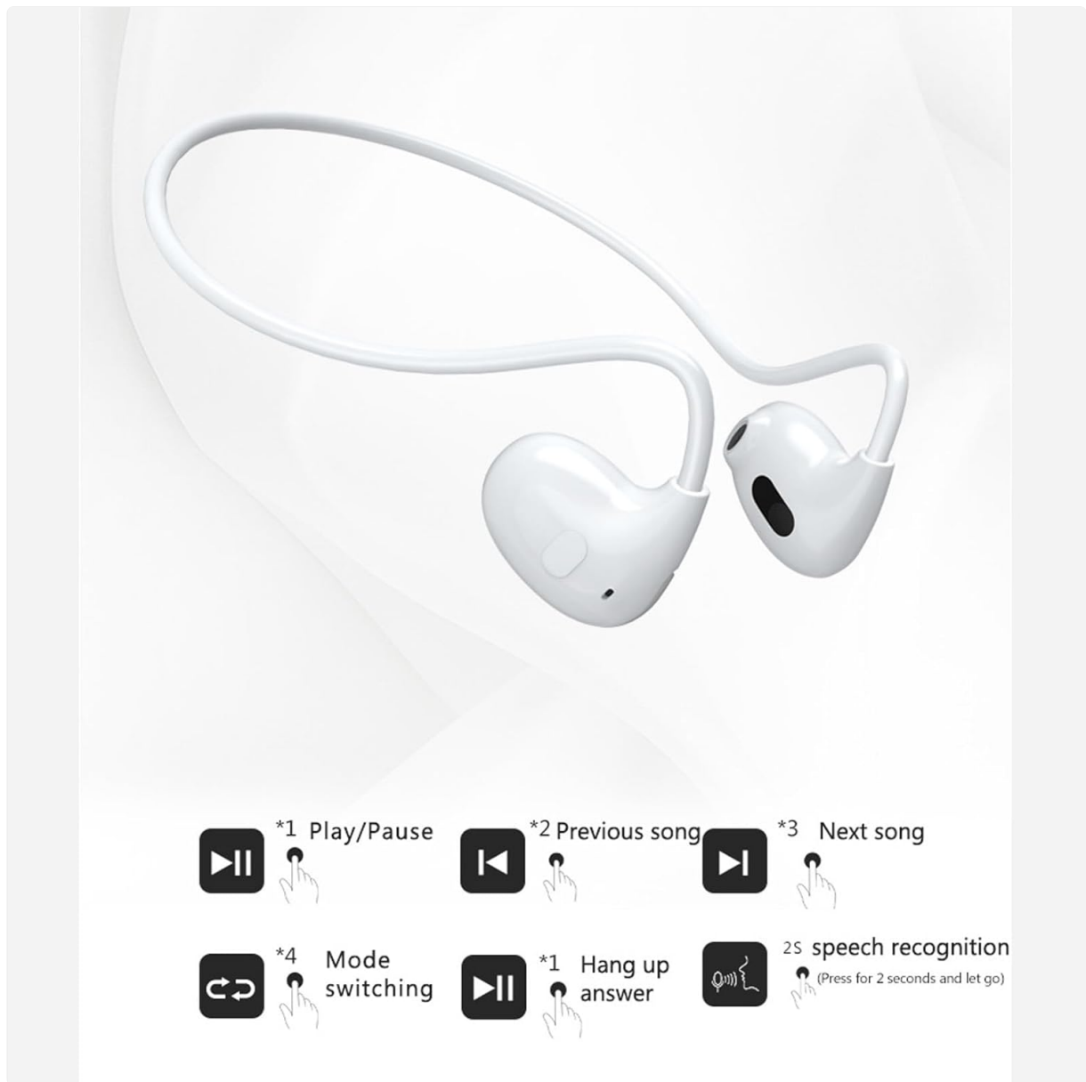
Image: The headset shown with text descriptions of its control functions: Play/Pause, Previous song, Following song, Mode switching, Hanging up answer, and Speech recognition (Press for 2 seconds and let go).