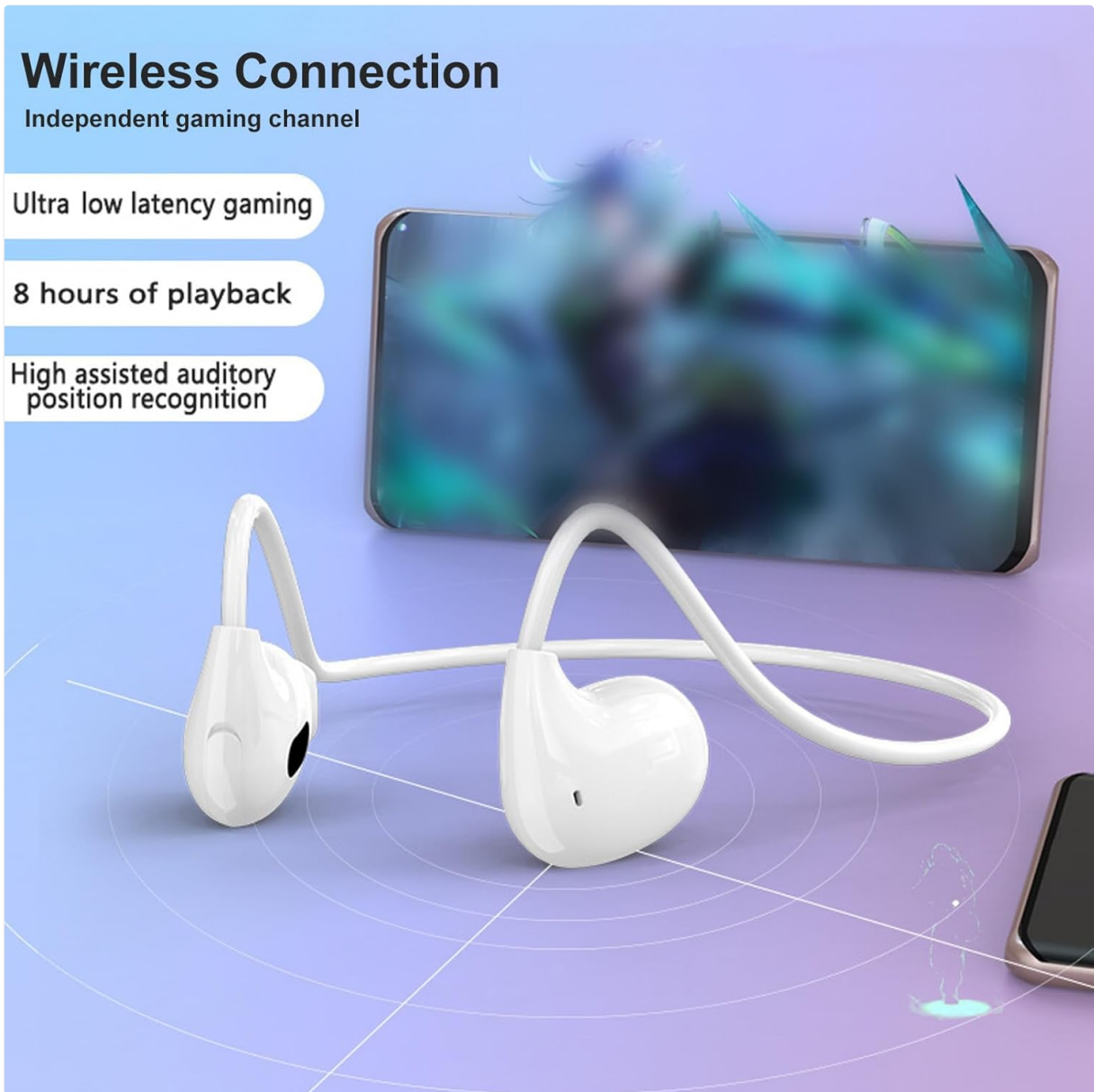
Image: The ZJchao Air Conduction Headset shown wirelessly connected to a smartphone, illustrating its independent gaming channel, ultra-low latency gaming, 8 hours of playback, and high assisted auditory position recognition features.

High assisted auditory position recognition