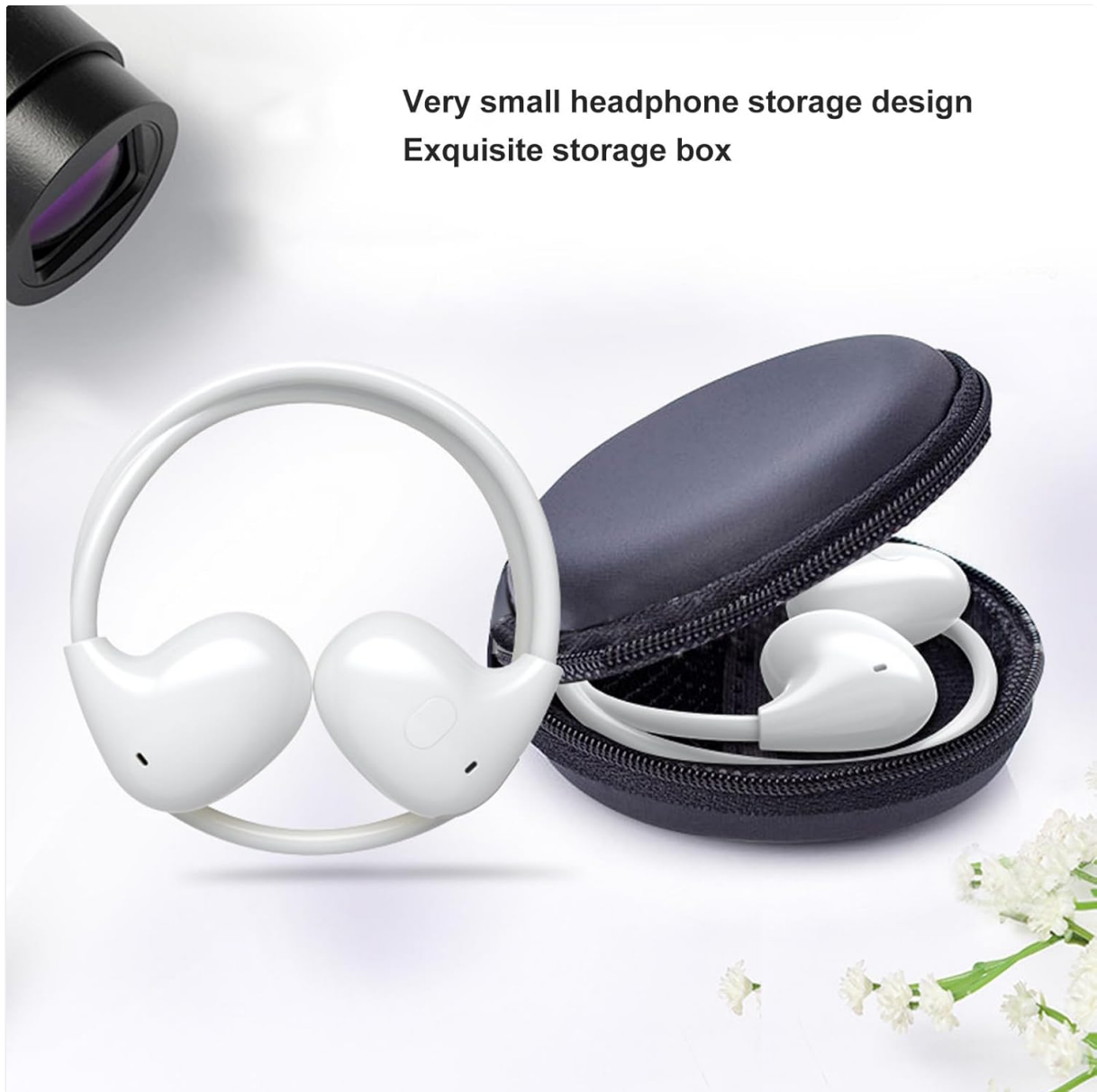
Image: The ZJchao Air Conduction Headset neatly stored in its compact, exquisite storage box, emphasizing its portability and protection.