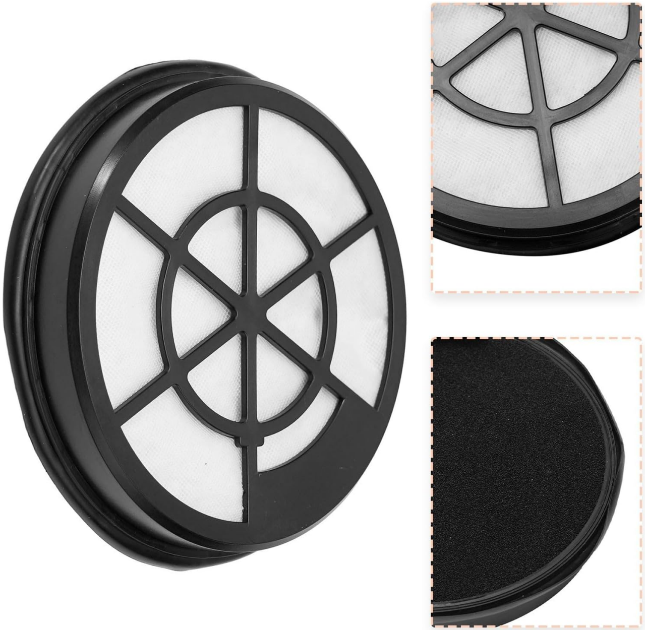
Figure 4: A composite image displaying the filter from a side angle, along with magnified views of the white filter mesh and the black foam backing.