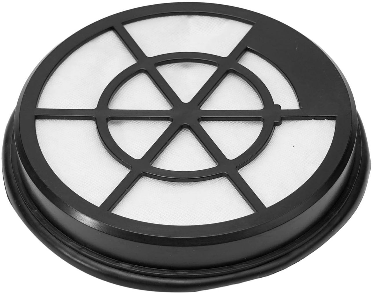
Figure 5: An angled view of the filter, showcasing its circular form and the structured black frame over the white filter material.