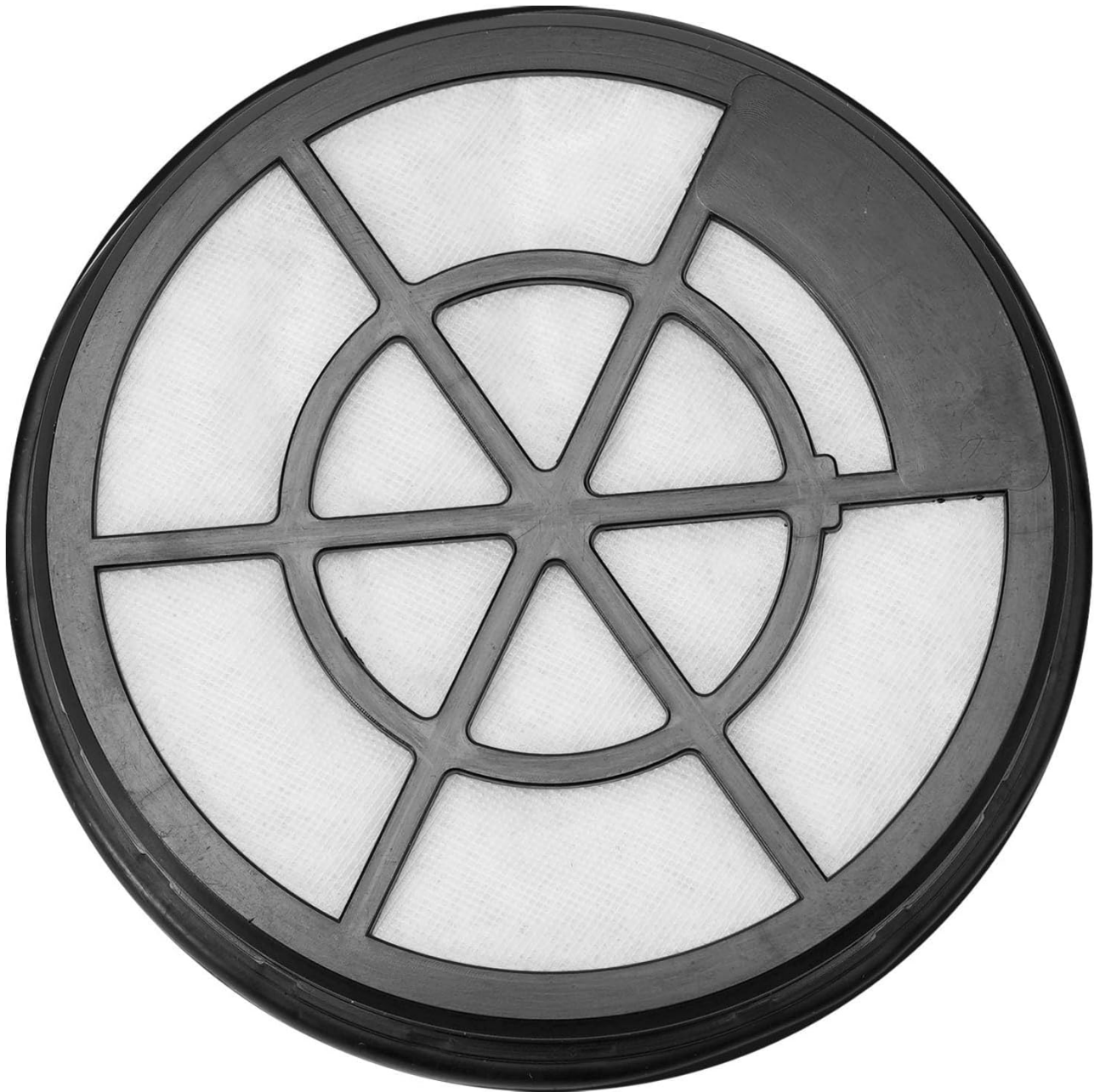
Figure 2: Top-down perspective of the filter, highlighting the circular design and the textured black plastic frame over the white filter material.