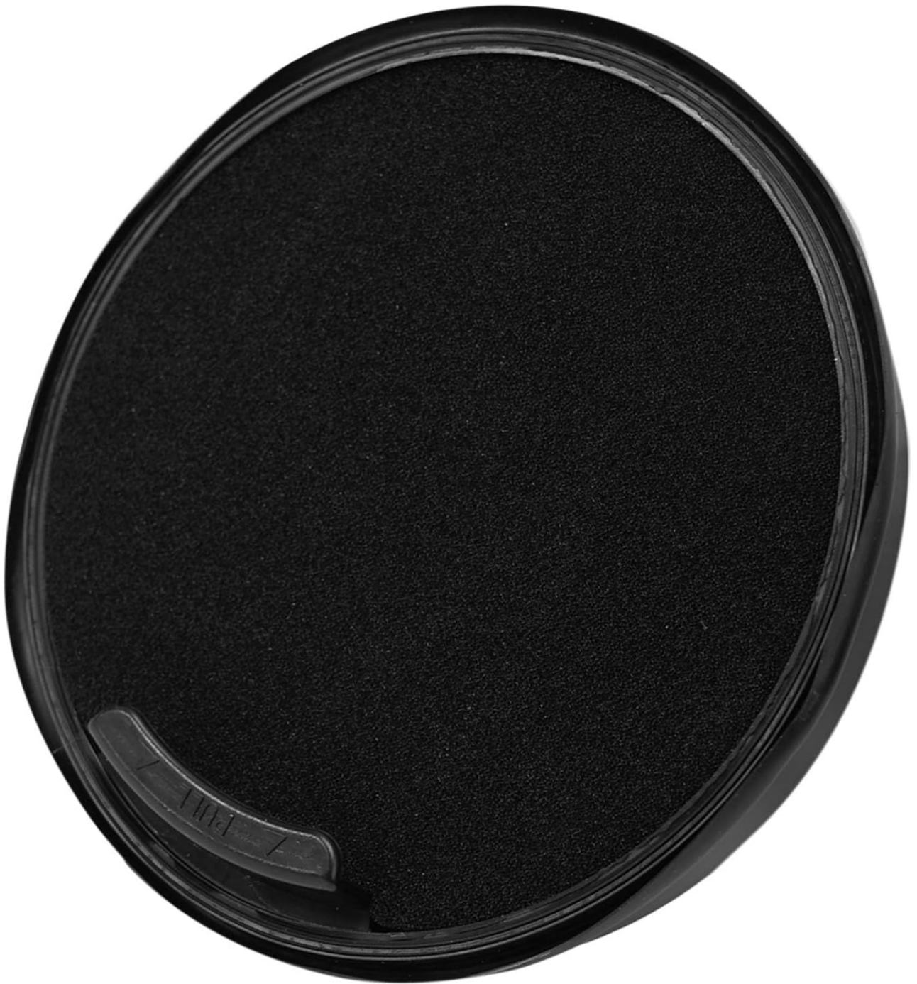
Figure 6: The underside of the filter, revealing the solid black foam layer that provides sealing and additional filtration.