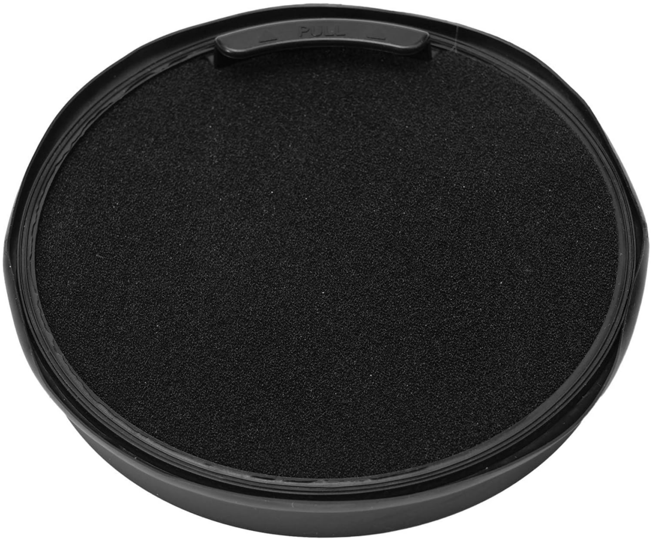
Figure 7: A slightly different angle of the filter's bottom, clearly showing the black foam backing and a small tab labeled "PULL" for easy removal or installation.