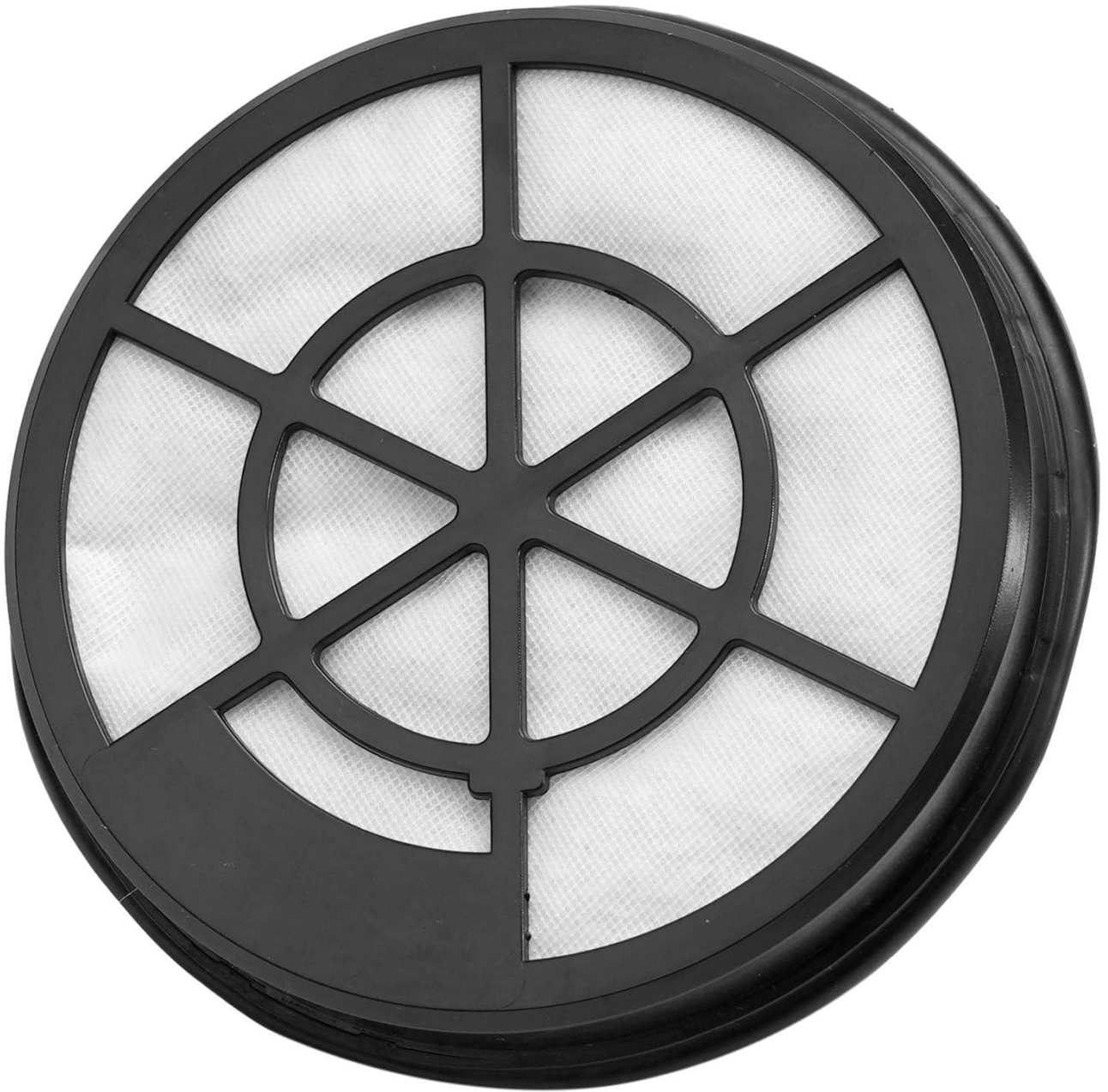
Figure 1: Front view of the circular vacuum cleaner exhaust filter. It features a black plastic frame with a six-spoke design covering a white filter mesh.