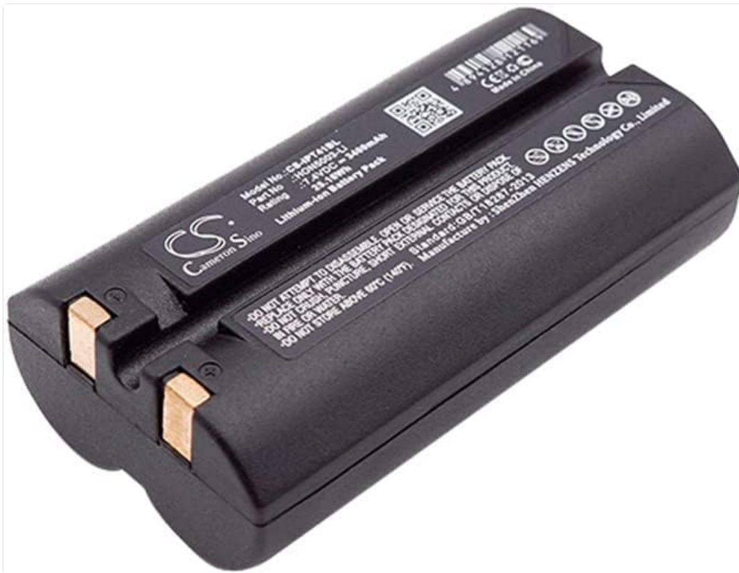
Image: Angled view of the TrustCell battery, highlighting its form factor and connection terminals.