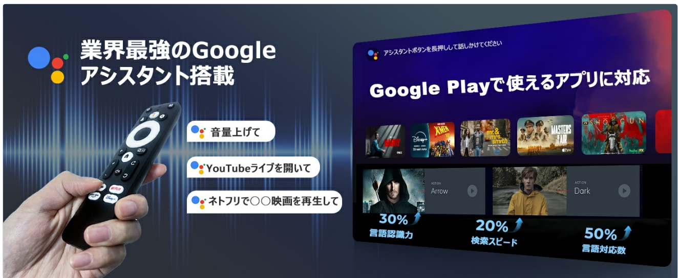
Image: A hand holding the remote control, demonstrating the voice control feature with a visual representation of sound waves and voice commands.