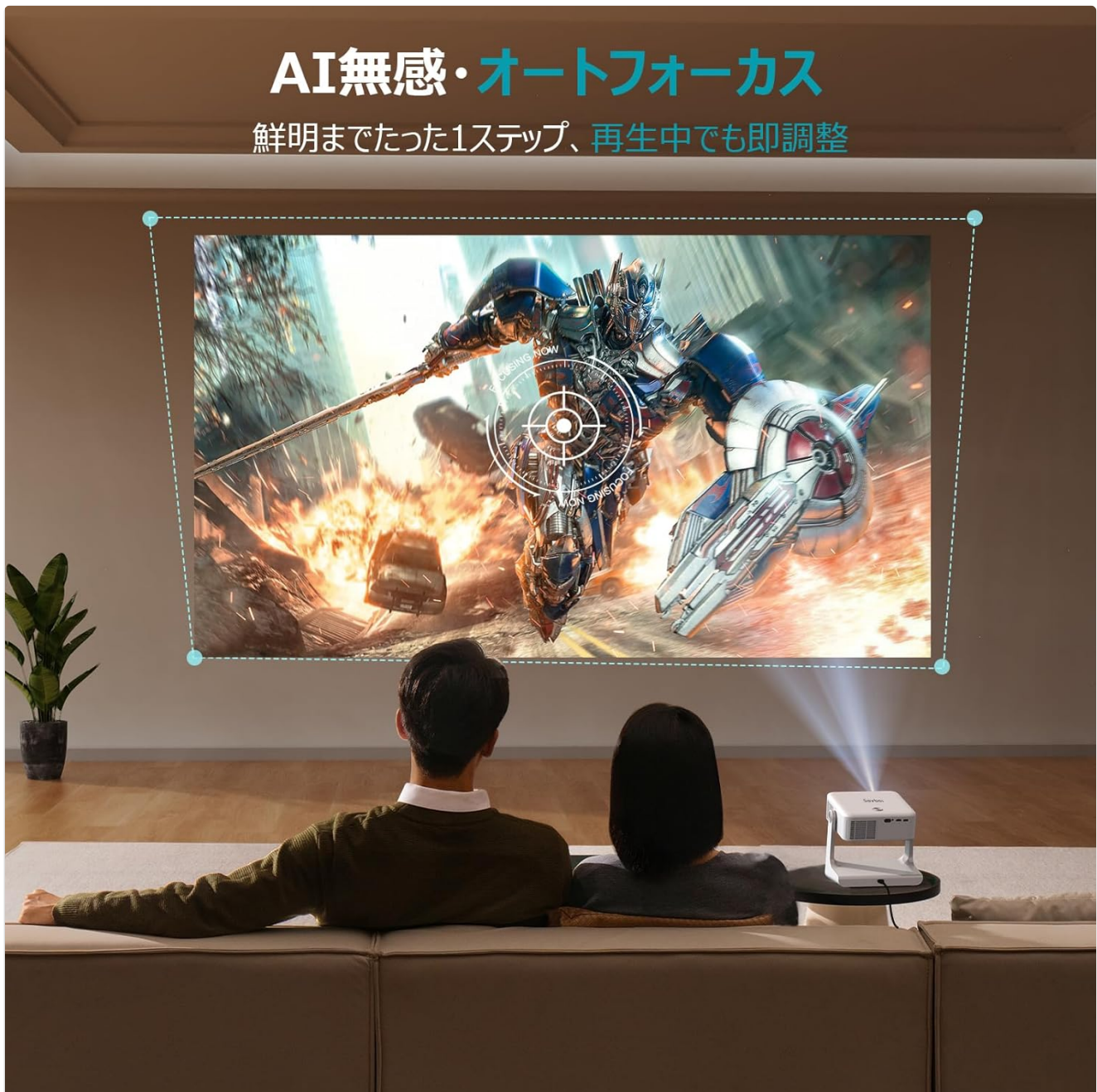
Image: The projector displaying its auto-focus and auto-keystone correction process, ensuring a sharp and perfectly shaped image.

The S61Pro features advanced automatic focus and \pm 45^\circ automatic keystone correction. Upon power-on, the projector will automatically adjust the image for optimal clarity and a perfect rectangular shape, even if placed at an angle. This eliminates the need for manual adjustments, providing a hassle-free setup.