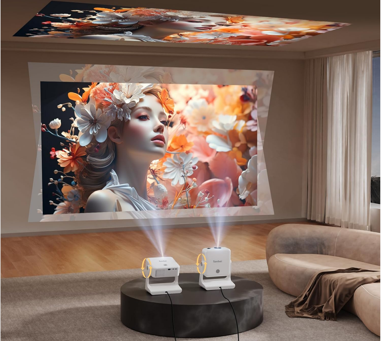
Image: Two projectors demonstrating projection onto a wall and a ceiling, showcasing the flexibility of the integrated stand.