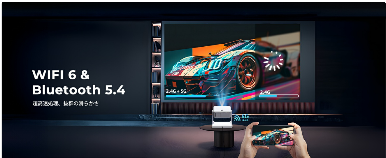
Image: The projector wirelessly connected to a smartphone, illustrating the WiFi 6 and Bluetooth 5.4 capabilities for screen mirroring.

The S61Pro supports high-speed 2.4G/5G WiFi 6 and Bluetooth 5.4, enabling seamless screen mirroring from your smartphone or tablet. You can easily share photos, videos, and even your phone screen directly onto the large projection. Official Google Cast certification allows direct mirroring from Google smartphones without additional devices.