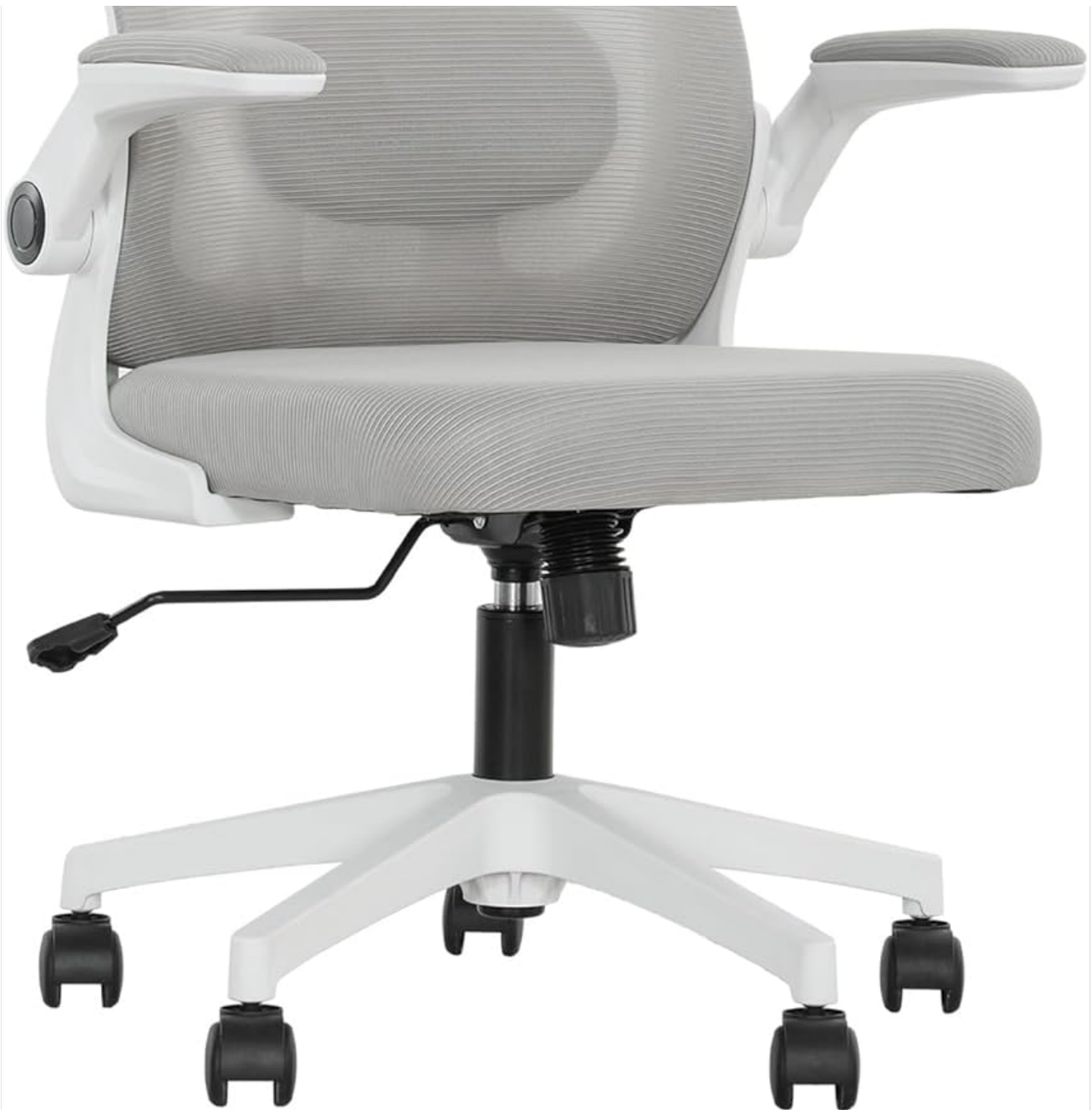
The HOMCOM High Back Desk Chair, designed for comfort and support.