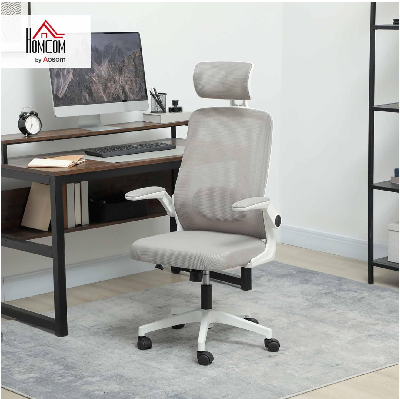
The assembled chair ready for use in a home office environment.