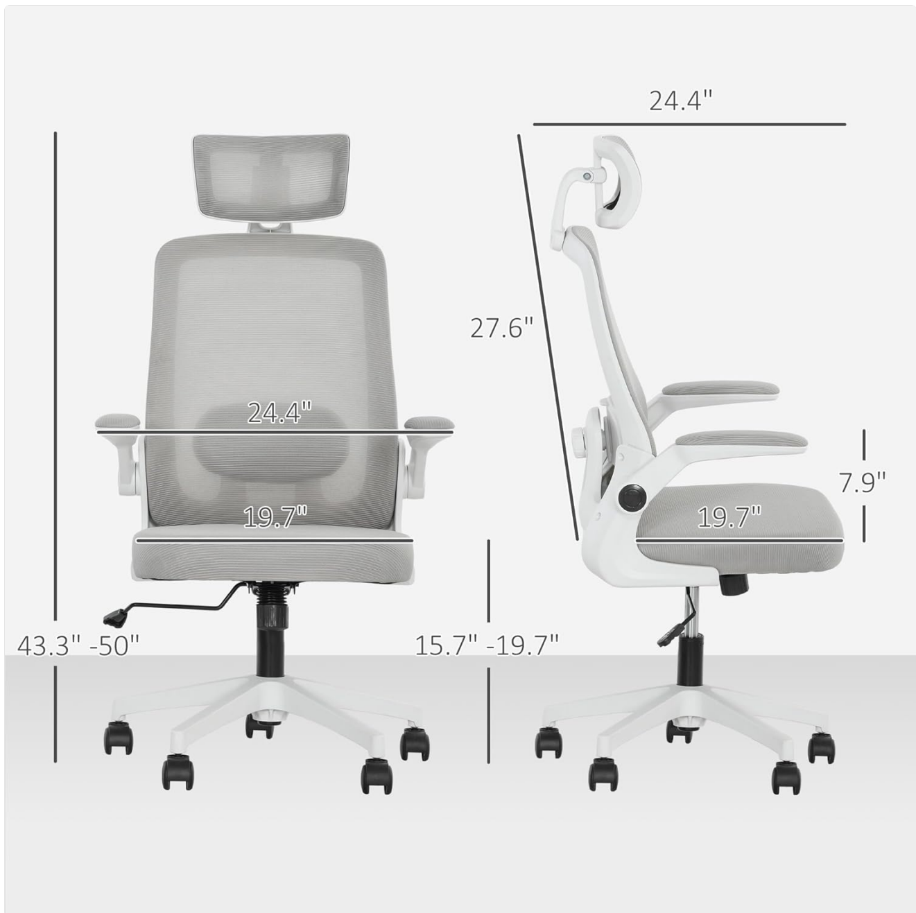
Detailed dimensions of the HOMCOM Office Chair.