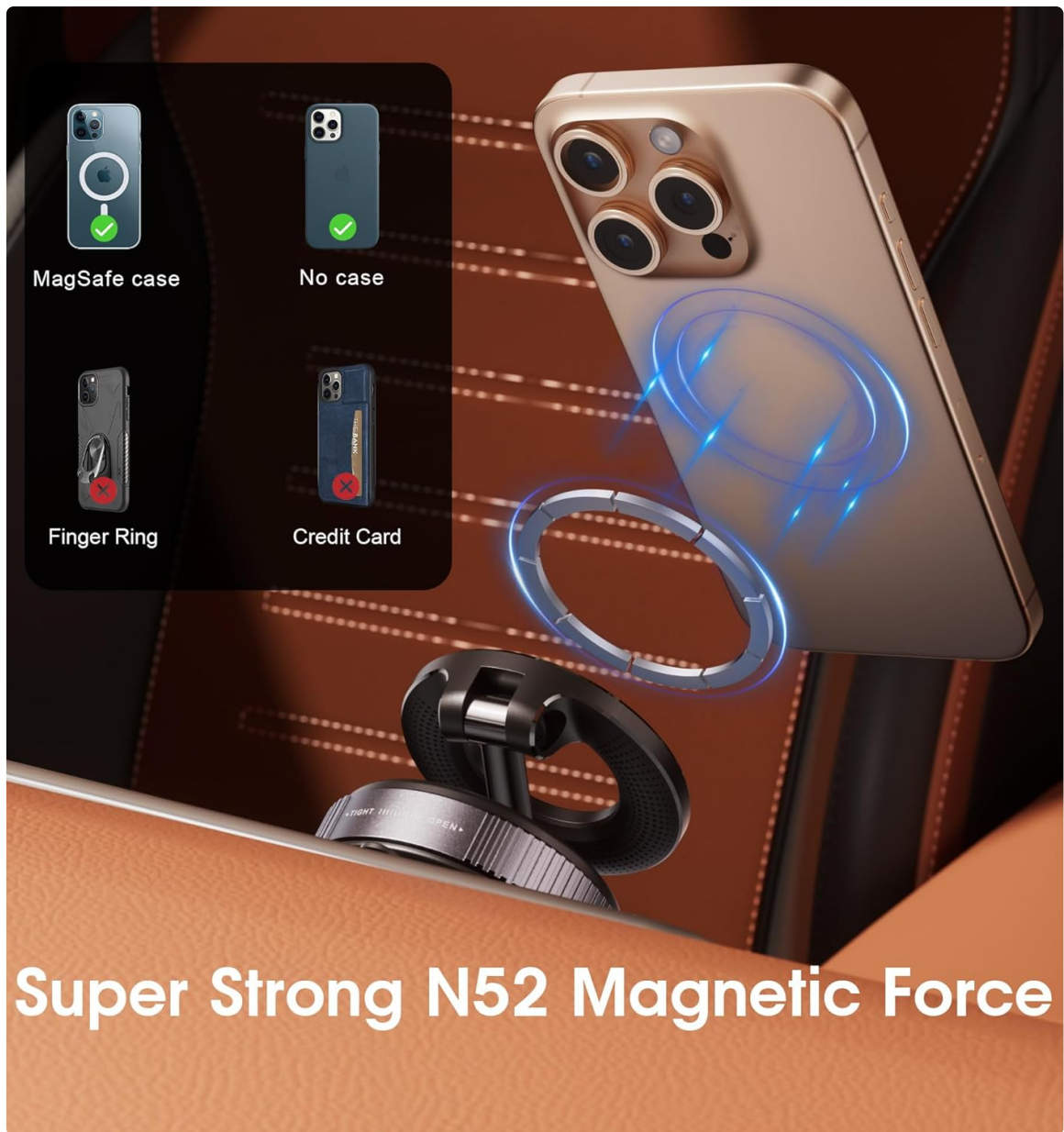
Image: Illustration of magnetic attraction for MagSafe phones and the use of an included metal ring for other devices.