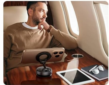
Image: The REOKILY Vacuum Magnetic Car Phone Holder in its compact, foldable state, highlighting its magnetic ring and suction cup base.