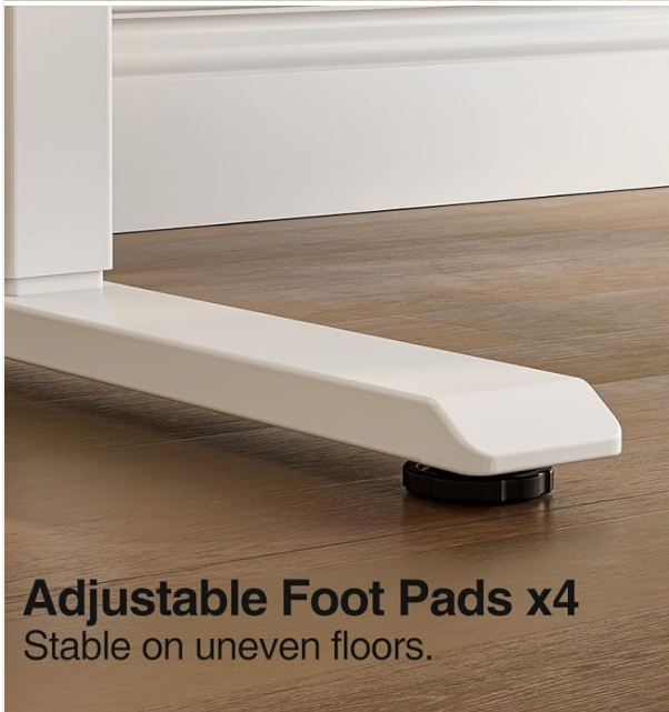
Adjustable Foot Pads x4 Stable on uneven floors.