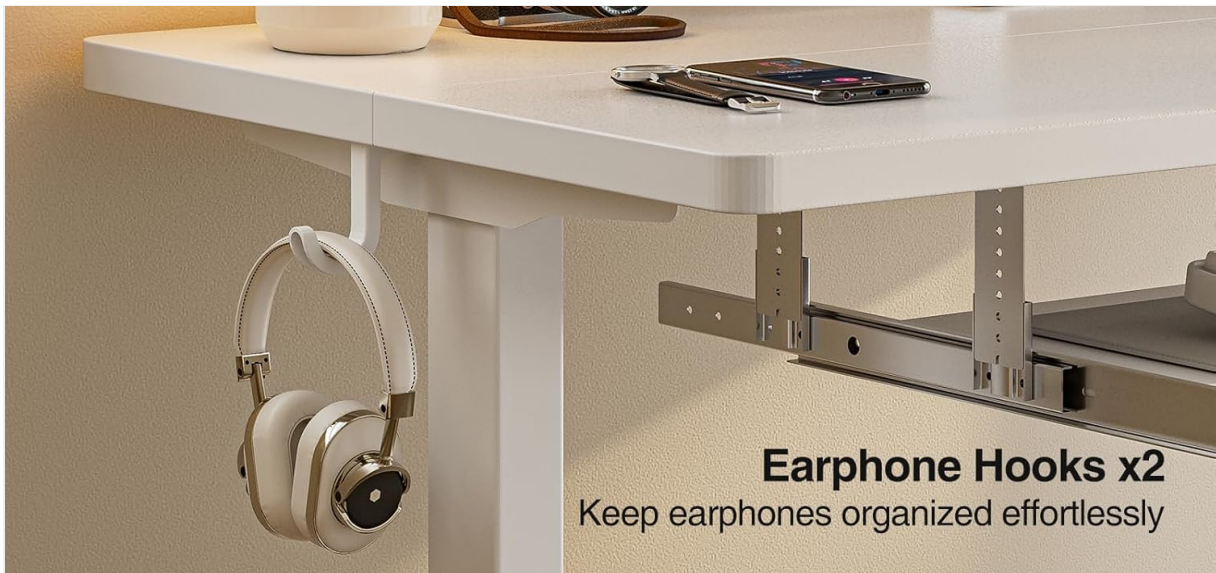
Earphone Hooks x2 Keep earphones organized effortlessly