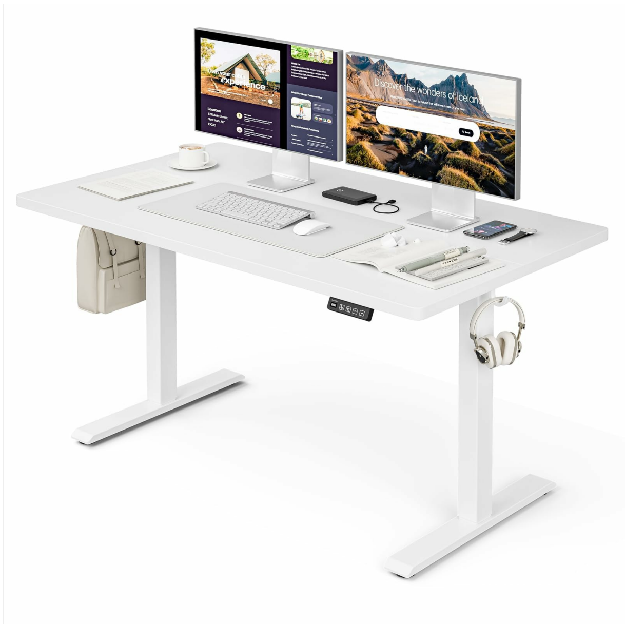
The Grandder 47x24 Inch Electric Standing Desk with Keyboard Tray, featuring a white desktop and frame, integrated keyboard tray, and a control panel for height adjustment.