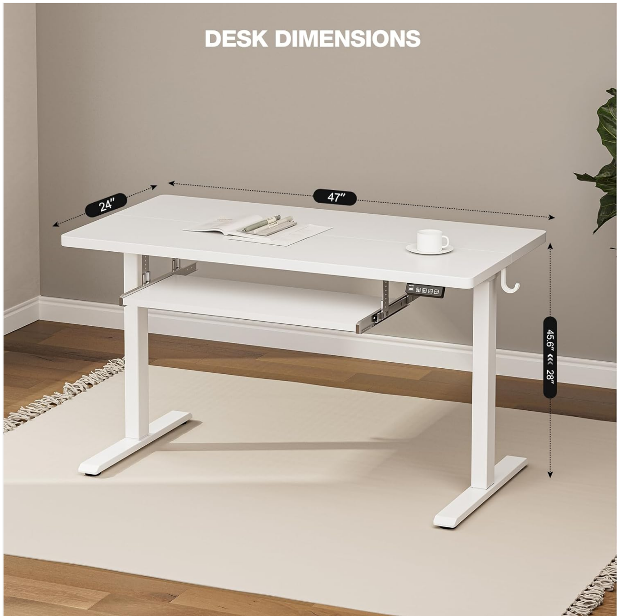
Desk dimensions: 47 inches wide, 24 inches deep, with a height range of 28 to 45.6 inches.