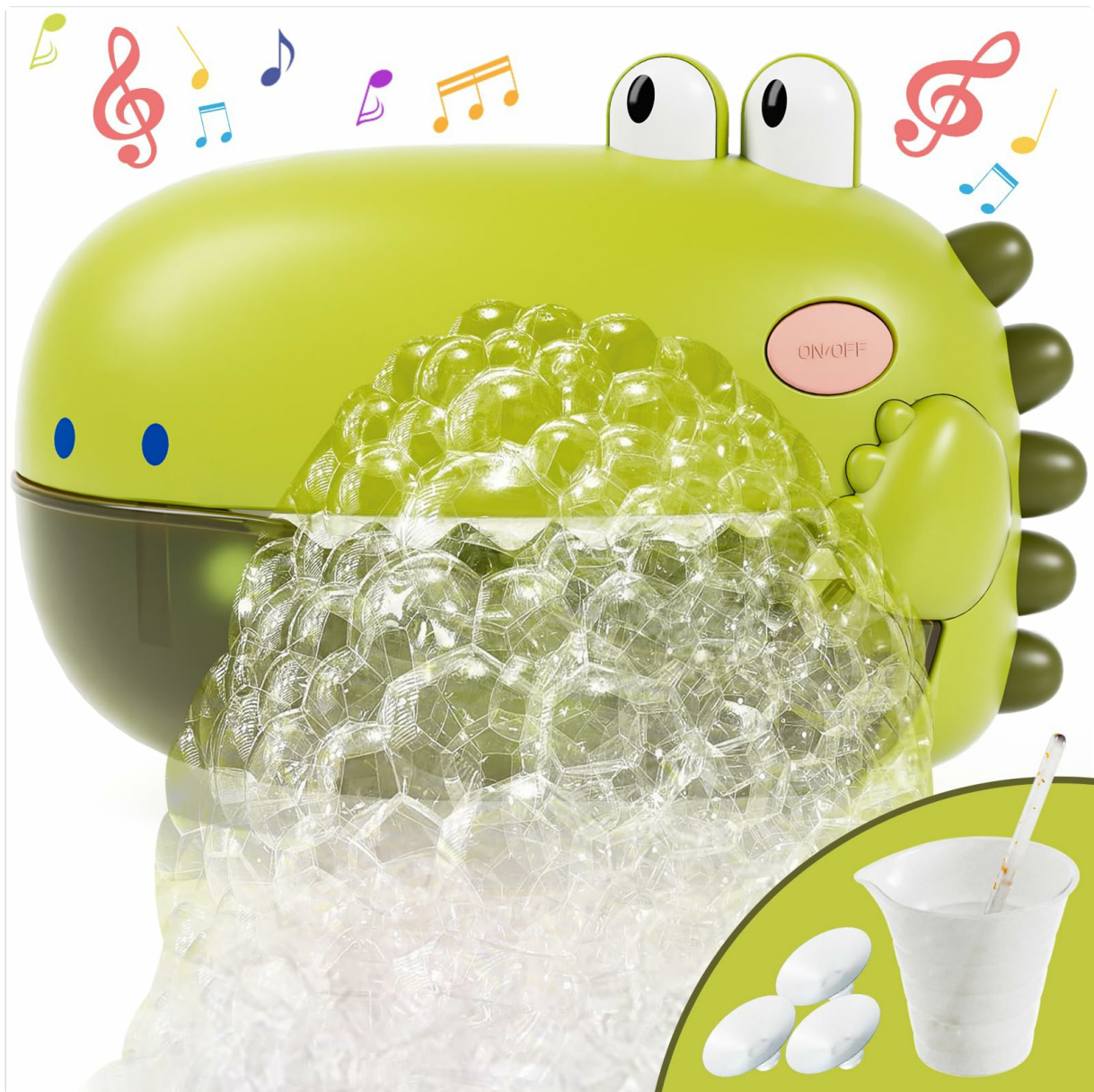
Figure 1: Lehoo Castle Dinosaur Baby Bath Bubble Machine (Green model).