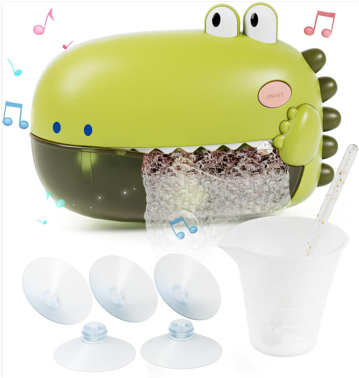
Figure 7: Kit contents and dimensions of the bubble machine.