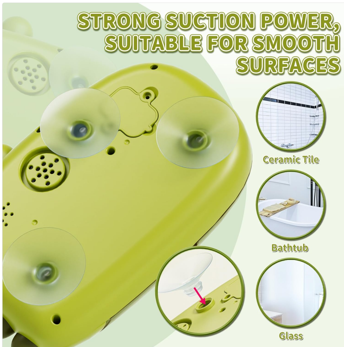
Figure 5: The strong suction cups ensure secure attachment to smooth surfaces.

Your browser does not support the video tag.