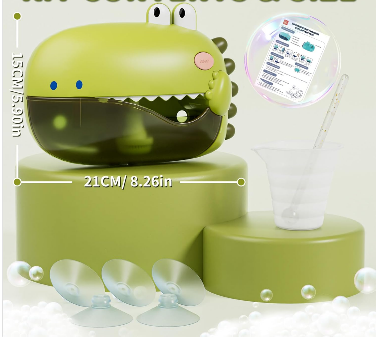
Figure 2: All components included in the Lehou Castle Dinosaur Baby Bath Bubble Machine package.