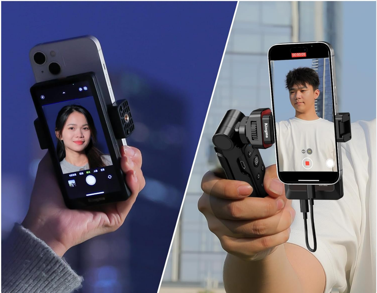
Image: Newmowa 5-inch Phone Vlog Selfie Monitor Screen attached to an iPhone, showing a user taking a selfie with the rear camera.