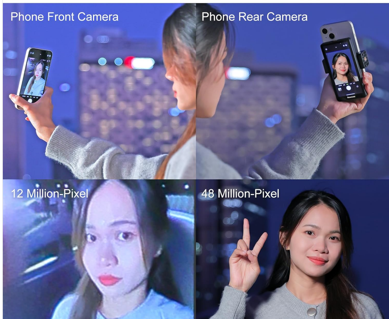
Image: Newmowa 5-inch Phone Vlog Selfie Monitor Screen connected via wired USB-C to an iPhone for 4K 30fps recording.

The rear camera takes clearer photos than the front camera in the same photo.