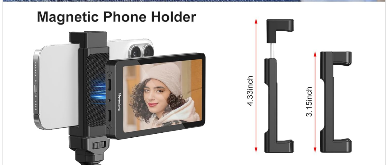
Image: Newmowa 5-inch Phone Vlog Selfie Monitor Screen showing wireless recording with a Bluetooth remote control.