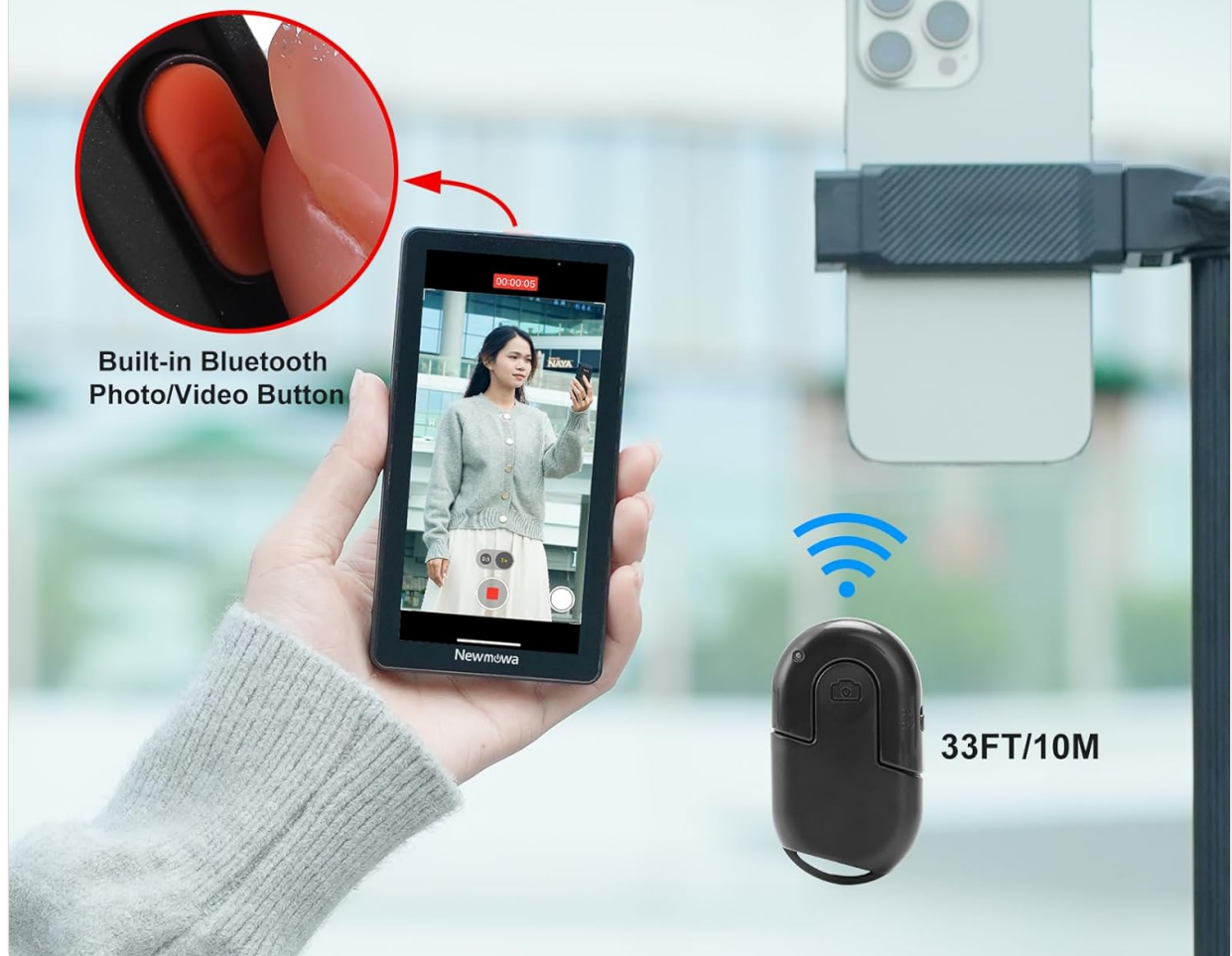
Image: Newmowa 5-inch Phone Vlog Selfie Monitor Screen with magnetic phone holder attached to an iPhone.

Note: Wireless connection does NOT support 4K recording, please select 1080P recording. And iPhone cannot play sound during screen sharing.