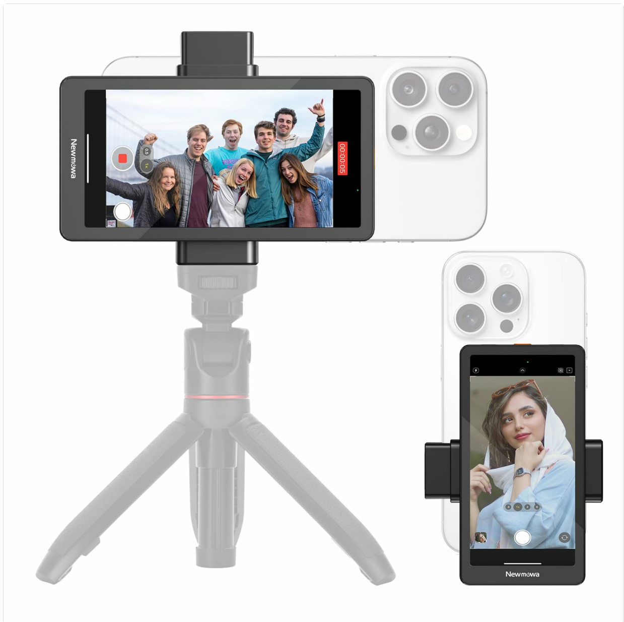
Image: Newmowa 5-inch Phone Vlog Selfie Monitor Screen demonstrating screen rotation with a dedicated button.