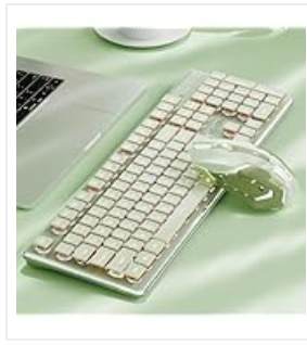
Image 2: The keyboard is compatible with various operating systems including Windows, Mac OS, Android, Google, and Linux, and devices such as PCs, laptops, tablets, and gaming consoles.