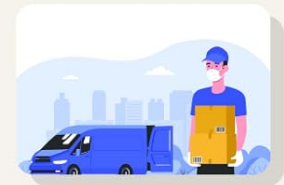
Returns And Exchanges