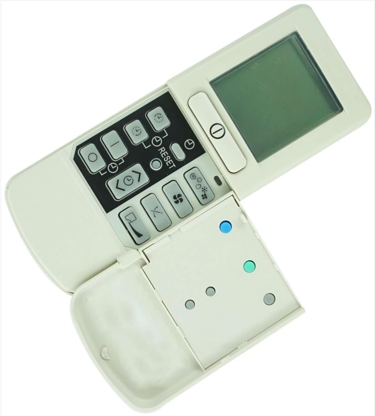
Image 3: Front view of the remote control with the sliding panel open, showing all available buttons for various functions.

To operate the air conditioner, point the remote control directly at the air conditioner's receiver. Ensure there are no obstructions between the remote and the unit.