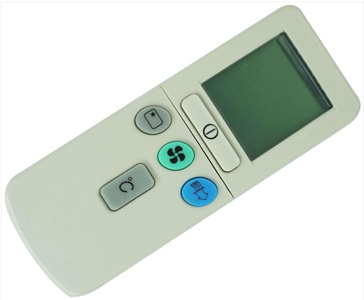
Image 1: Front view of the replacement remote control. This image displays the primary buttons and the LCD screen.