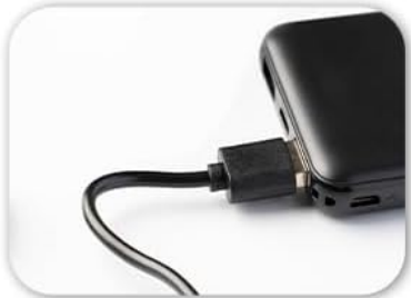
Power Bank Charging