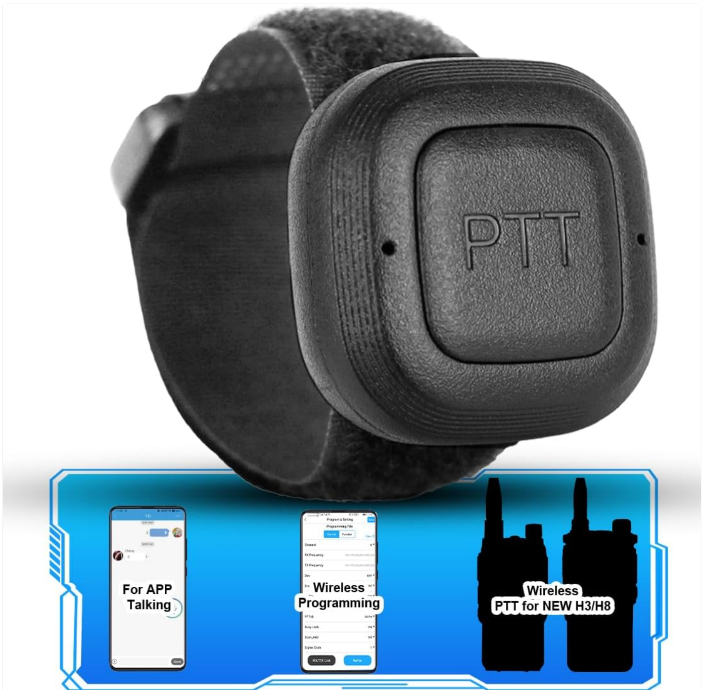
Image: The TIDRADIO 3-in-1 Wireless Programmer and Bluetooth PTT Button, showcasing its compact design and multi-functionality.