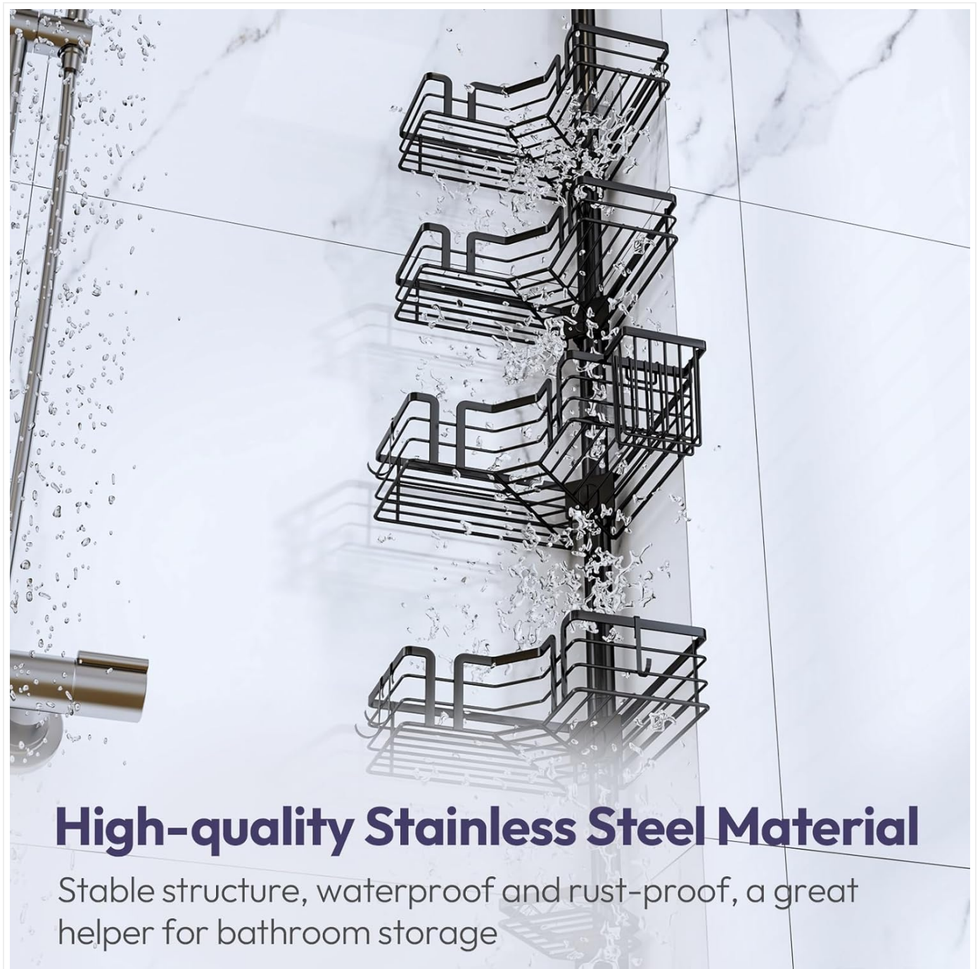
Image Description: This close-up image highlights the hollow mesh design of the shower caddy baskets, showing water actively draining through them. This feature is designed to prevent water accumulation, keeping toiletries dry and reducing the risk of mold or mildew buildup.