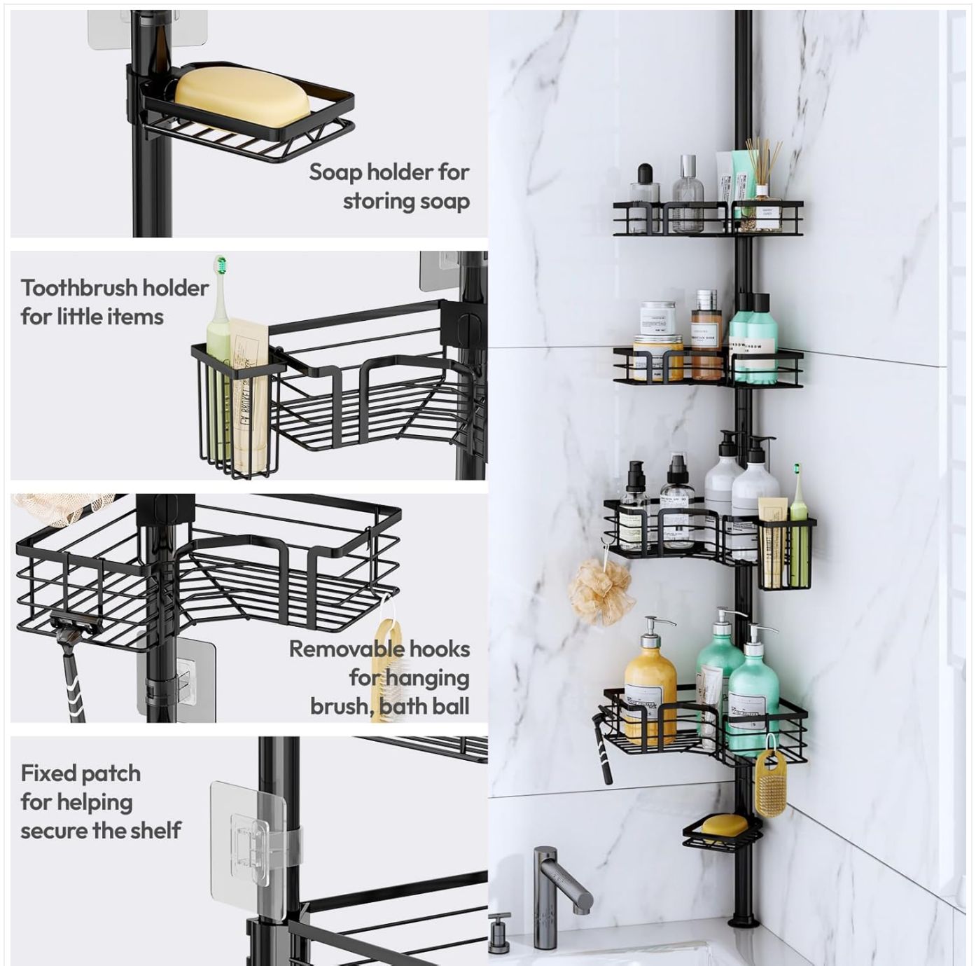
Image Description: This image provides a detailed view of how to attach the various accessories to the shower caddy pole. It shows the snap-on mechanism for the baskets, the placement of the soap holder and toothbrush holder, and the use of removable hooks for additional storage. An adhesive fixed patch is also visible, demonstrating how to secure the pole to the wall for enhanced stability.