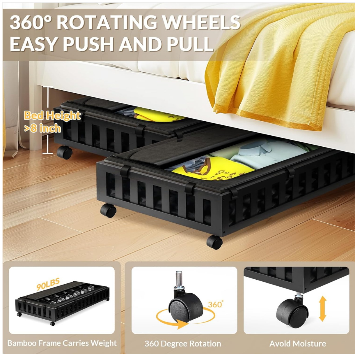
Figure 2.2.1: Detail of the 360-degree rotating wheels for easy movement.

Your browser does not support the video tag.