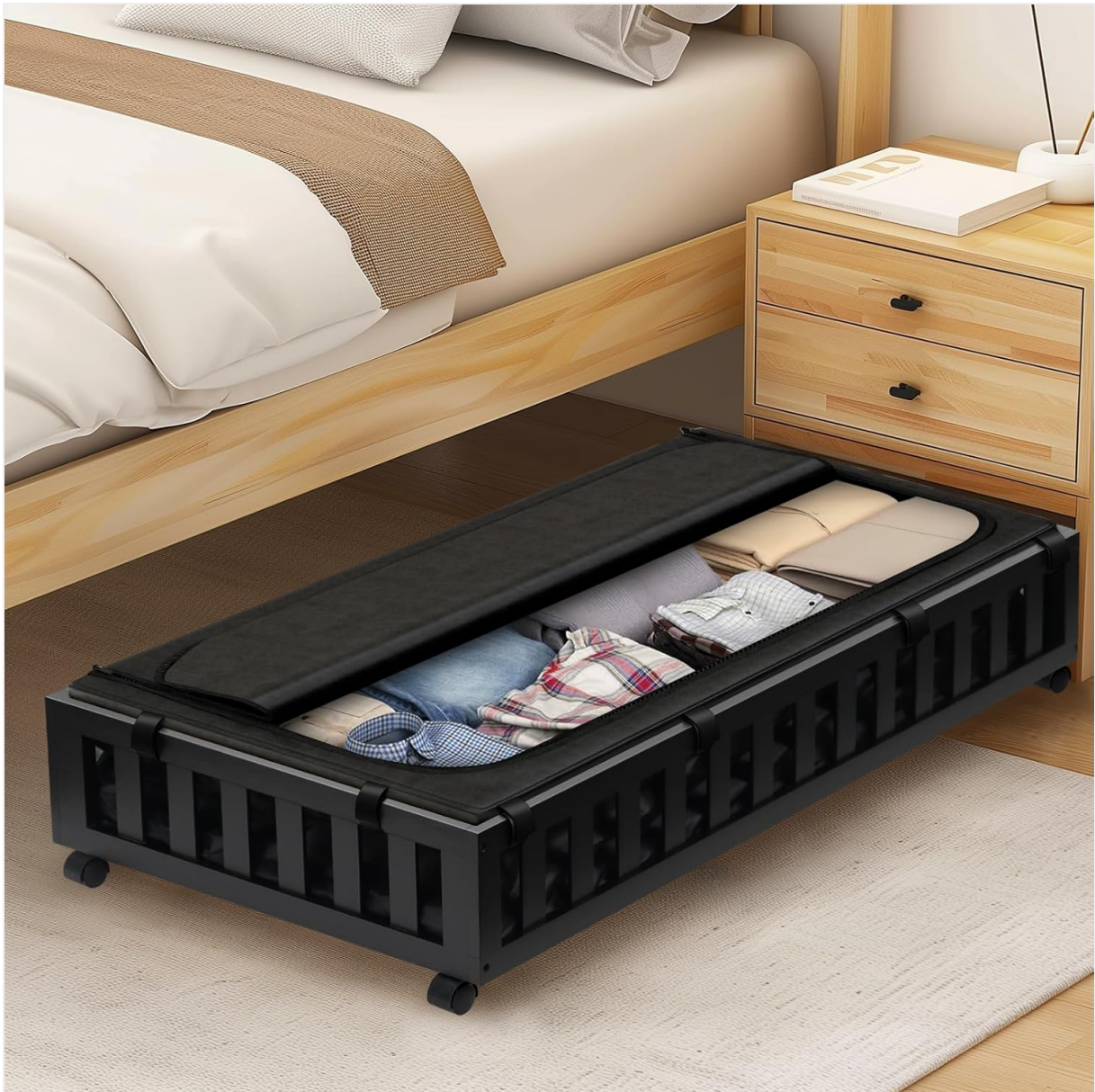
Figure 3.1.1: Storing various items within the container.