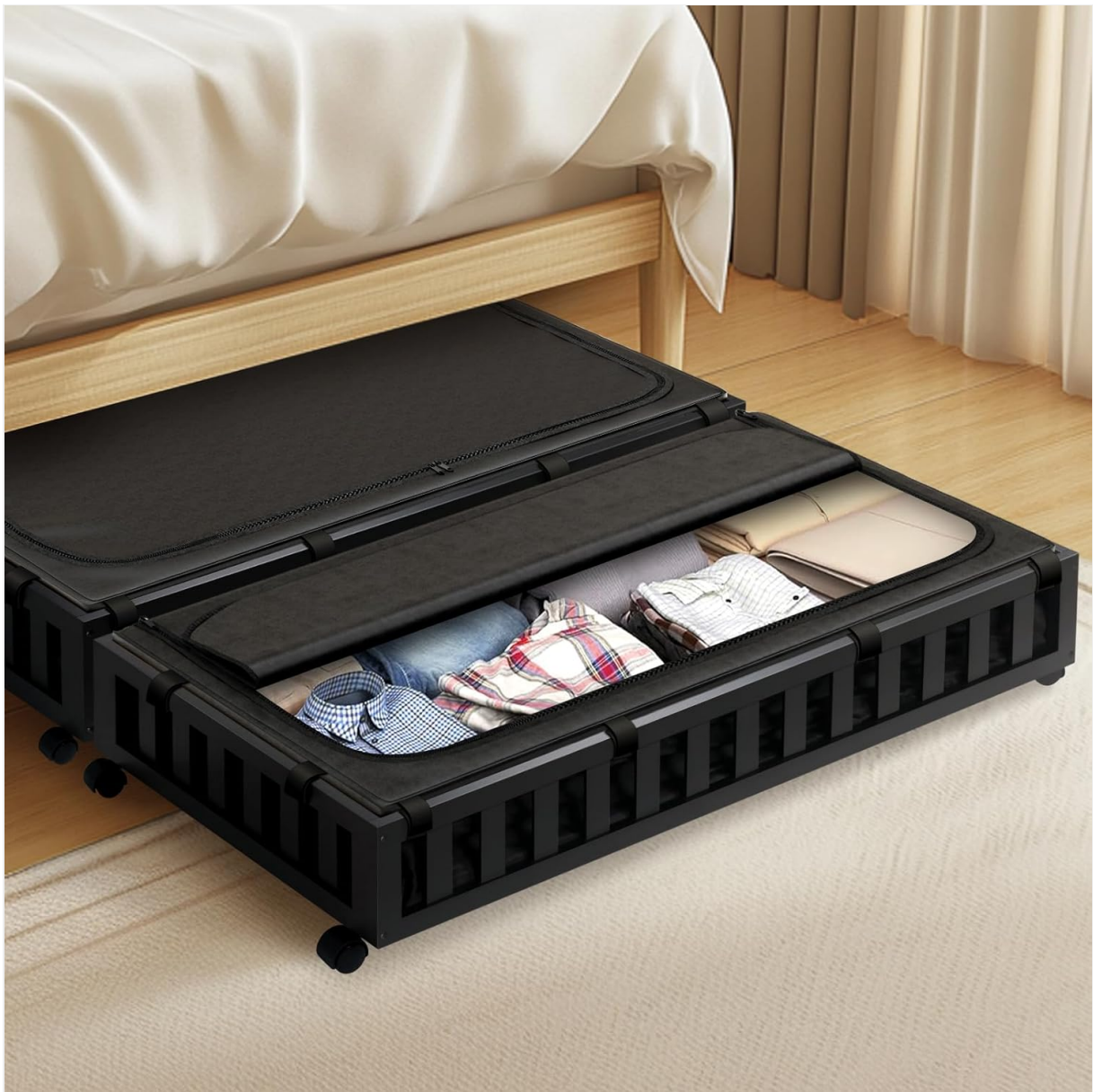
Figure 1.1.1: Gashell Bamboo Under Bed Storage Container (Black).