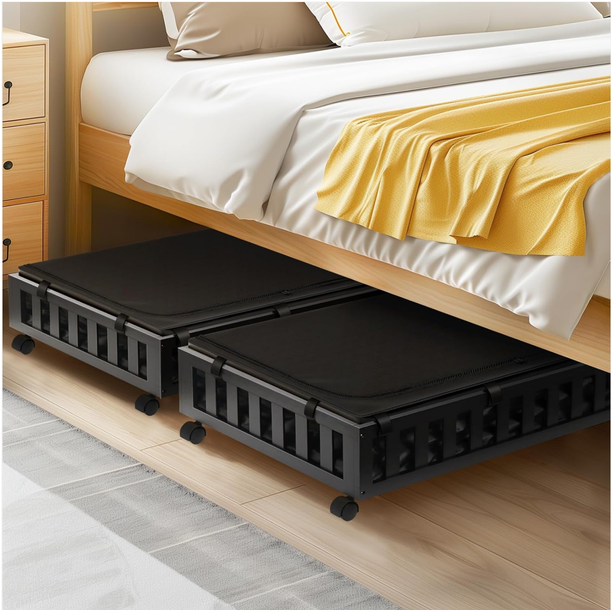
Figure 3.2.1: Containers stored under a bed.