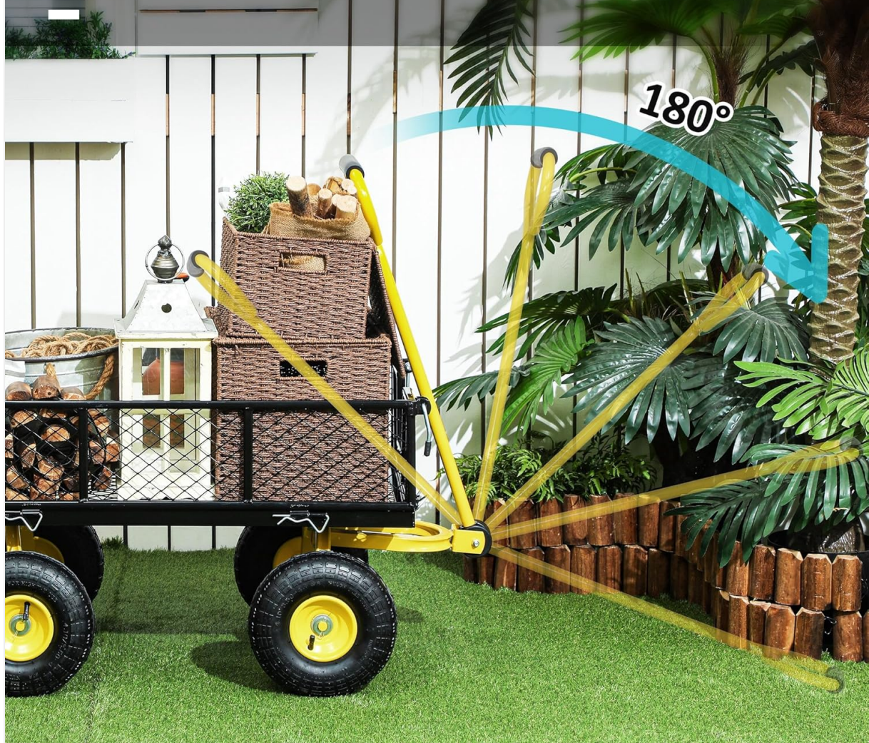
Image: An illustration showing the 180-degree range of motion for the garden cart's handle, indicating flexible steering.

You can haul the cart in any direction freely