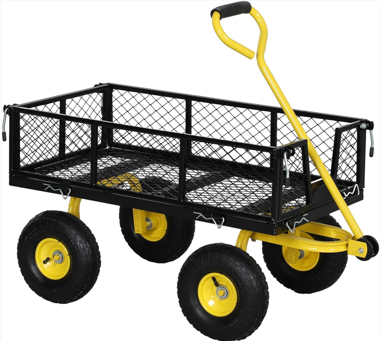
Image: The Outsunny Heavy Duty Garden Cart, showcasing its black mesh bed, yellow steel frame, and large pneumatic wheels.