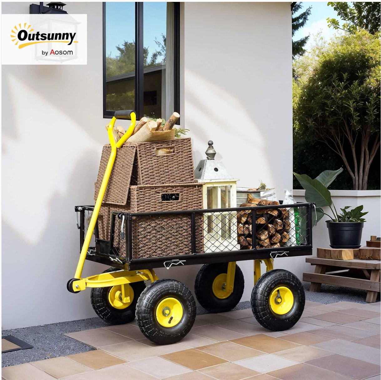
Image: The garden cart loaded with various items, demonstrating its capacity for hauling.