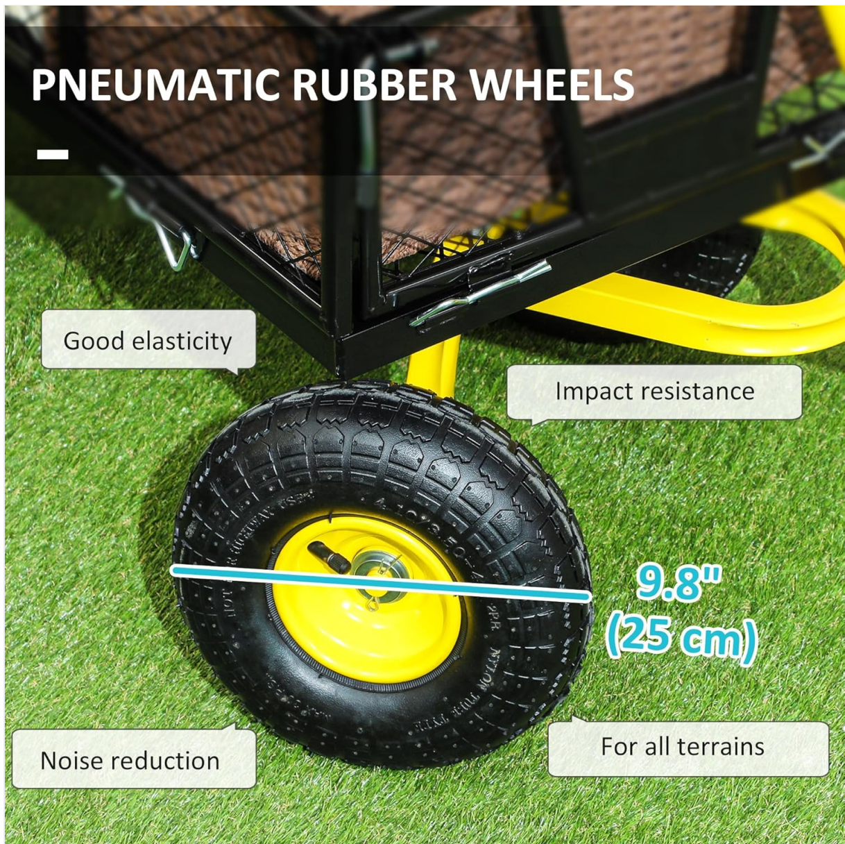
Image: A detailed view of the 10-inch pneumatic rubber wheel, highlighting its all-terrain capability and impact resistance.