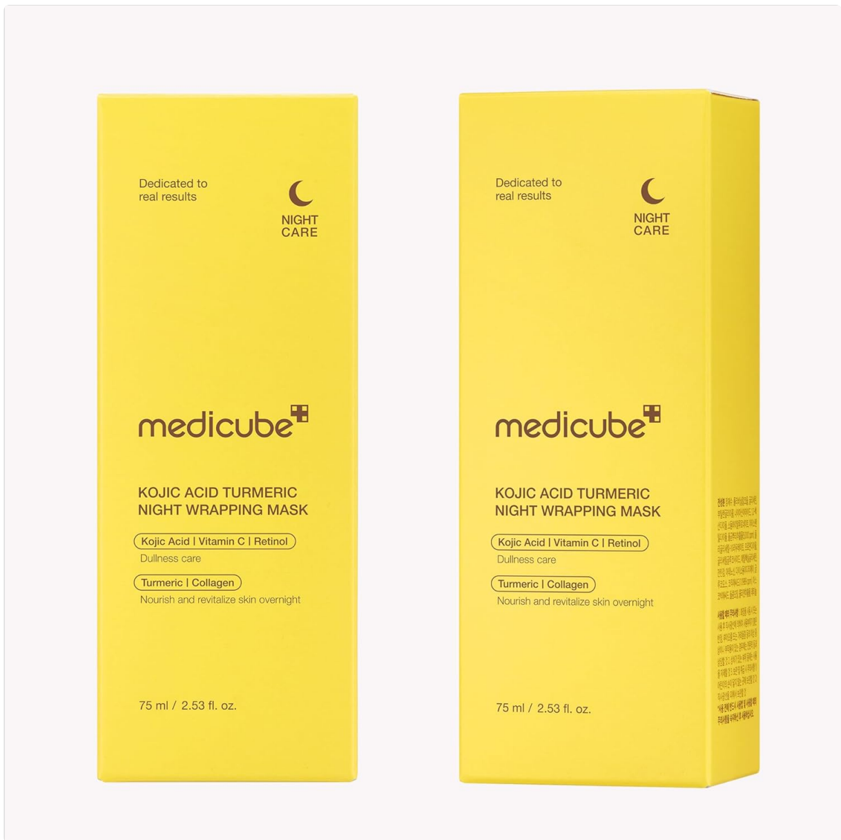
Image: Detailed list of ingredients.