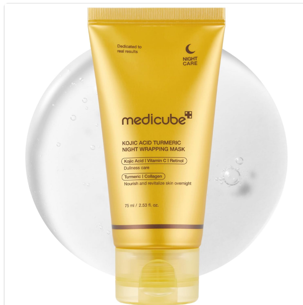
Image: The medicube Kojic Acid Turmeric Overnight Wrapping Peel Off Mask product packaging.

The medicube Kojic Acid Turmeric Overnight Wrapping Peel Off Mask is designed to brighten and defend against skin stress, promoting a clear, glowing complexion. This innovative wrapping film, powered by Kojic Acid, Turmeric, and Collagen, provides 8 hours of intensive brightening care while you sleep. Users can expect visibly smoother, brighter, and more even-toned skin with a radiant glow upon waking.