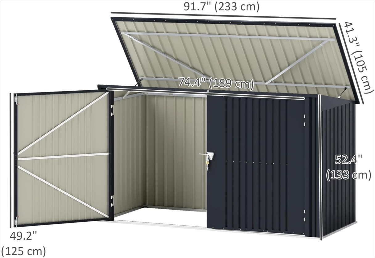
Image: A diagram illustrating the key dimensions of the Outsunny storage shed, including width, depth, and height with the lid open and closed.