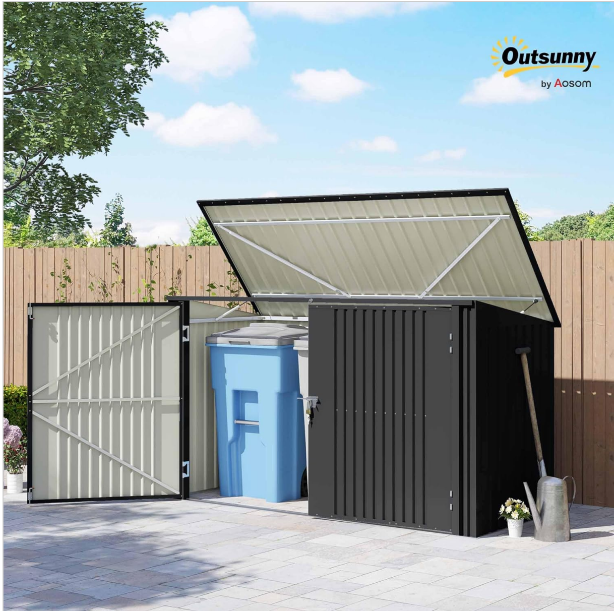
Image: The Outsunny Horizontal Outdoor Storage Shed with its top lid and double front doors open, revealing the spacious interior designed to hold multiple trash cans. A shovel and watering can are visible on the side, indicating its versatility for garden storage.