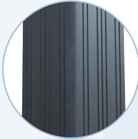
Galvanized Steel Frame more durable