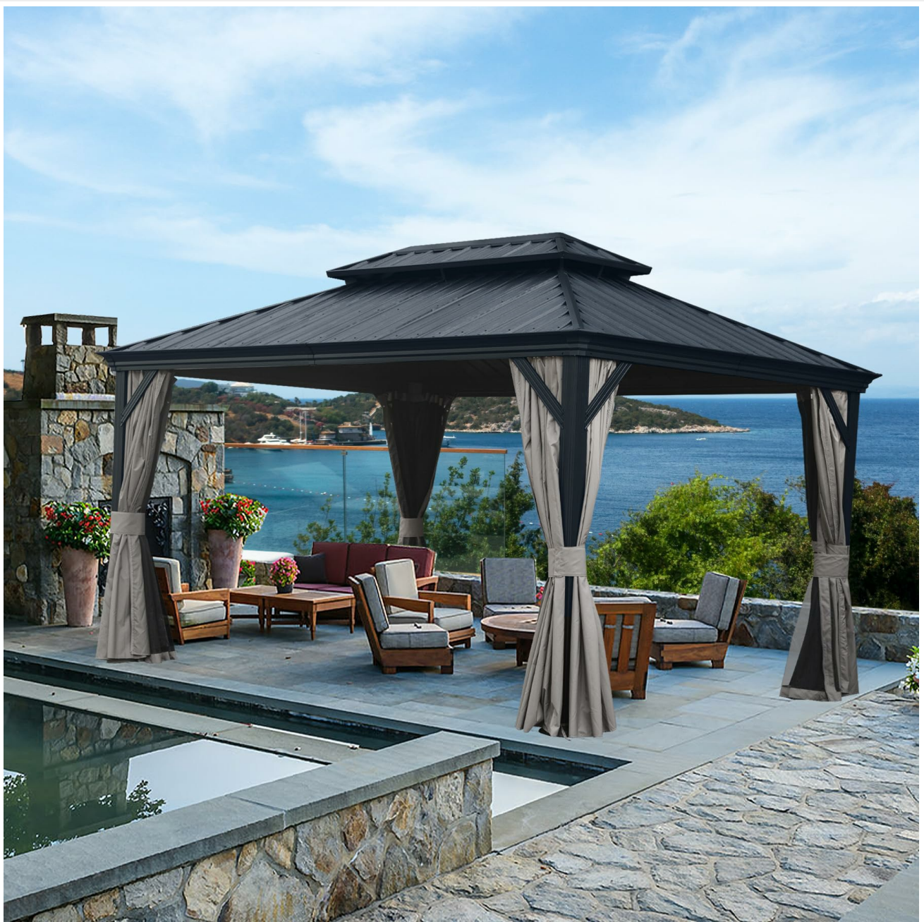
Image 1.1: The SHPAI 10' x 14' Outdoor Hardtop Gazebo in an outdoor setting.