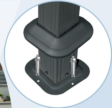
Anchoring Plate more sturdy