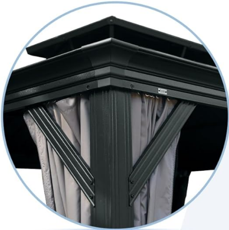
Triangular Structure more stable