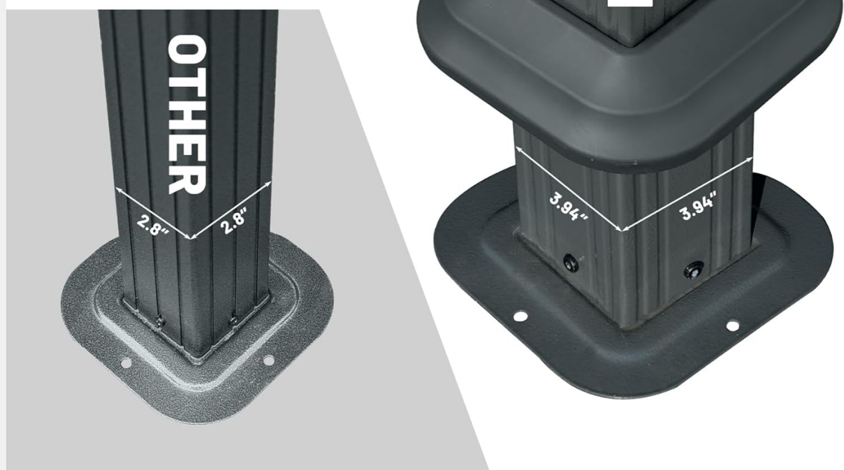
Image 3.3: Detail of the upgraded 3.94" posts and plastic base cover, designed to prevent rust and protect from sharp screws.

Prevents rust and protects children and pets from sharp screws, enhancing safety.