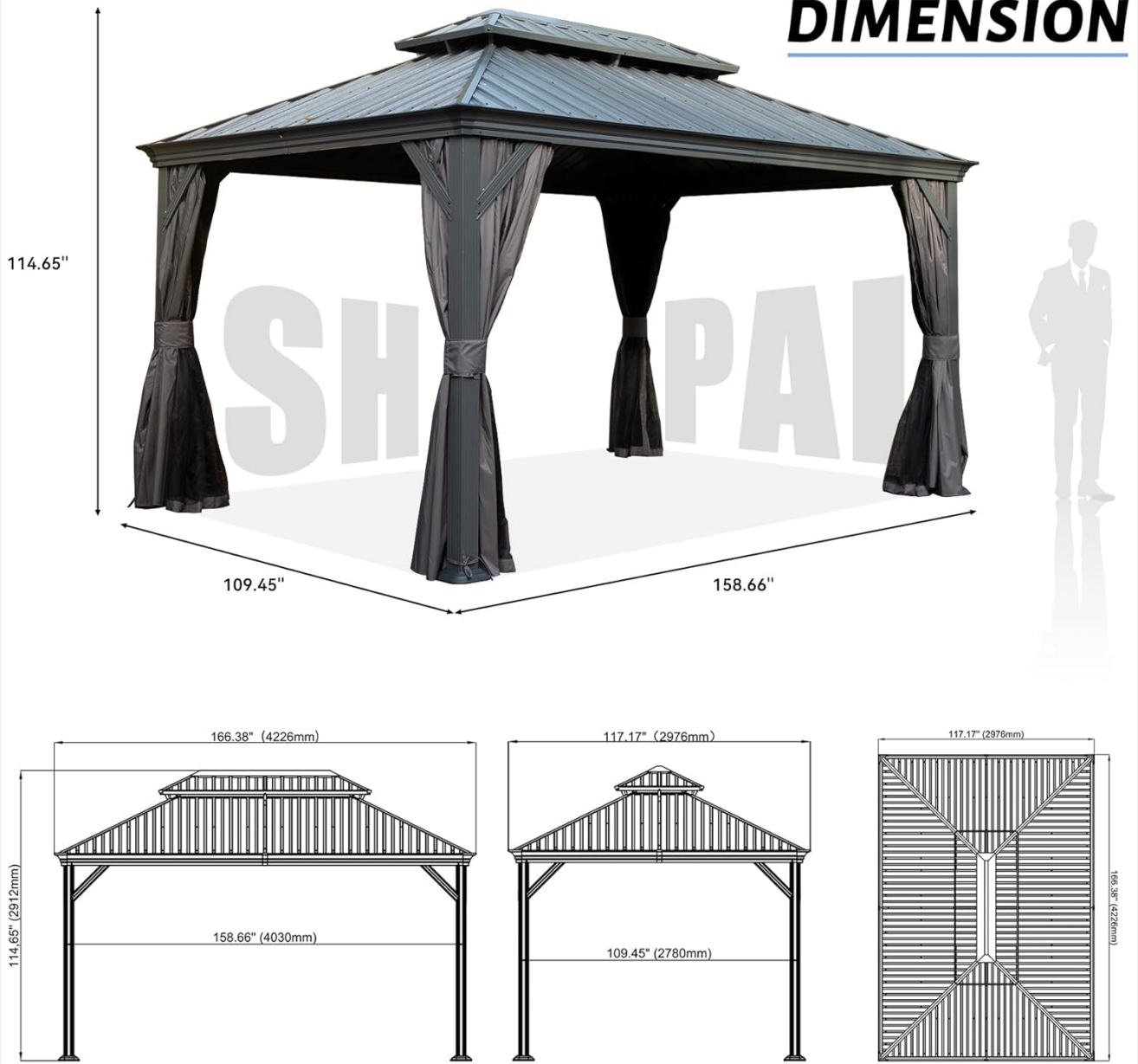
Image 7.1: Detailed dimensions of the gazebo, including height, length, and width.