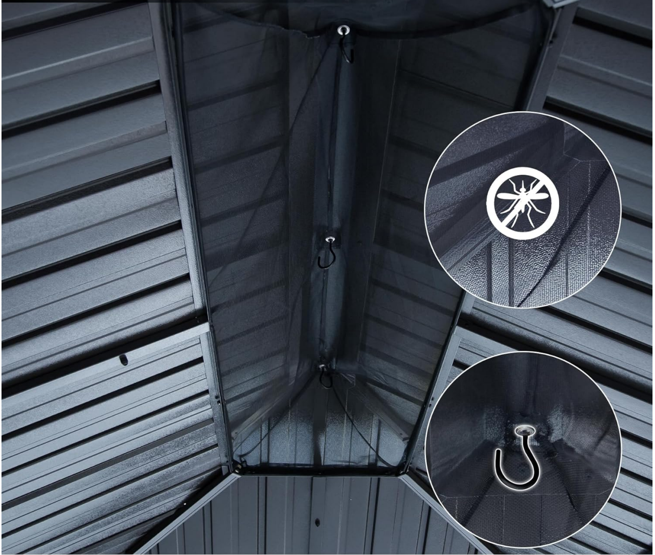
Image 4.2: View of the ceiling netting and integrated hooks for hanging lights or decorations.

Netting prevents bugs while hooks for hanging lights or deco.