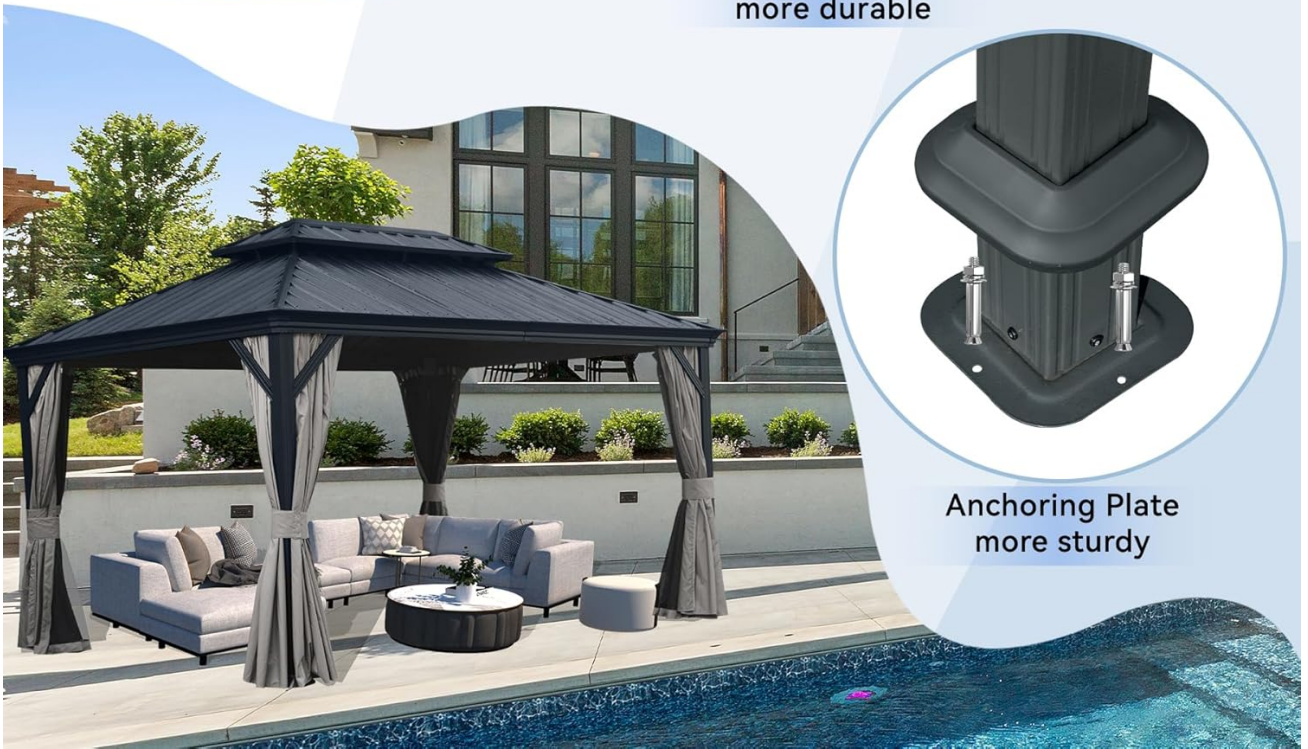
Image 3.1: Illustration of the triangular structure, galvanized steel frame, and anchoring plate for enhanced stability.