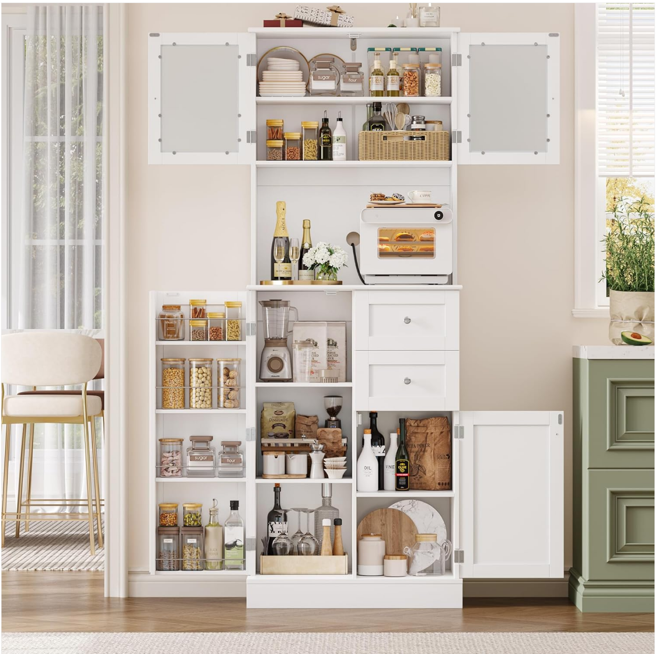
Image 1.1: Fully assembled BOTLOG Kitchen Pantry Cabinet with contents.