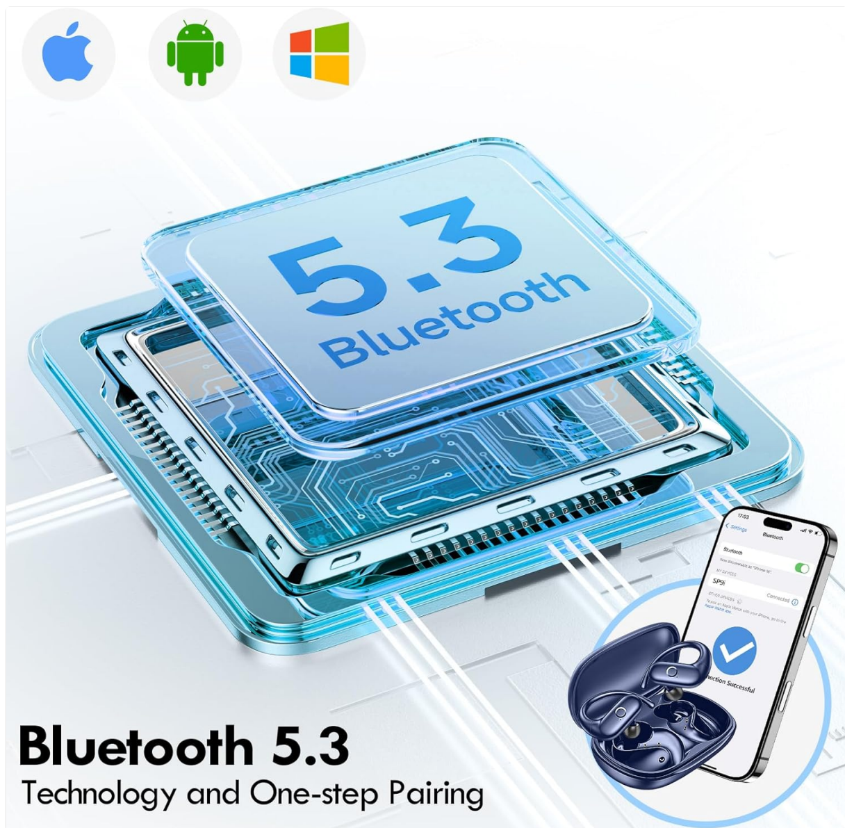
Image: Visual representation of Bluetooth 5.3 technology and the one-step pairing process with a smartphone.