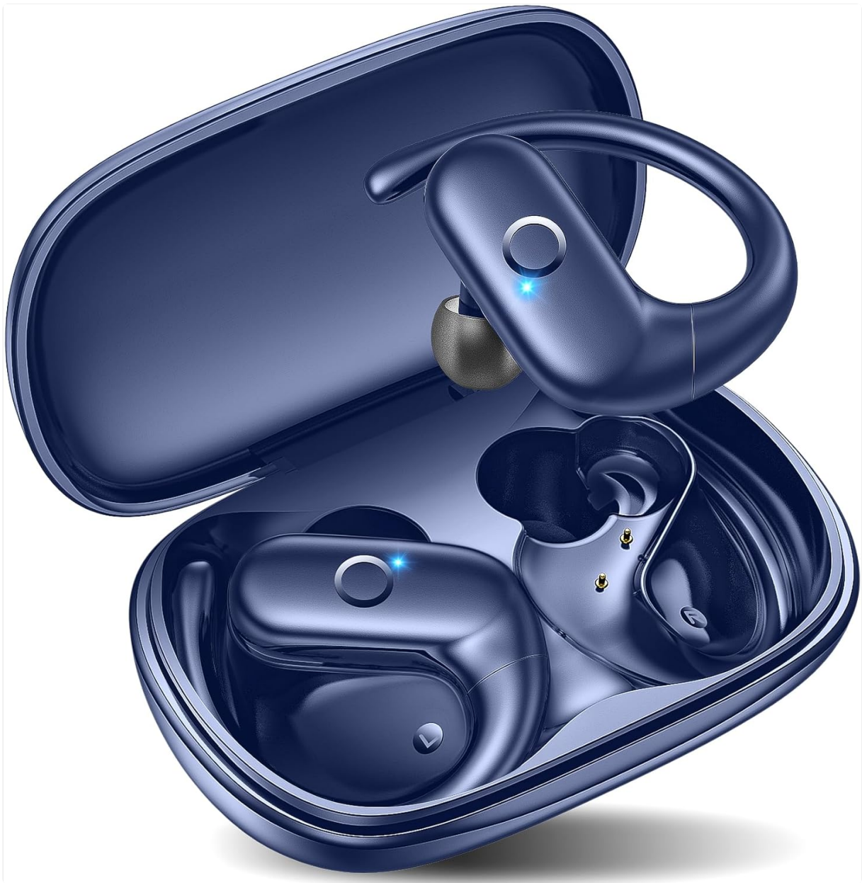
Image: kurdene SP9I Wireless Earbuds in their charging case.

Video: Unboxing and overview of the kurdene SP9I Wireless Earbuds, showing the earbuds, charging case, and included accessories.