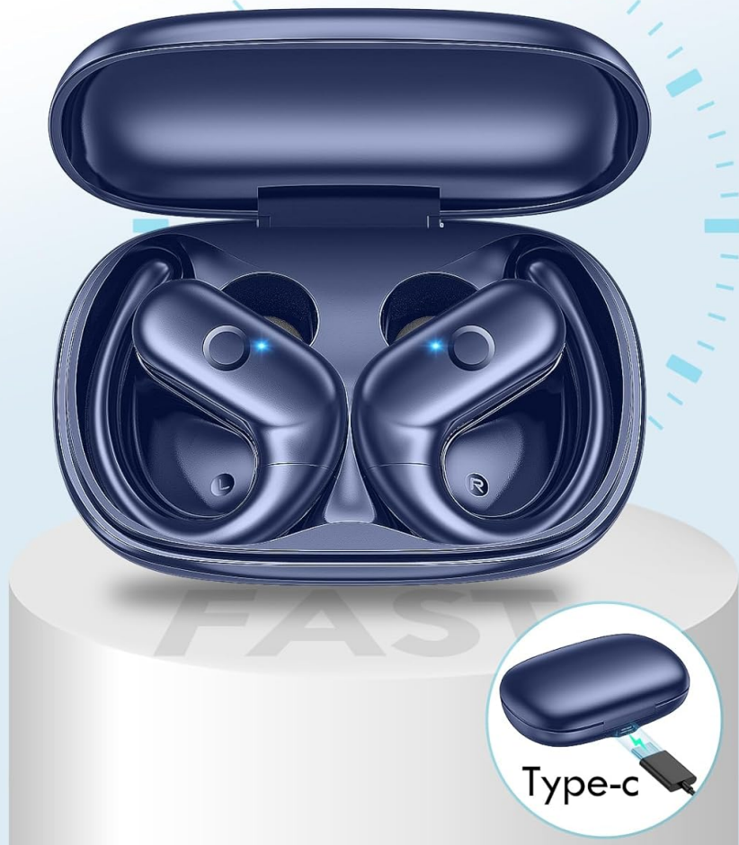
Image: Graphic illustrating the 60-hour total battery life and charging times for the kurdene SP9I earbuds and case.