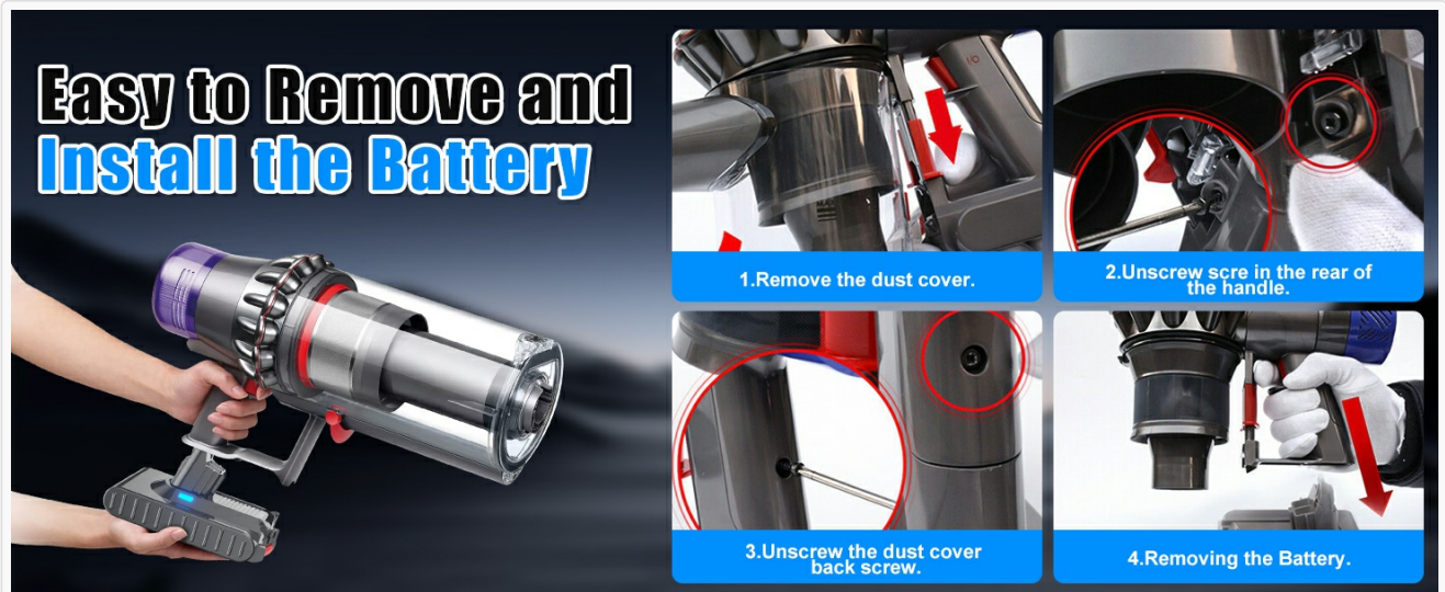
Image: A step-by-step visual guide demonstrating how to easily remove and install the battery in a Dyson V8 vacuum cleaner.