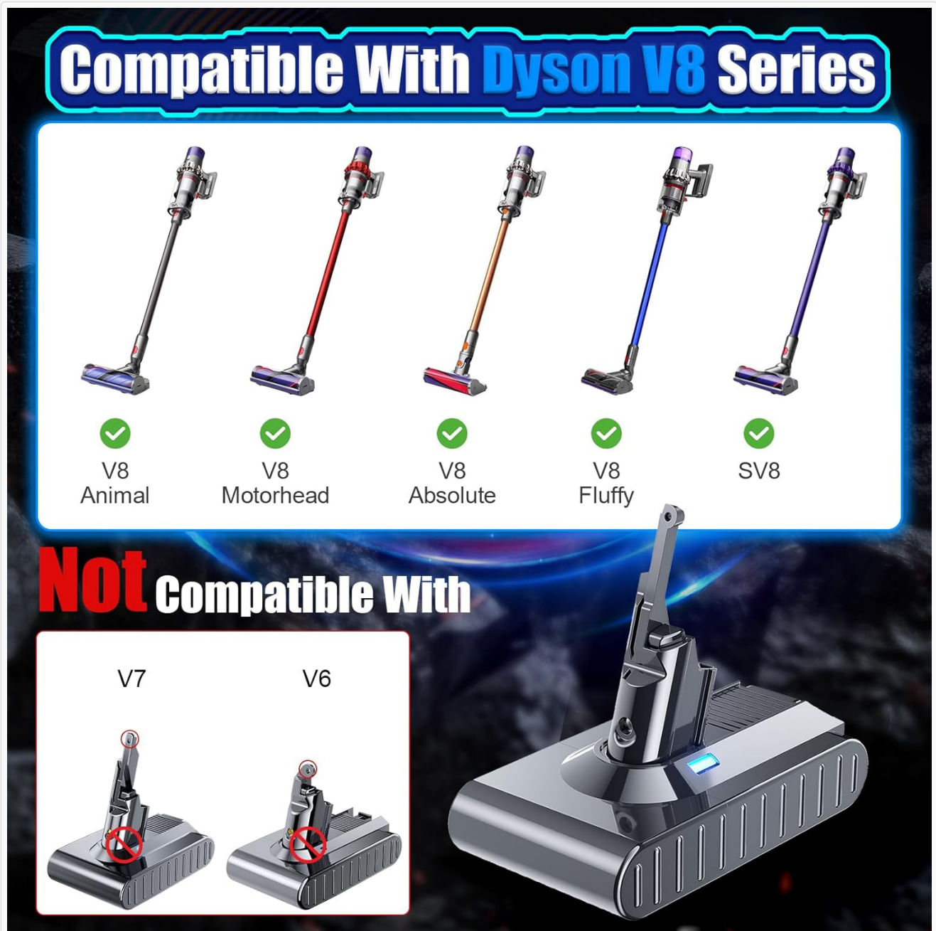
Image: A visual guide illustrating the compatibility of the battery with various Dyson V8 models and explicitly stating incompatibility with V6 and V7 models.

Important: This battery is NOT compatible with Dyson V6 or V7 series vacuum cleaners.