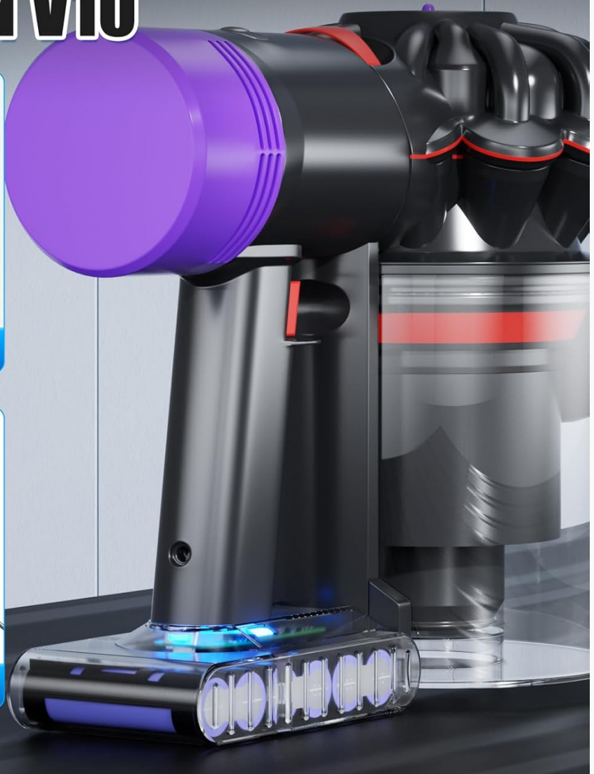
Image: Illustration of two convenient methods for charging the Dyson V8 vacuum with the POWTREE replacement battery: using a drop-in docking station or a direct plug-in connection.