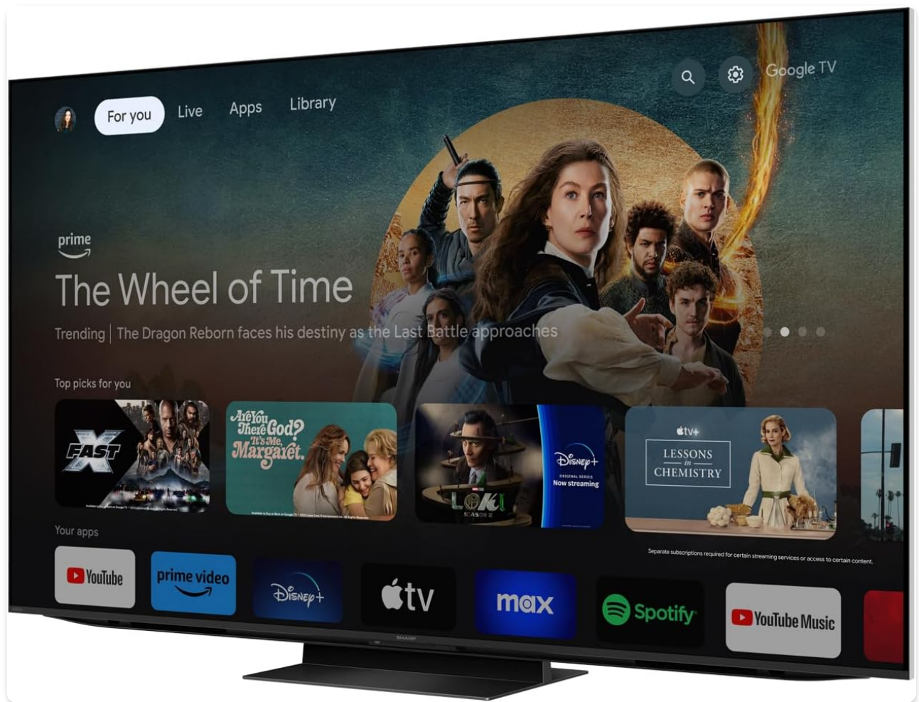
Figure 5: The Google TV interface on the Sharp AQUOS XLED TV, displaying various streaming applications and content recommendations.