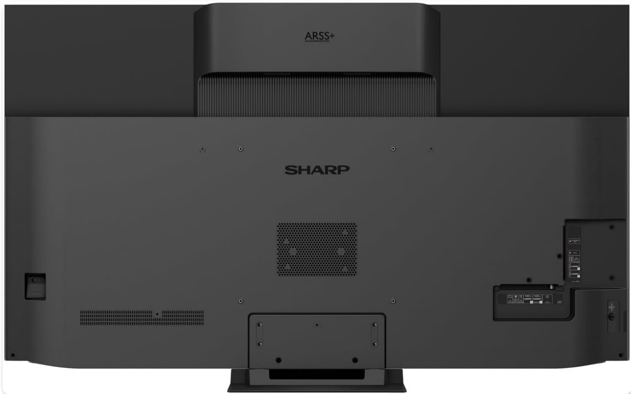
Figure 3: Side and back views illustrating the various input and output ports available on the Sharp AQUOS XLED TV.