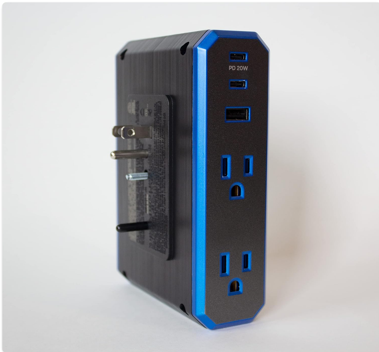
Figure 4: The Austere 4-Outlet Power Strip, showing its outlets and USB ports, and how it sits flush against a wall when plugged in.