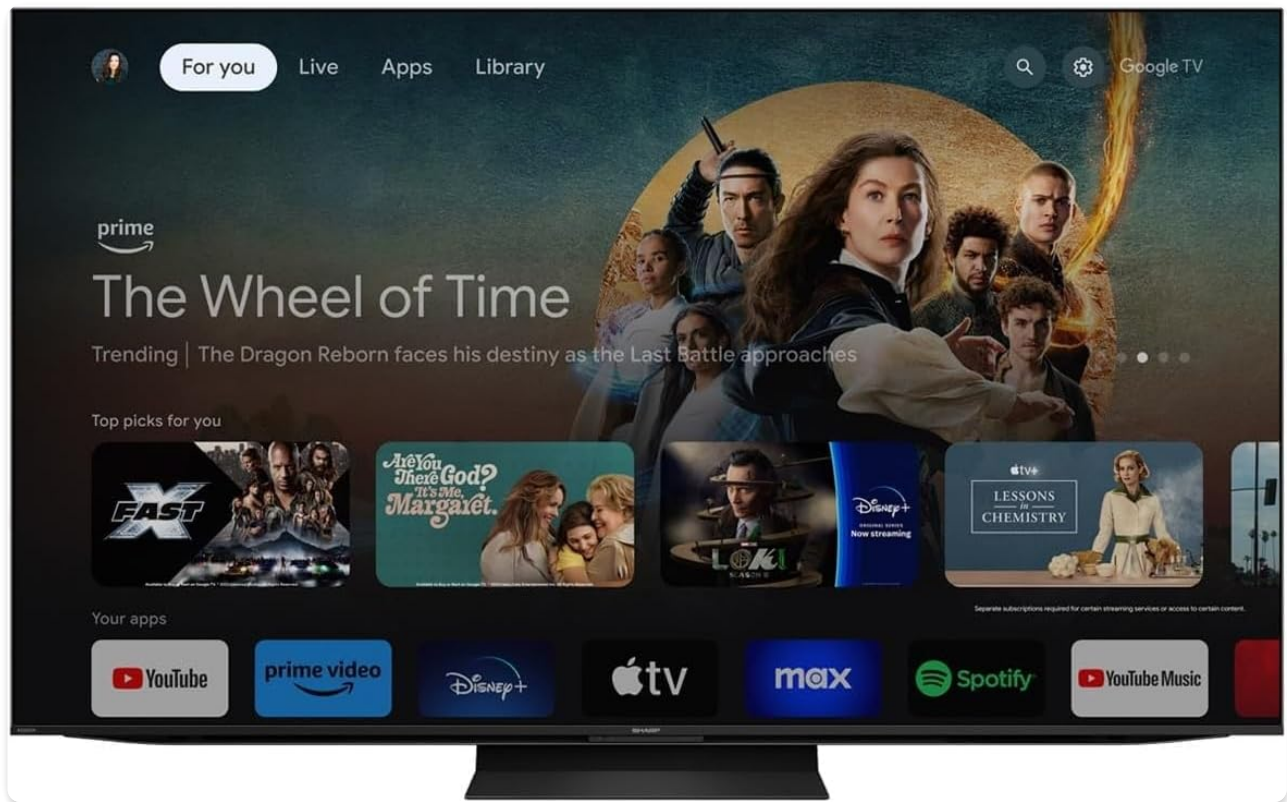
Figure 2: Front view of the Sharp AQUOS XLED 4K Google TV, showcasing its sleek design.