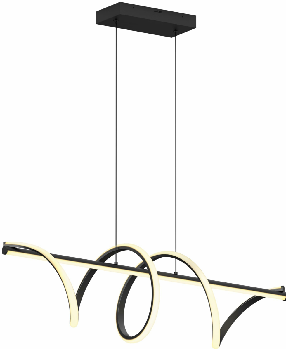
Image: The Artika CODA Modern LED Pendant Light.