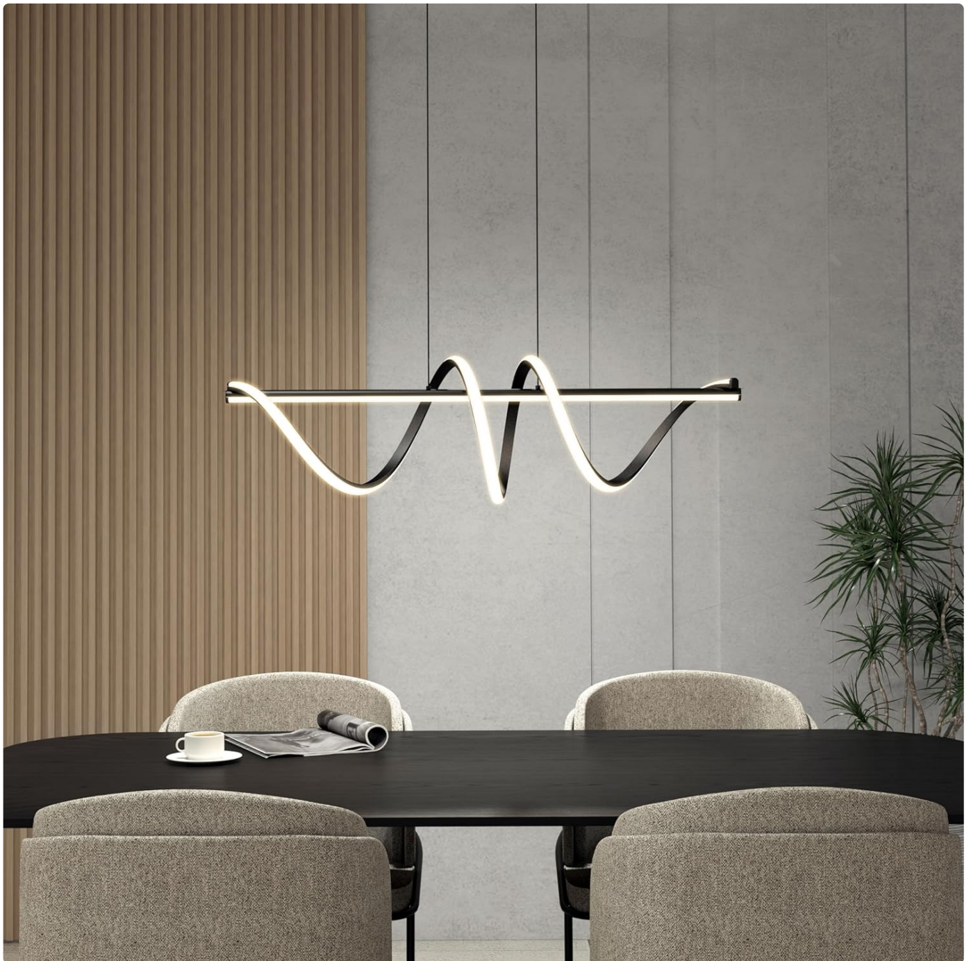
Image: The Artika CODA Pendant Light in a dining room setting.