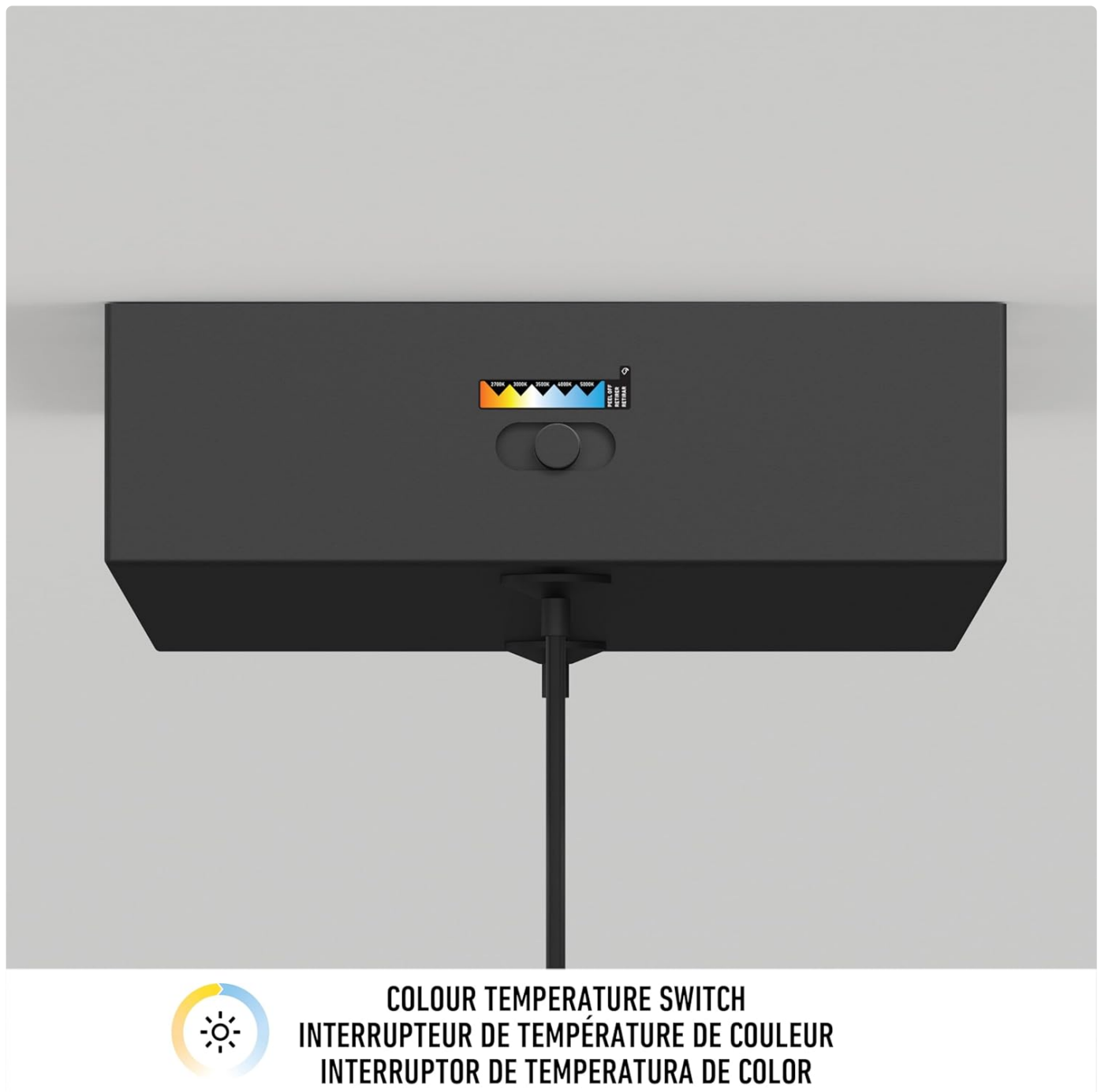
Image: Key features of the Artika CODA Pendant Light.