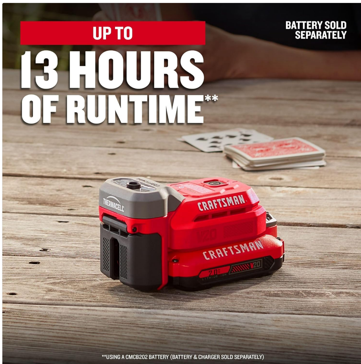
Image: The device demonstrating its long runtime capability.