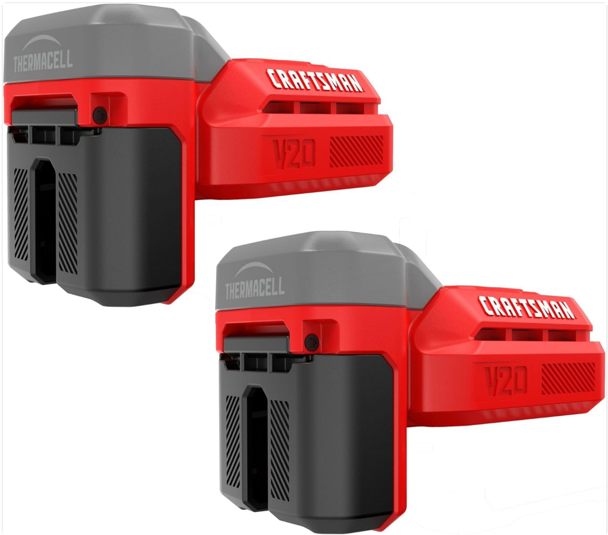
Image: Two CRAFTSMAN V20 Mosquito Repellent Devices, highlighting the product's design and dual-pack offering.