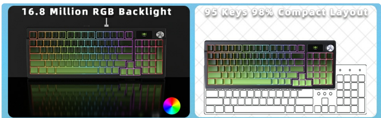
Image: The KUTETHY KY95 keyboard connected via its USB-C port for charging or wired use.

The keyboard is equipped with a 4000mAh battery. Before first use, it is recommended to fully charge the keyboard using the provided USB-C cable. Connect the USB-C end to the keyboard's port and the other end to a USB power source (e.g., computer, wall adapter).