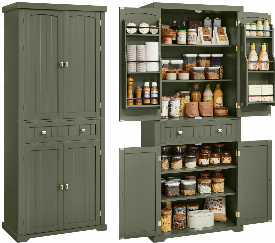
Figure 2: A full front view of the VASAGLE Pantry Cabinet, showcasing its design and overall appearance in a kitchen setting.