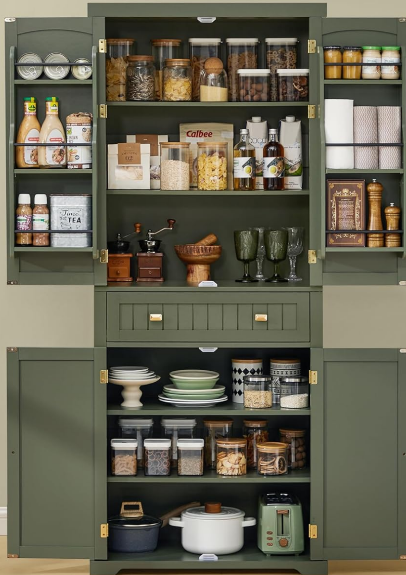
Figure 3: A visual representation of the adjustable shelves within the cabinet, illustrating the three available height options for flexible storage customization.