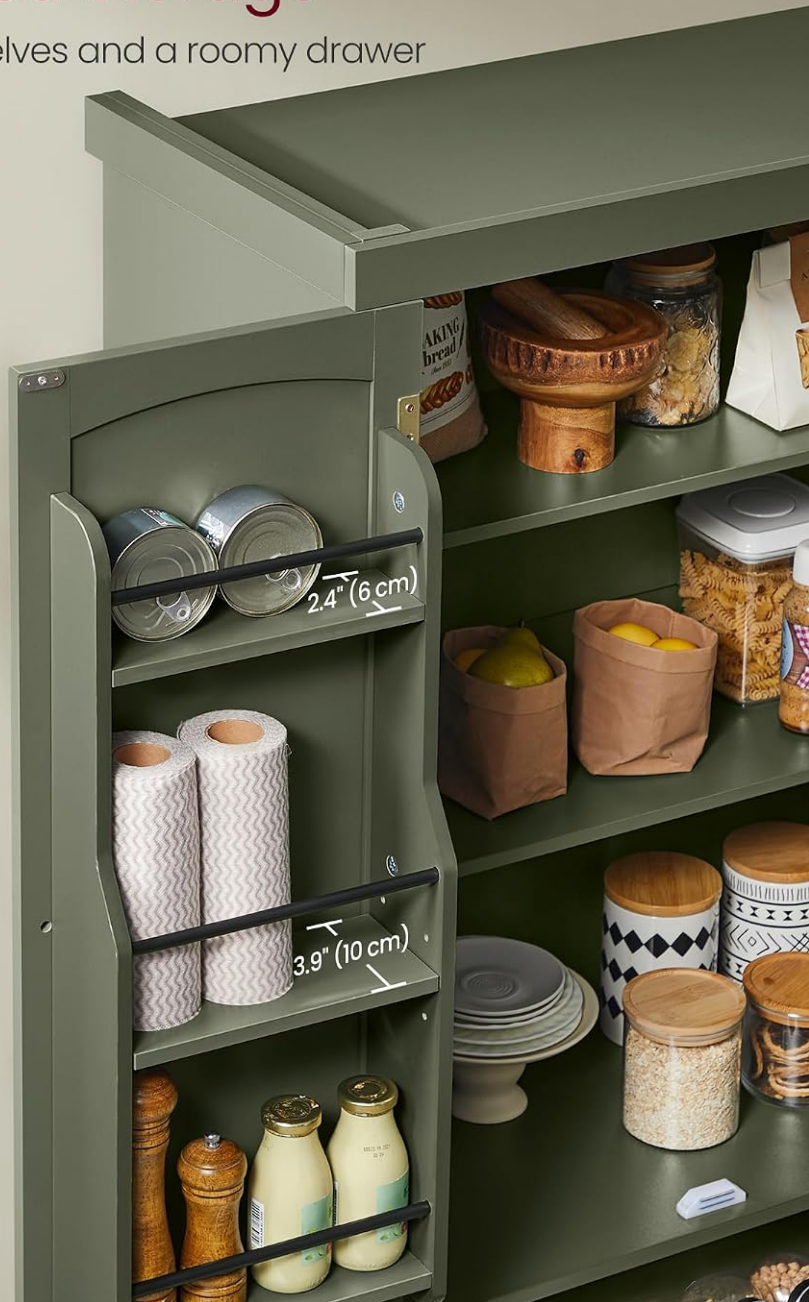
Figure 5: The cabinet fully open, showcasing its extensive storage capacity for a wide range of kitchen supplies, including pantry items, dishes, and small appliances.