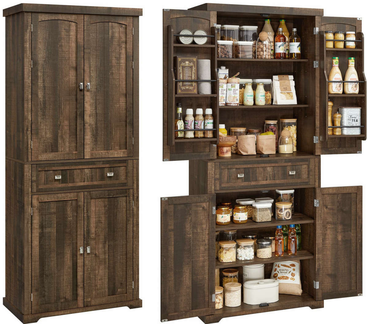
Image: The VASAGLE Pantry Cabinet UBBK561K01, showcasing its deep brown finish and overall design.