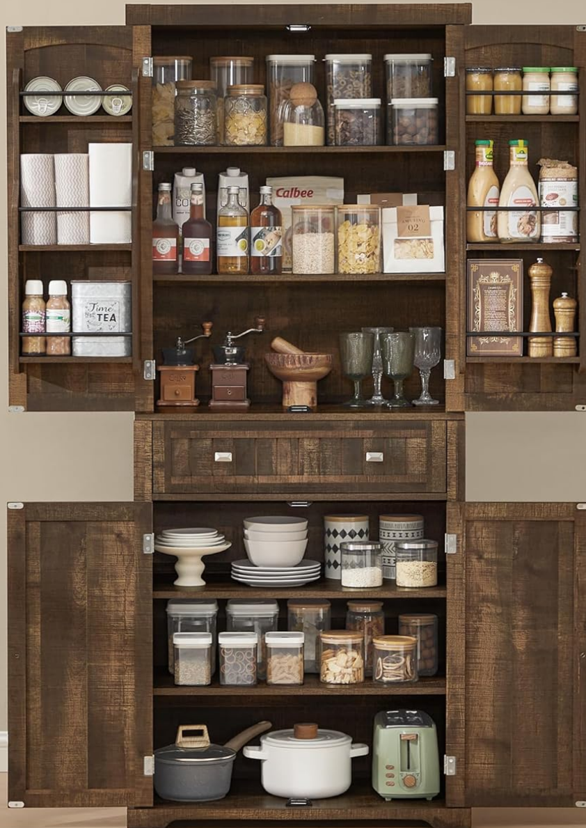
Image: Maximized storage with door shelves, illustrating how small items can be organized.