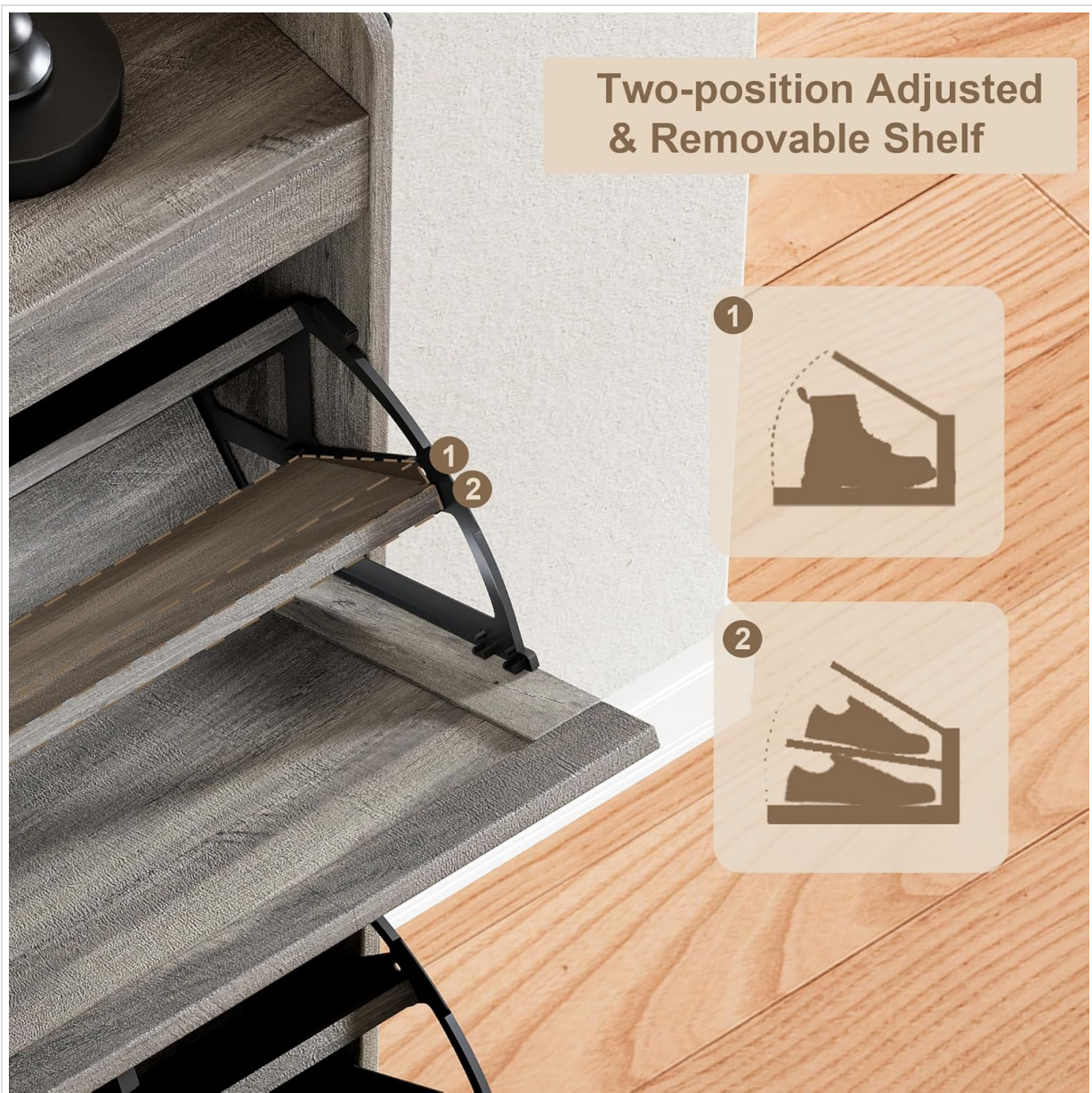
Image: Illustration of the adjustable and removable shelf, demonstrating how to customize storage space for various shoe types.