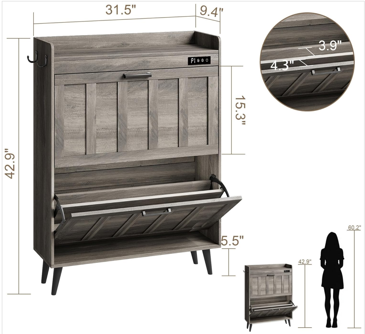
Image: Product dimensions of the ChooChoo Shoe Storage Cabinet, including height, width, and depth.

Video: A comprehensive guide to the Shoe Storage Cabinet Installation, demonstrating the assembly process.