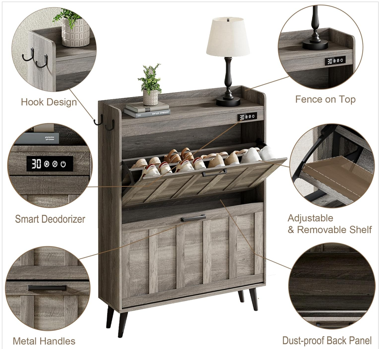
Image: An overview of the ChooChoo Shoe Storage Cabinet's key features, highlighting its design elements and functionalities.