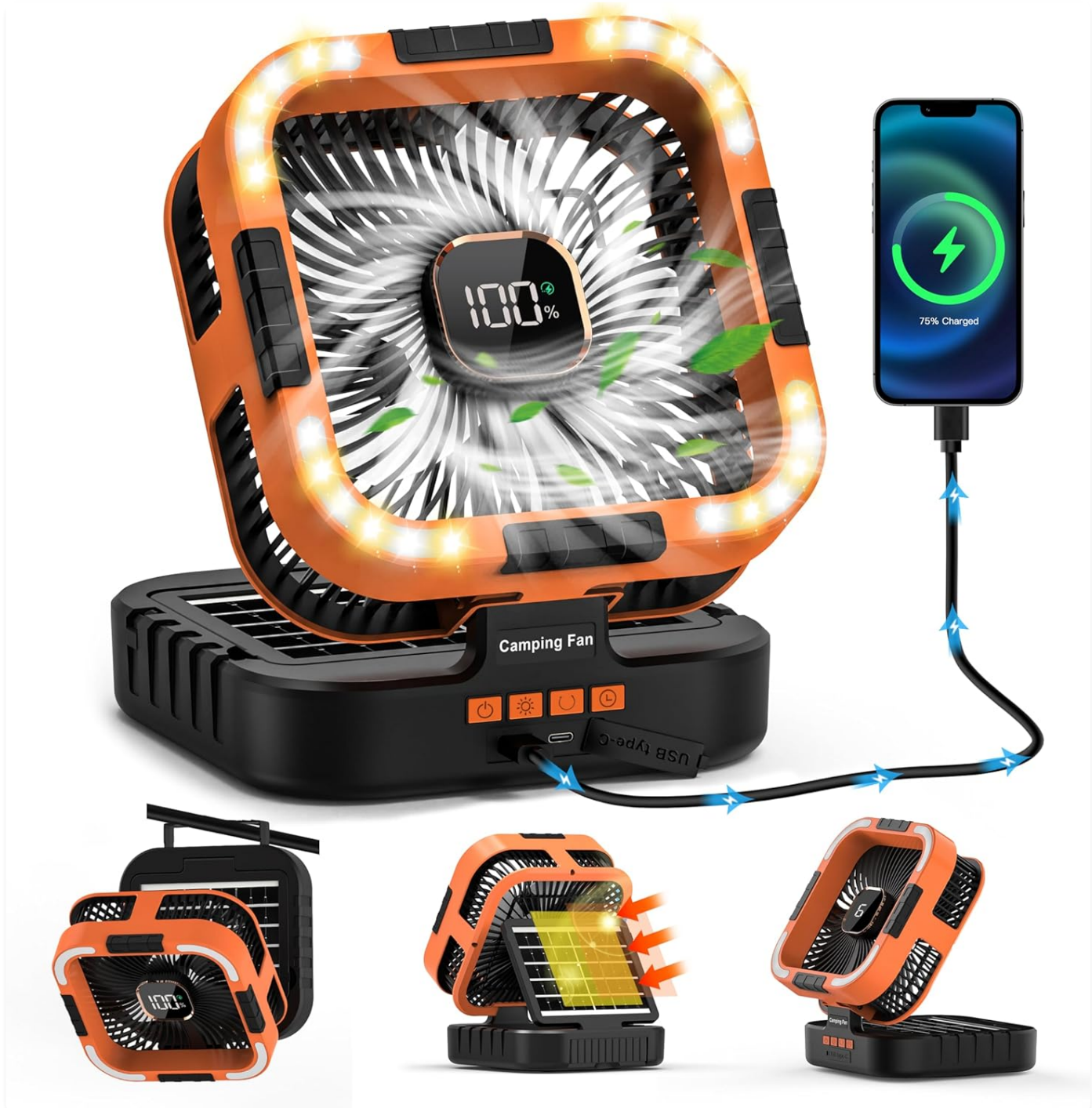
Image: The Sunoony Solar Camping Fan, showcasing its fan, LED light ring, and USB charging capability for a smartphone.