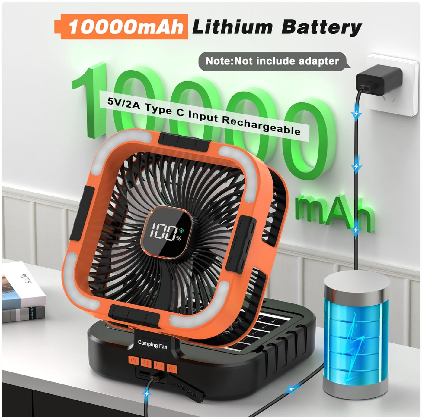
Image: The fan connected to a wall adapter via a Type-C cable, illustrating the charging process for its 10,000mAh battery.