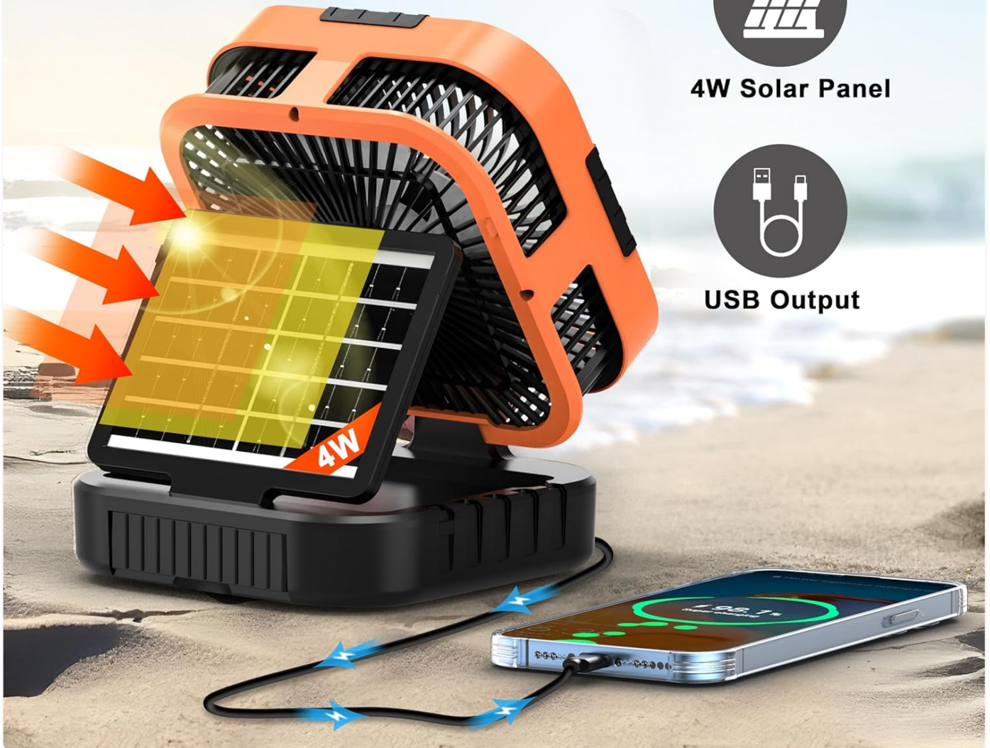
Image: The fan positioned with its solar panel angled towards the sun, demonstrating its solar charging capability.