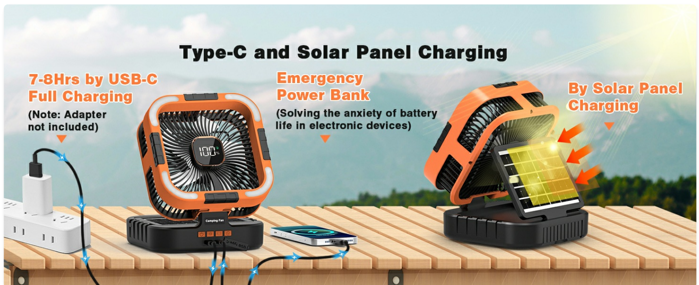
Image: A detailed view of the fan's control panel and display, highlighting the power, light, oscillation, and timer buttons, along with the USB Type-C input and USB output ports.