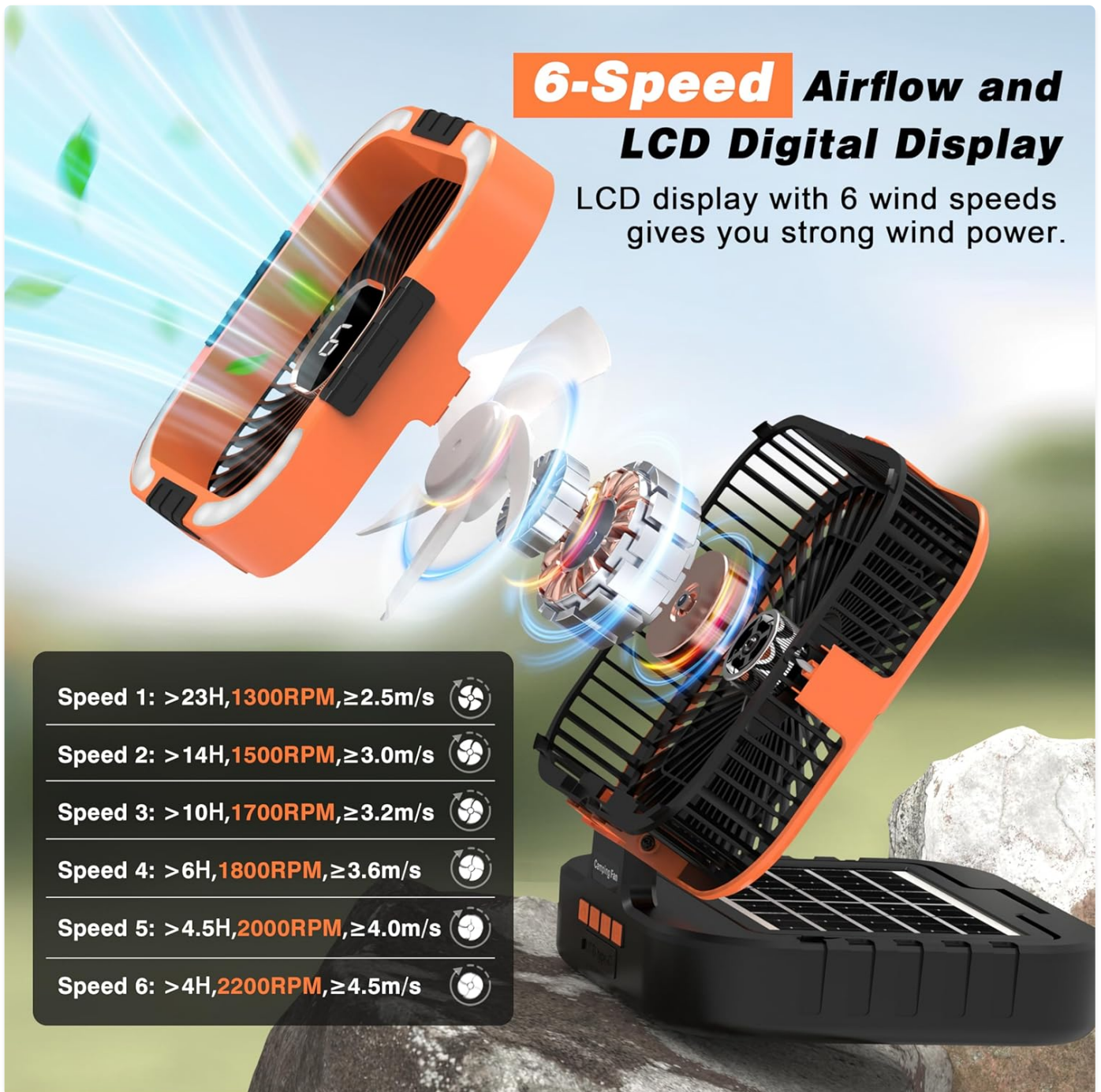
Image: Visual representation of the fan's 6-speed airflow settings, indicating RPM and air velocity for each speed.

3. Power Off: Continue pressing the power button until the fan turns off, or long-press the power button.