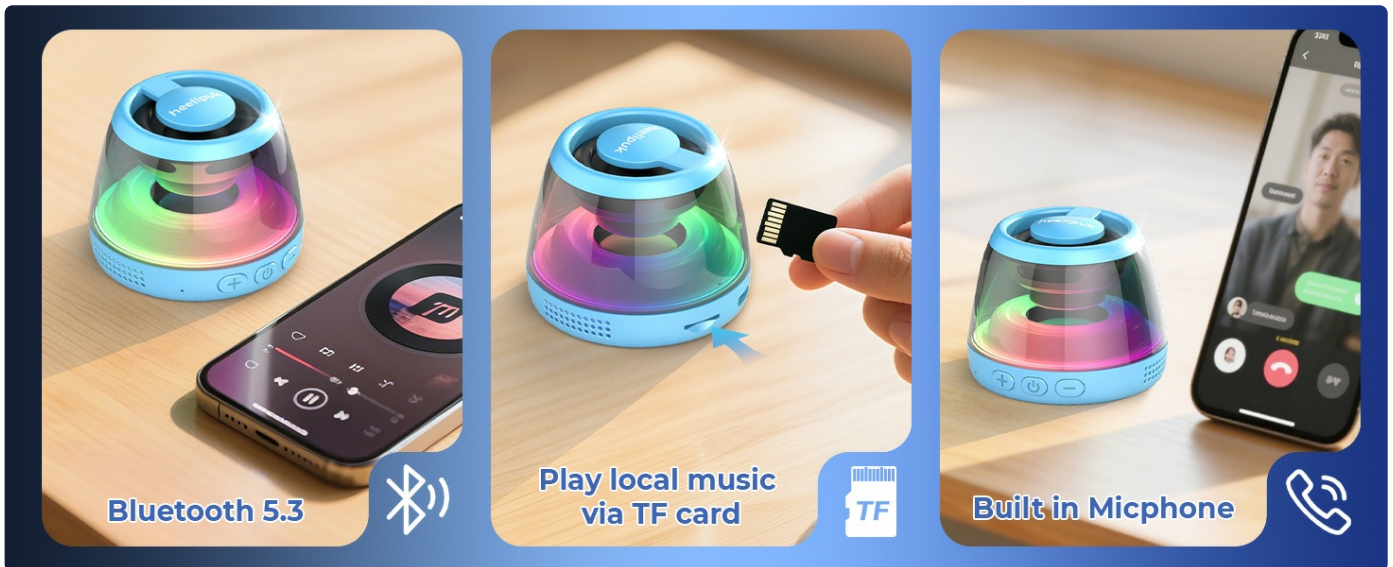
Figure 5: Connectivity Options.

Video 1: Demonstrating the magnetic attachment and phone stand features of the heetipuk M2 speaker.