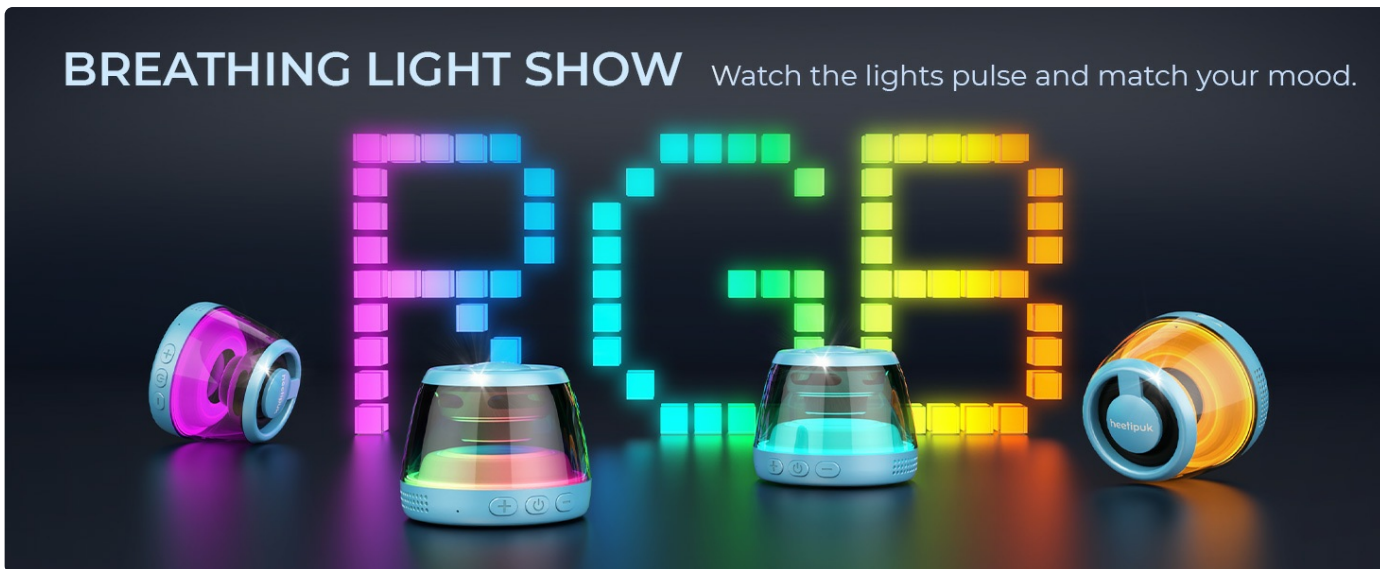
Figure 7: Vibrant RGB Lighting.

Watch the lights pulse and match your mood.