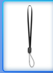
1 x Lanyard