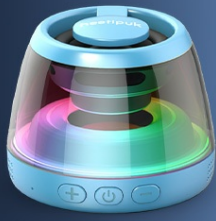
1 x Mini Magnetic Speaker