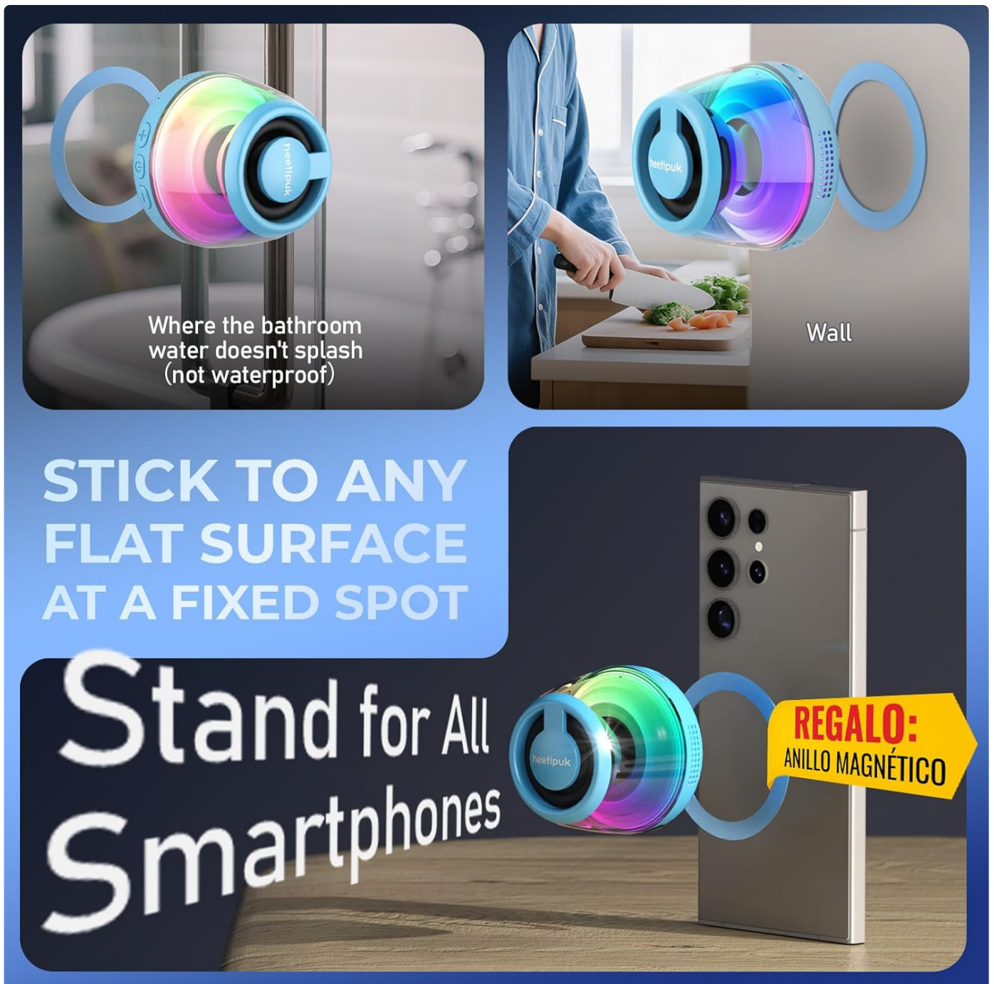
Figure 4: Magnetic Attachment Options.