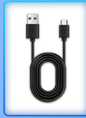
1 x Charging Cable