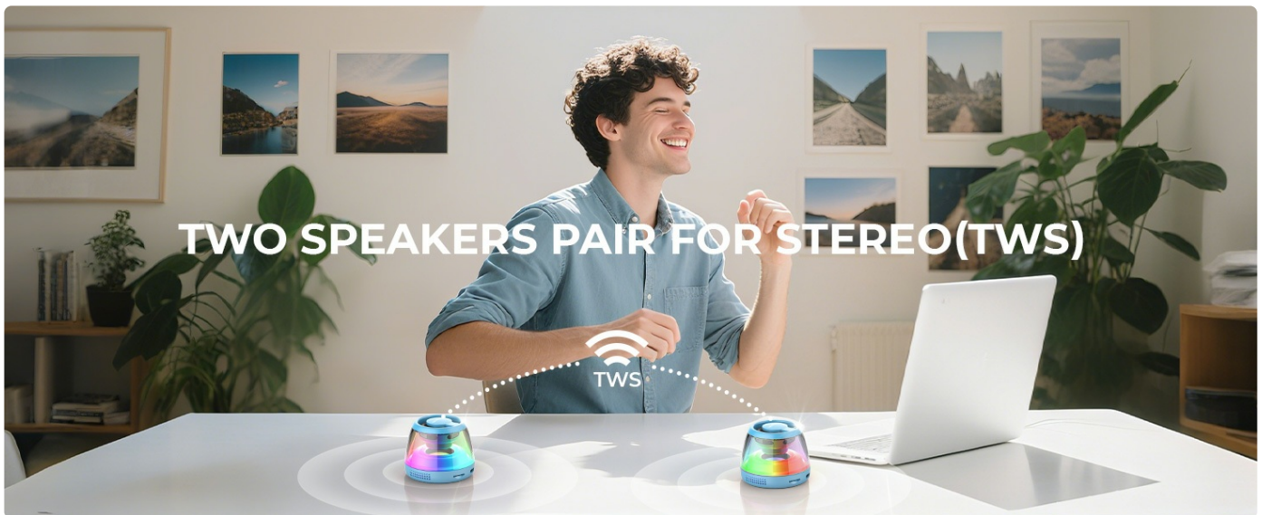
Figure 6: TWS Functionality.

The heetipuk M2 speaker supports TWS, allowing two M2 speakers to pair together for a stereo audio experience. Refer to the specific TWS pairing instructions in the included physical user manual for detailed steps.