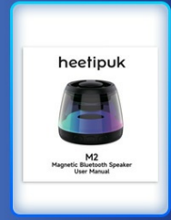
1 x User Manual