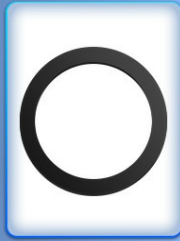
1 x Magnetic Sticker