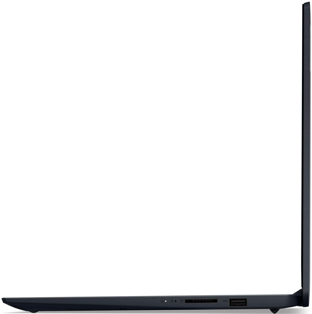
Image: Right side of the laptop showing the headphone/microphone combo jack, card reader, and another USB-A port.