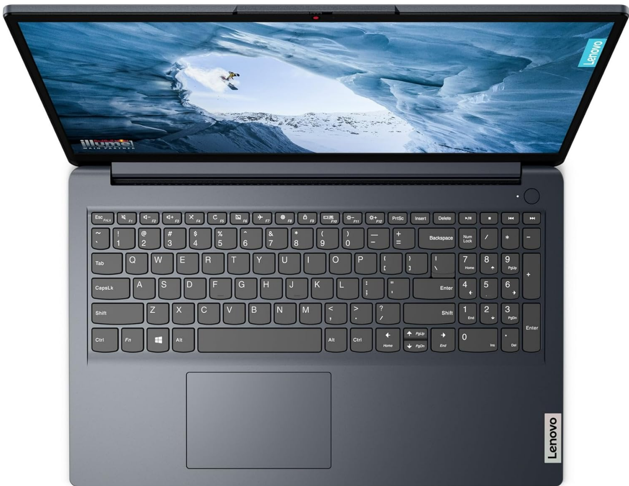
Image: A top-down view of the laptop's keyboard, including the numeric keypad, and the touchpad.