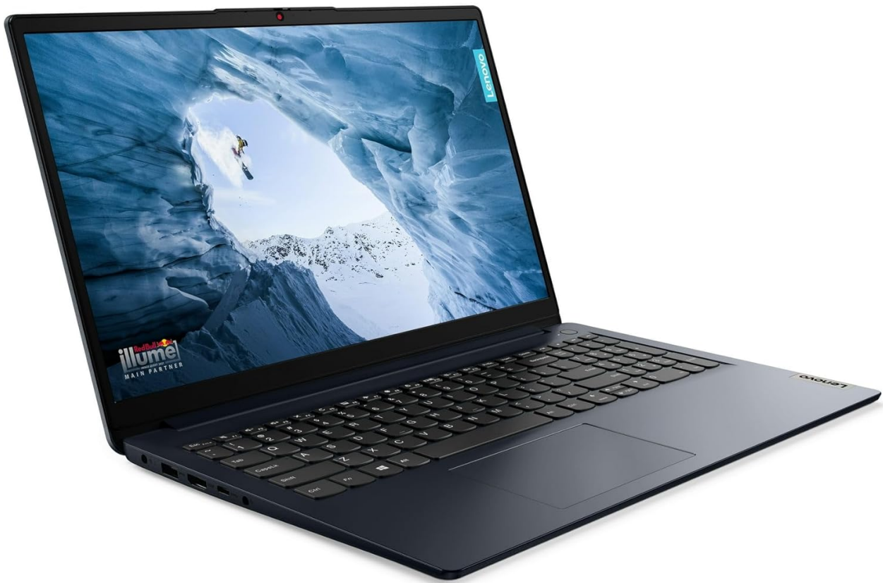
Image: The Lenovo IdeaPad 1 15AMN7 laptop shown open at an angle, displaying its screen and keyboard.