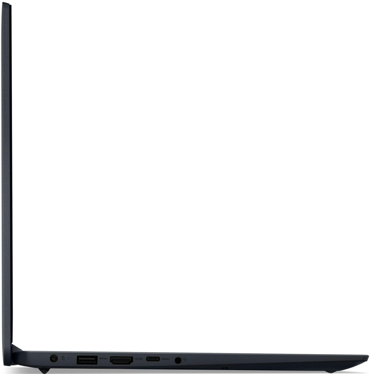
Image: Left side of the laptop showing the power input, USB-A, HDMI, and USB-C ports.