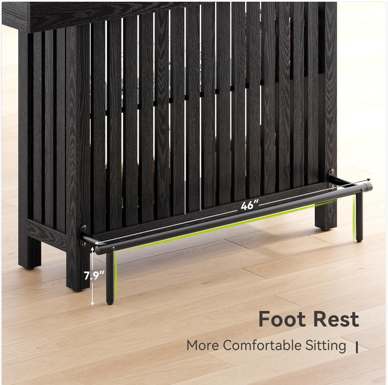
Image 4.1: Product dimensions and weight capacities for the bar table.