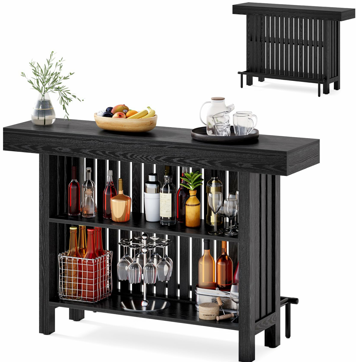
Image 1.1: The LITTLE TREE 63-Inch Home Bar Table in a modern kitchen environment.